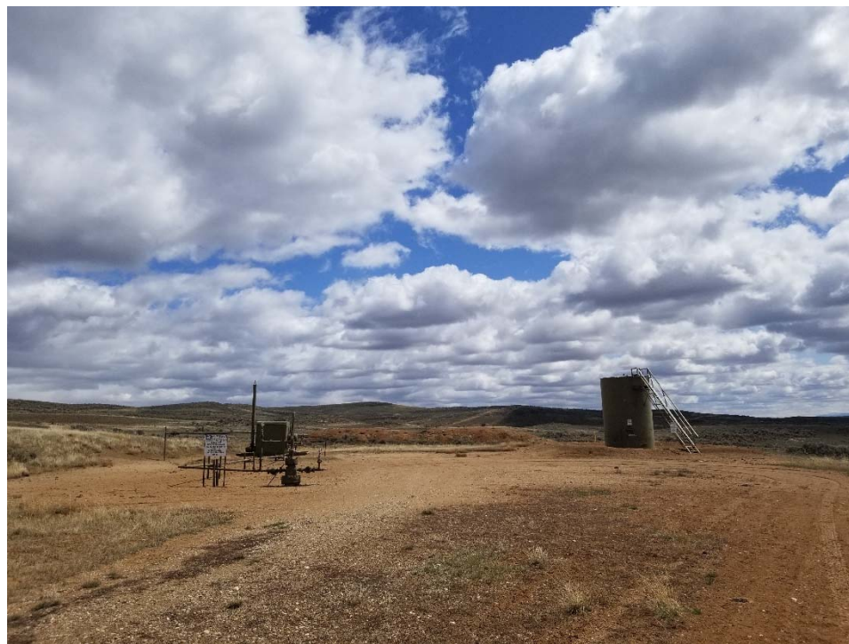
Photo 1. Overview of location taken facing south.