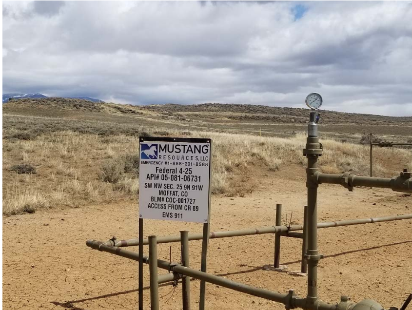
Photo 2. Wellhead sign incomplete/inaccurate.