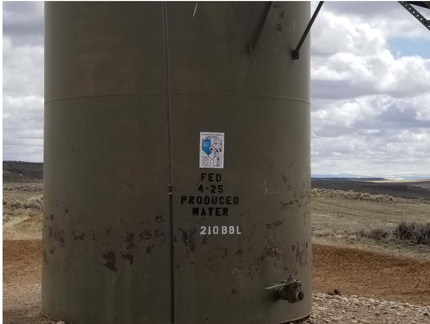
Photo 4. Incomplete/inaccurate tank label.