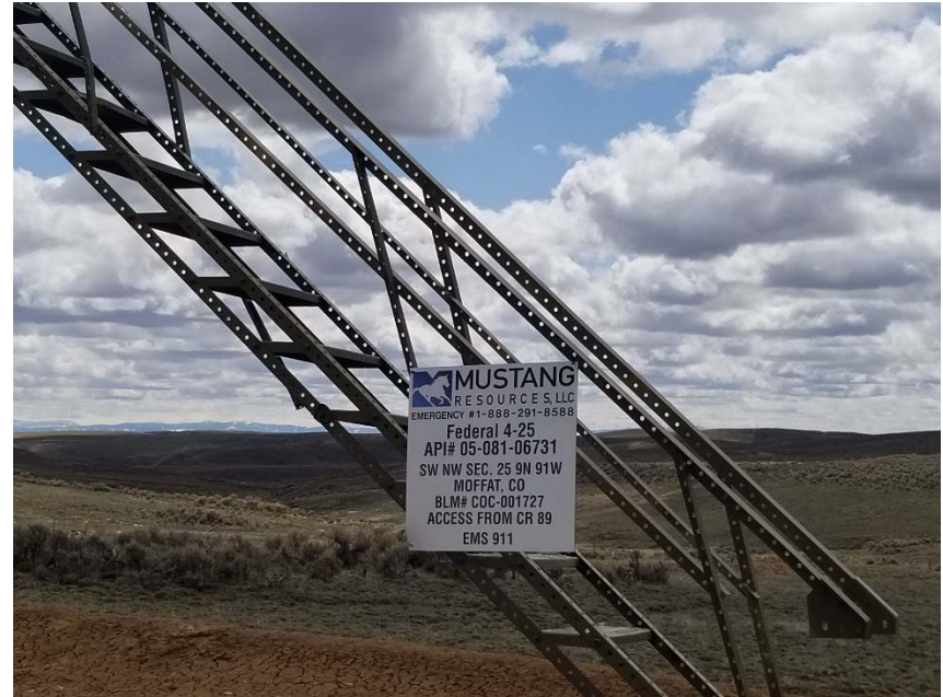
Photo 5. Incomplete/inaccurate battery sign.