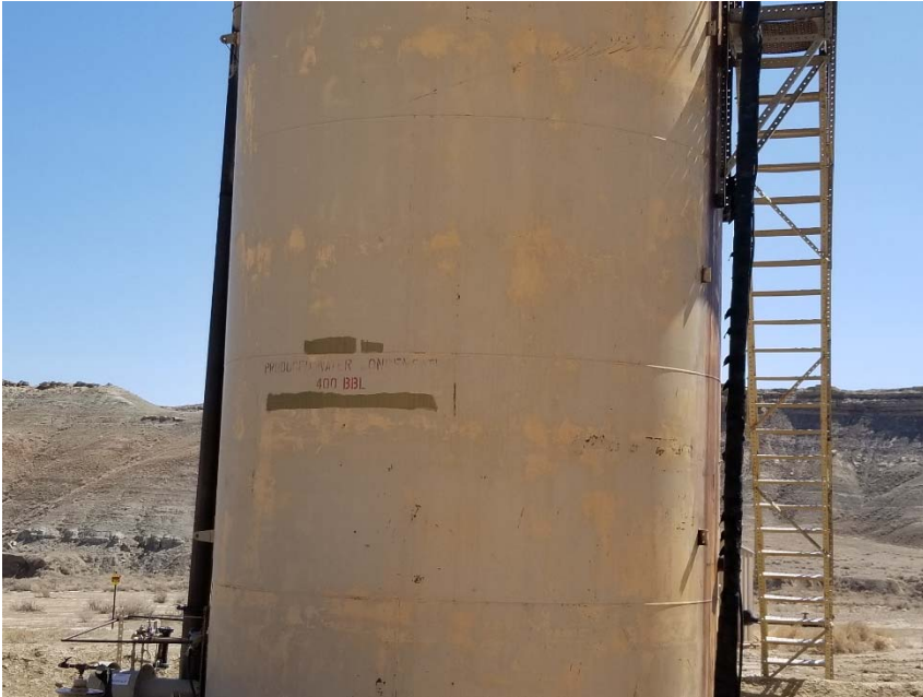
Photo 3. Tank label incomplete and faded.