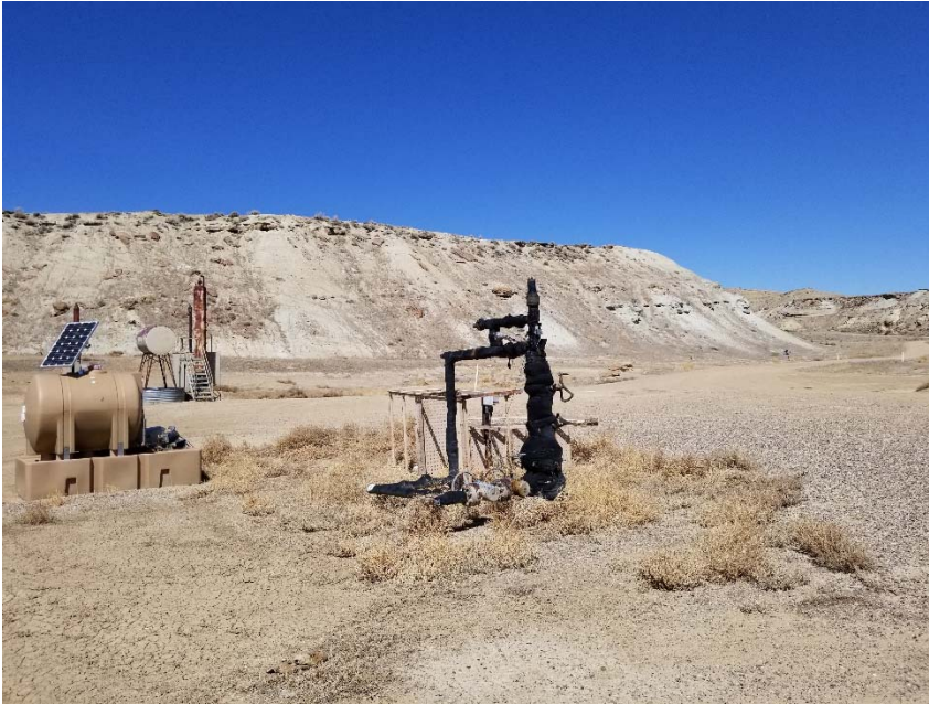
Photo 1. Overview of location taken facing northwest. Dried annual weeds on location.