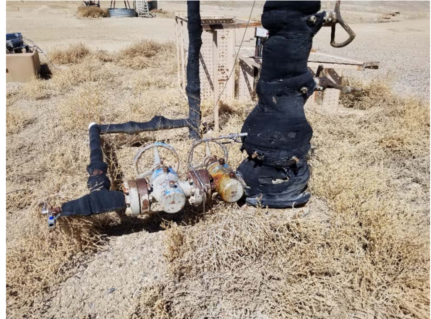
Photo 2. No bradenhead access apparent. Dried annual weeds on location.