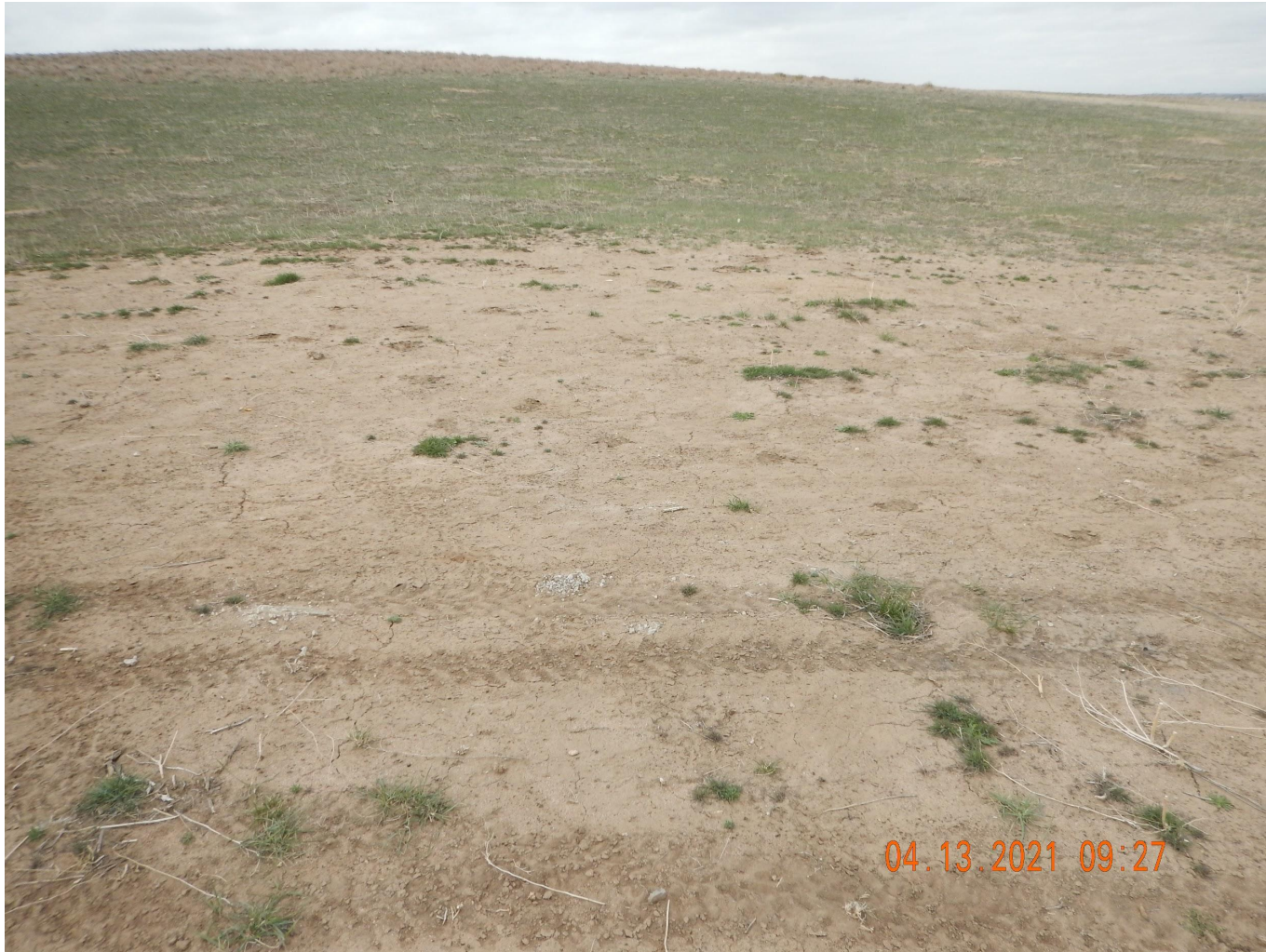
Photo 7. Photo taken from the well location, facing West. Photo illustrates little to no establishment of desirable plant species.