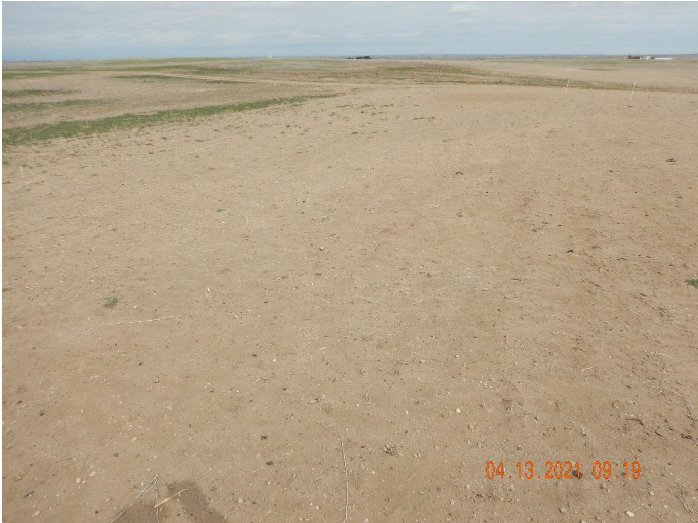
Photo 3. Photo taken from PDC's shared portion of the tank battery, facing North. See comments under Photo 2.