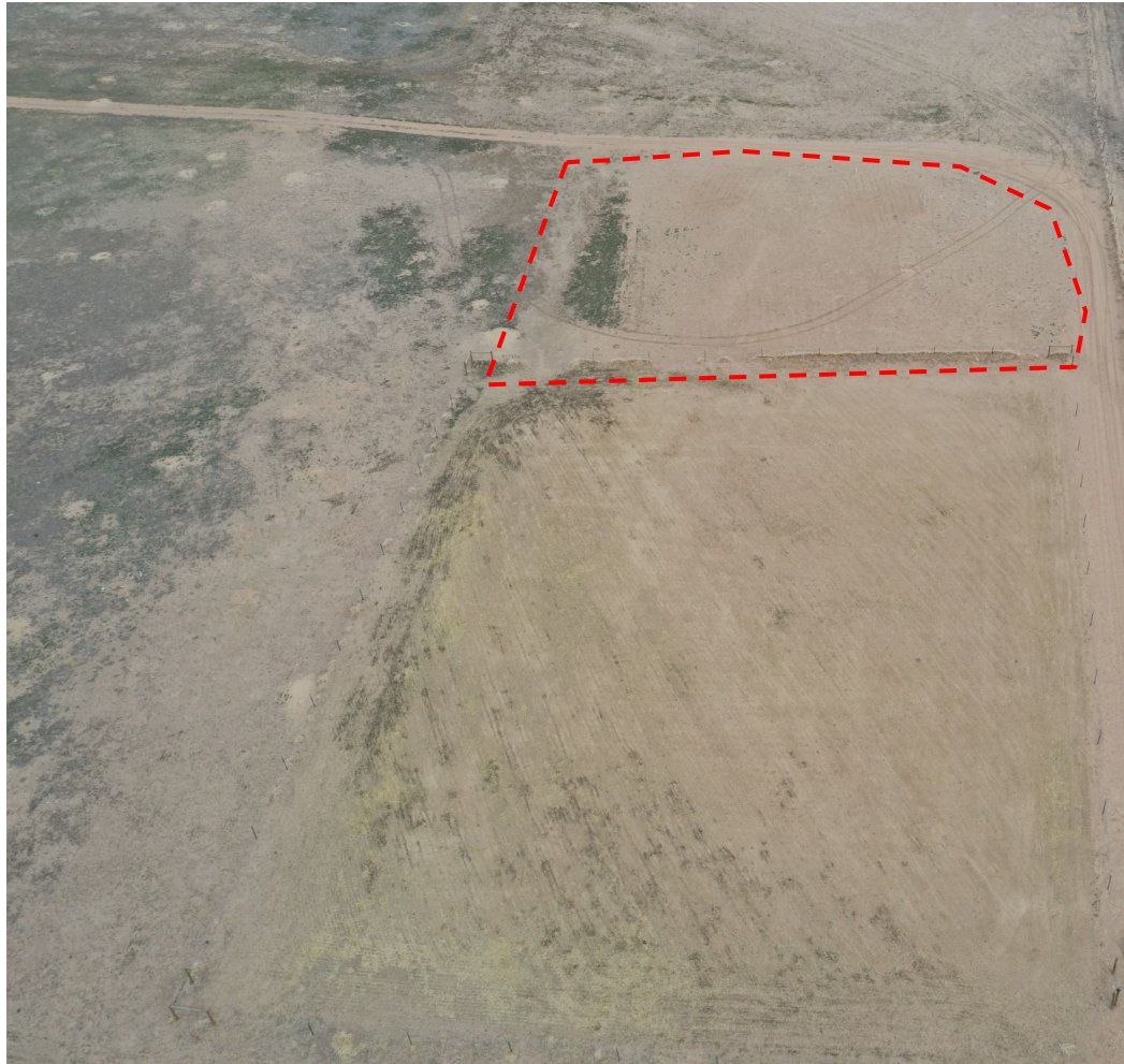
Photo 1. Drone aerial imagery from 4/13/2021 illustrates the associated offsite tank battery which was a shared tank battery. PDC's shared portion is highlighted in the red-dashed line. Wind erosion was observed on PDC's shared portion of the tank battery which is transporting sediment offsite, some of which is going onto Noble's shared portion.