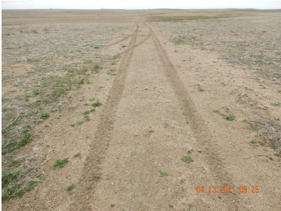
Photo 5. Photo taken from a portion along the well location access road, facing Southeast. Photo illustrates the access road has not been properly reclaimed.