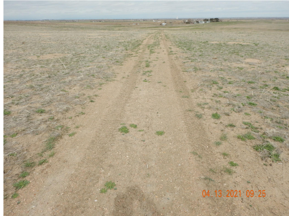
Photo 6. Photo taken from a portion along the well location access road, facing Northwest. See comments under Photo 5.