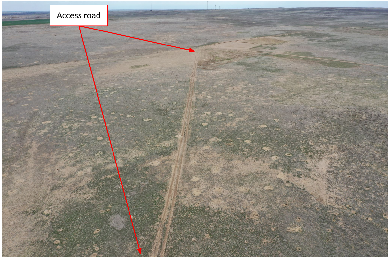
Photo 4. Drone aerial imagery from 4/13/2021, facing Southeast. Photo illustrates the well location access road which has not been properly reclaimed.