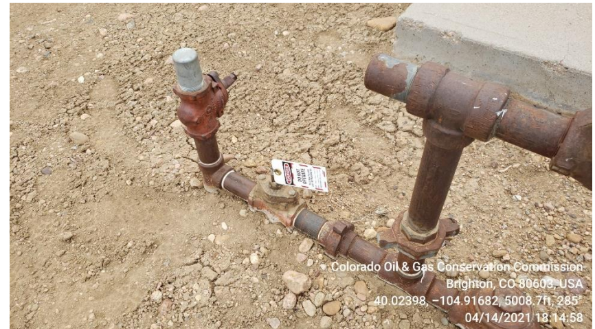
Photo 4 Valve closed and tagged ou