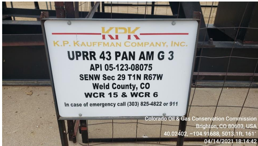
Photo 1 WH sign