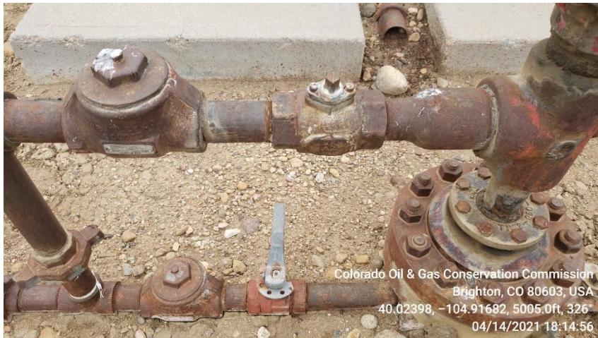
Photo 3 Valve closed