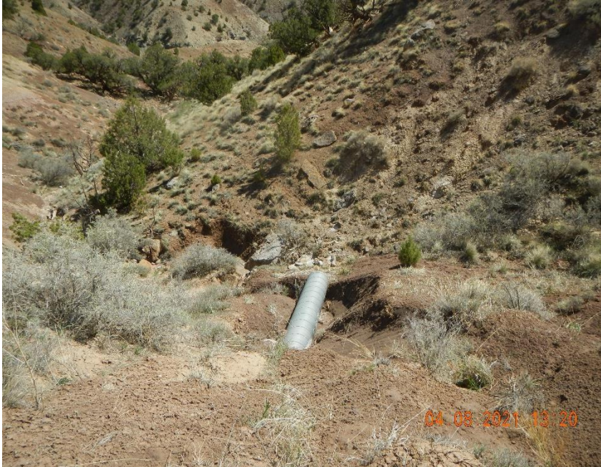
Culvert needs maintained/repaired. 39.48725 108.06422