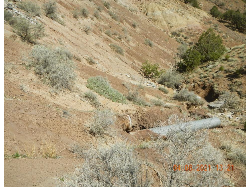
Culverts are not jointed together.