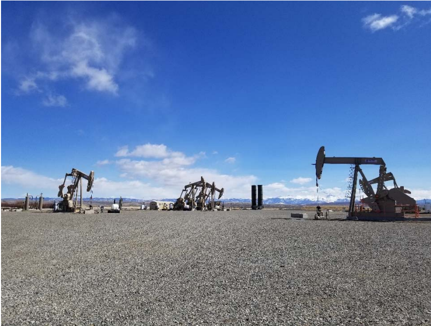
Photo 1. Overview of location taken at entrance facing northeast.