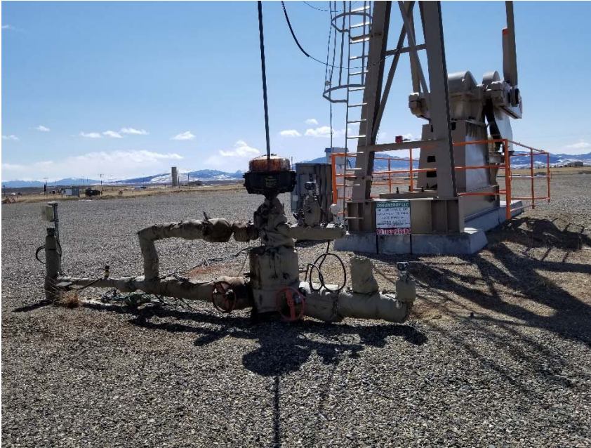
Photo 9. Incomplete wellhead sign.