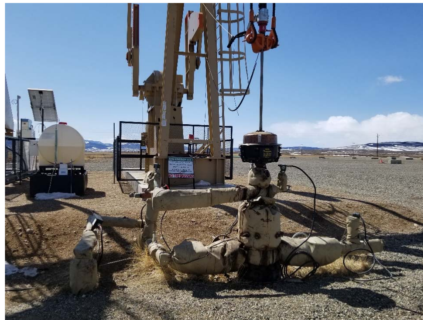
Photo 8. Incomplete wellhead sign.