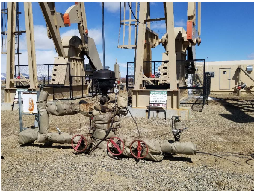
Photo 5. Incomplete wellhead sign.