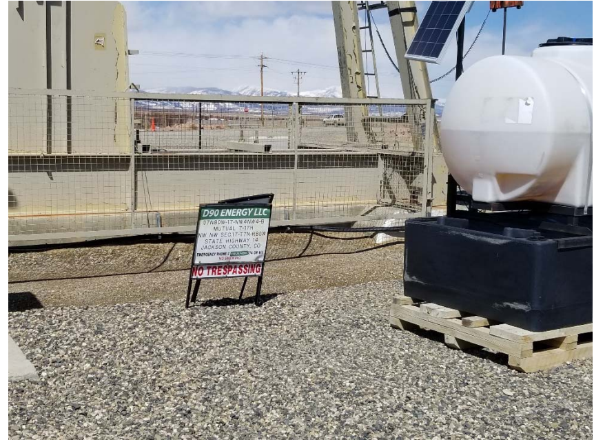
Photo 2. Incomplete wellhead sign.