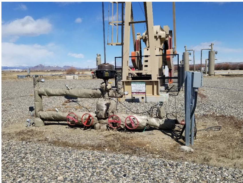
Photo 3. Incomplete wellhead sign.