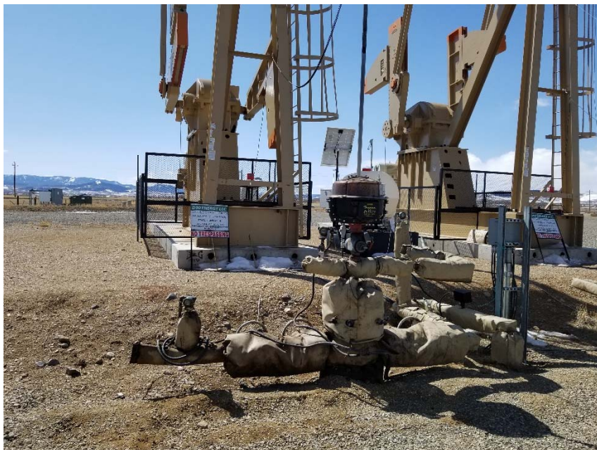
Photo 7. Incomplete wellhead sign.