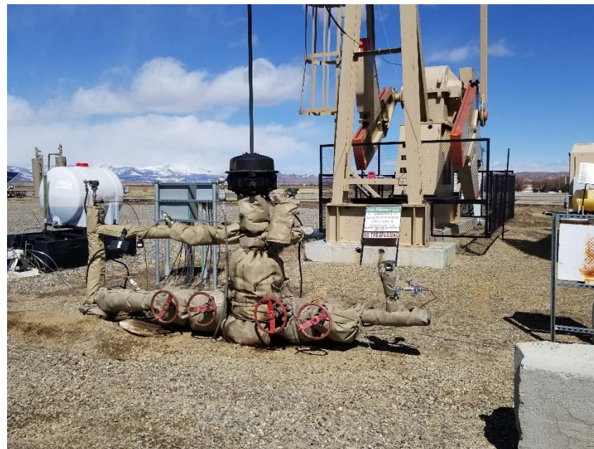
Photo 4. Incomplete wellhead sign.