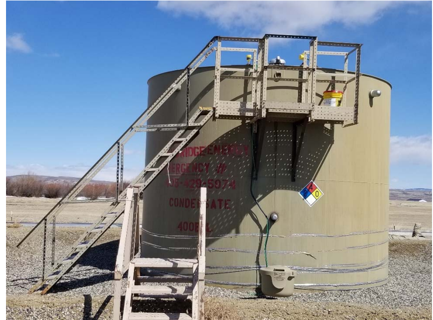
Photo 10. Inaccurate tank label.