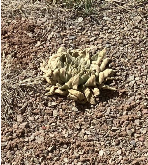
COMMON MULLEIN ROSETTE

APACHE CANYON 02-03 API# 05-071-08347 – TIMBER CREEK OPERATING OGCC OPERATOR NUMBER 10672 - DATE: APRIL 09, 2021 CORRECTIVE ACTIONS COMPLETED REGARDING COGCC FIR DOCUMENT # 695103276