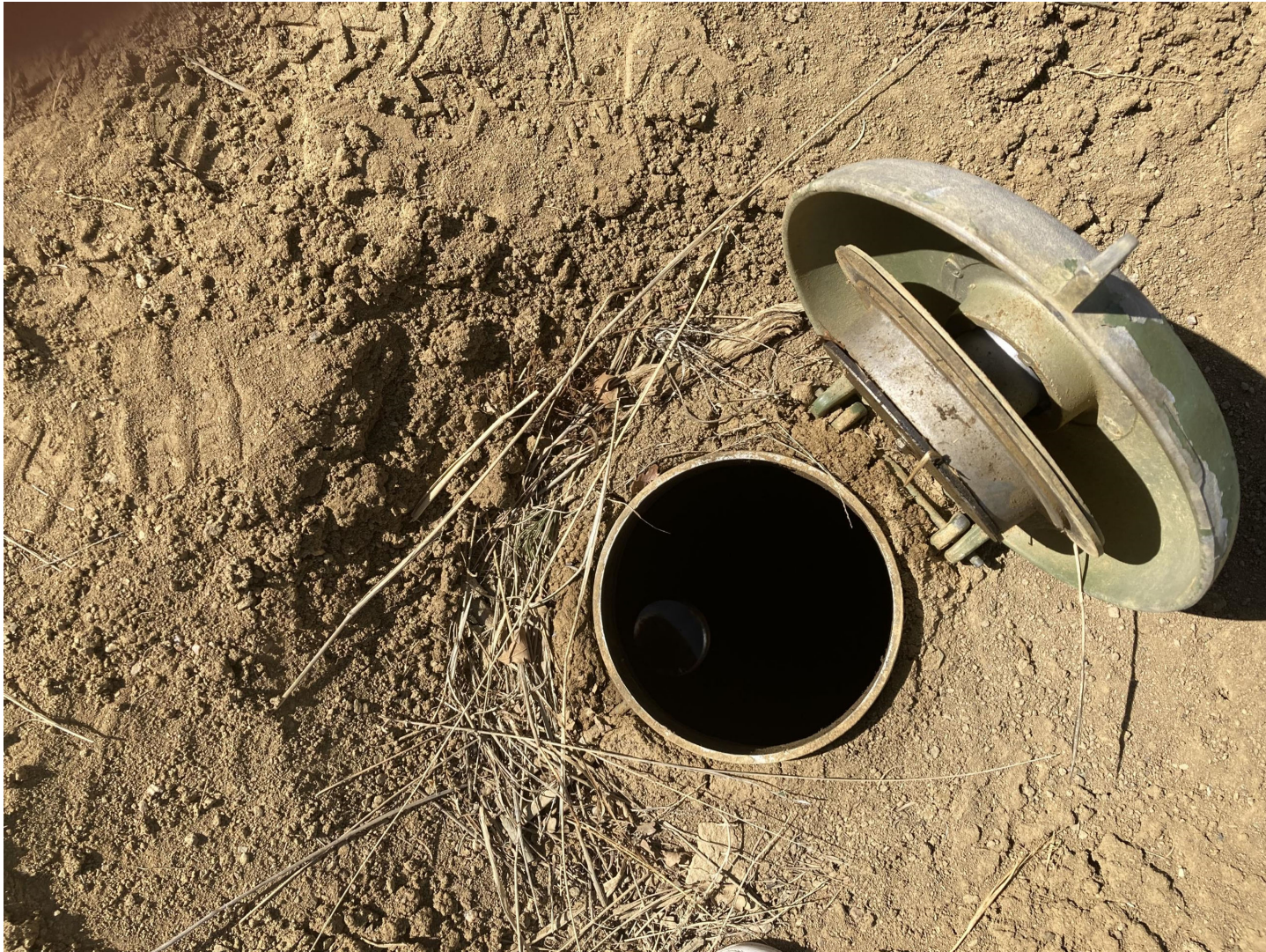
PHOTO 6: THE SCRUBBER LIQUID WAS REMOVED FROM THE PRODUCED WATER TANK AND DISPOSED OF PER OGRIS'S WASTE MANAGEMENT PLAN AND THE COGCC RULES AND REGULATIONS.

APACHE CANYON 02-03 API# 05-071-08347 – TIMBER CREEK OPERATING OGCC OPERATOR NUMBER 10672 - DATE: APRIL 09, 2021 CORRECTIVE ACTIONS COMPLETED REGARDING COGCC FIR DOCUMENT # 695103276