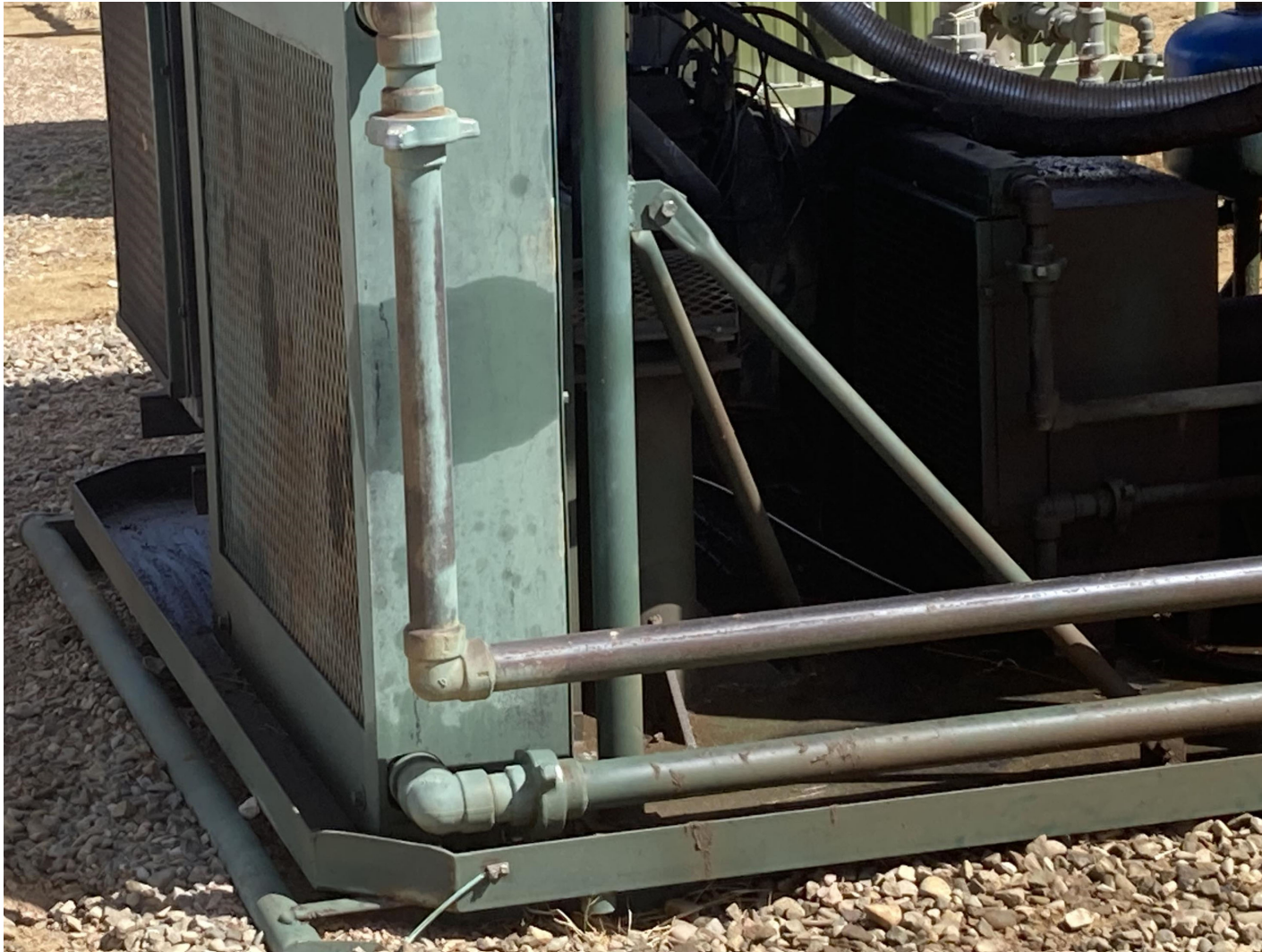
PHOTO 4: THE FLUID ACCUMULATION ON THE LIQUID RING COMPRESSOR SKID WAS CLEANED UP.

APACHE CANYON 02-03 API# 05-071-08347 – TIMBER CREEK OPERATING OGCC OPERATOR NUMBER 10672 - DATE: APRIL 09, 2021 CORRECTIVE ACTIONS COMPLETED REGARDING COGCC FIR DOCUMENT # 695103276