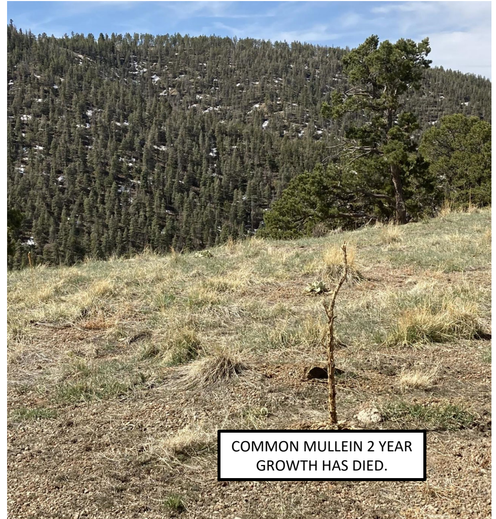
COMMON MULLEIN 2 YEAR GROWTH HAS DIED.

PHOTO 2: THE COMMON MULLEIN FROM LAST YEAR HAVE DIED. OGRIS OPERATING WILL BEGIN SPRING WEED TREATMENT ONCE WEATHER CONDITIONS ARE FAVORABLE FOLLOWED BY FALL TREATMENT.