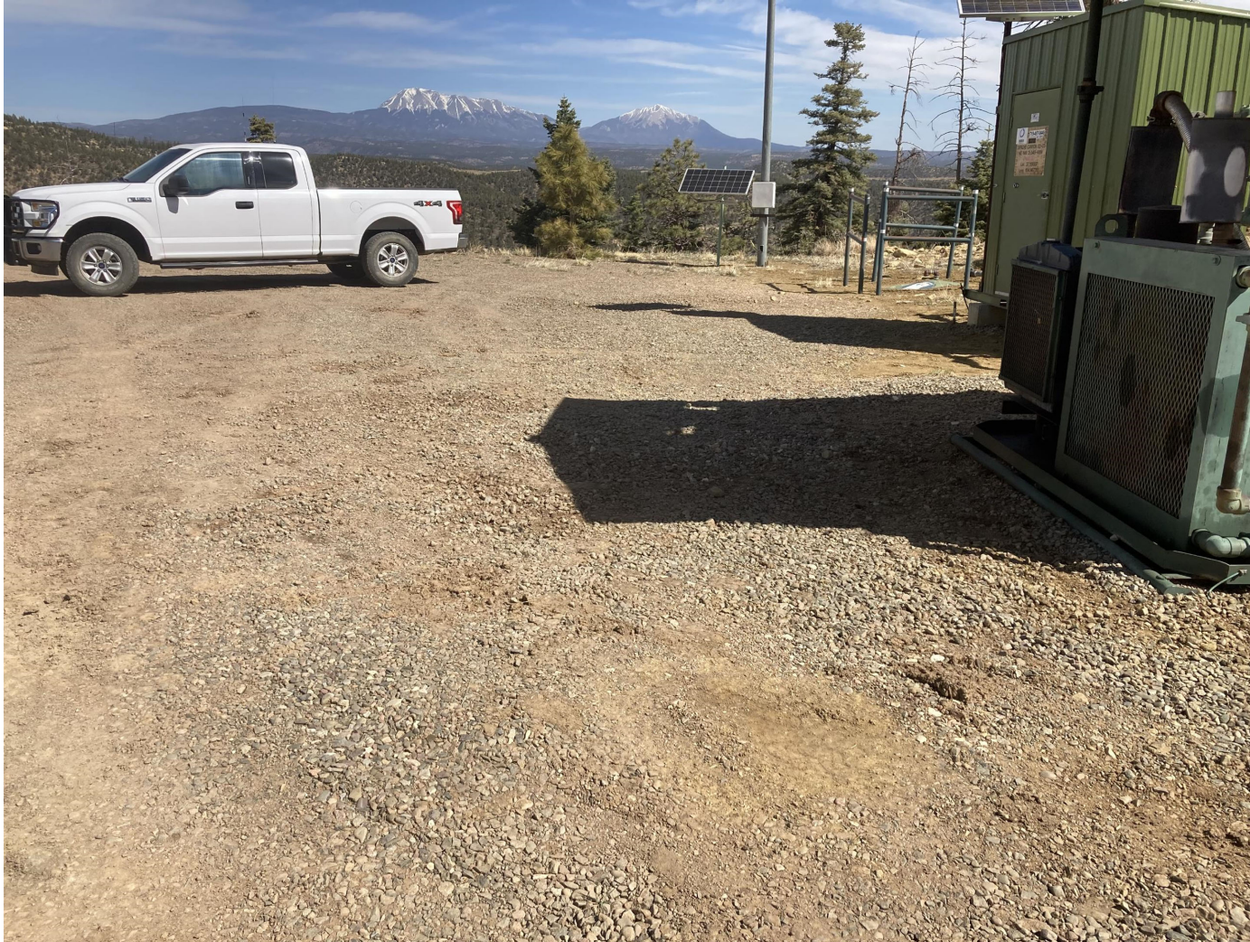
PHOTO 5: THE IMPACTED SOIL ON LOCATION WAS REMOVED AND PROPERLY DISPOSED IN ACCORDANCE WITH THE OGRIS OPERATING WASTE MANAGEMENT PLAN.

APACHE CANYON 02-03 API# 05-071-08347 – TIMBER CREEK OPERATING OGCC OPERATOR NUMBER 10672 - DATE: APRIL 09, 2021 CORRECTIVE ACTIONS COMPLETED REGARDING COGCC FIR DOCUMENT # 695103276