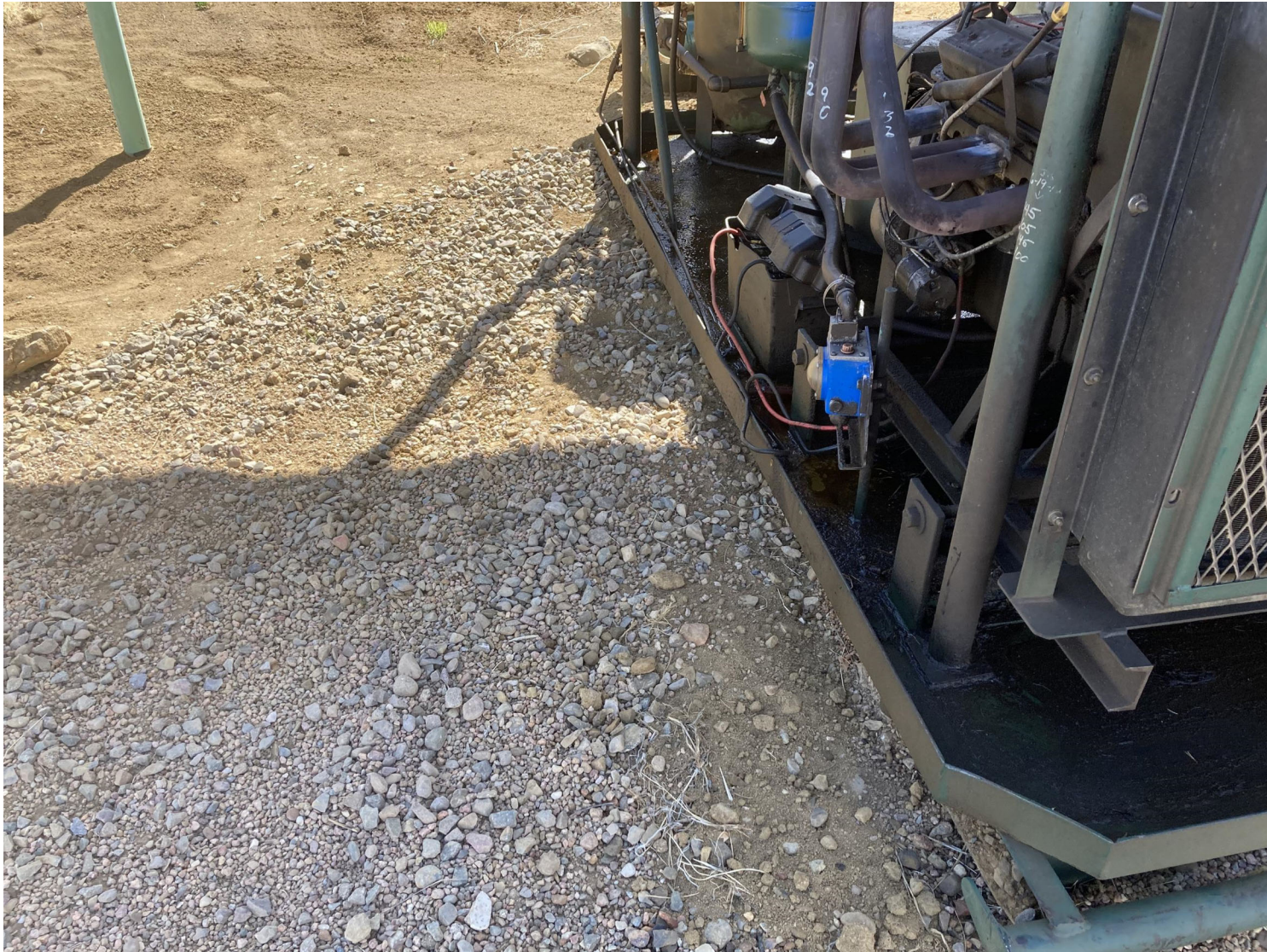
PHOTO 3: THE IMPACTED SOIL/GRAVEL NEAR THE LIQUID RING COMPRESSOR AND AROUND THE LOCATION WERE CLEANED UP AND REMOVED FROM THE LOCATION.

APACHE CANYON 02-03 API# 05-071-08347 – TIMBER CREEK OPERATING OGCC OPERATOR NUMBER 10672 - DATE: APRIL 09, 2021 CORRECTIVE ACTIONS COMPLETED REGARDING COGCC FIR DOCUMENT # 695103276