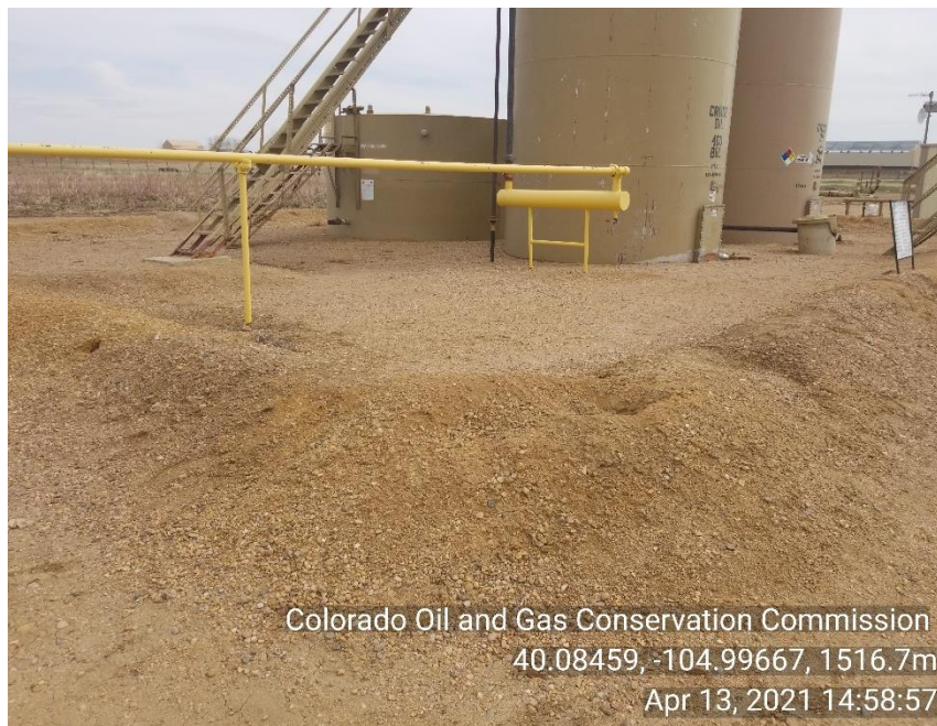
Photo 7 Secondary containment in disrepair.