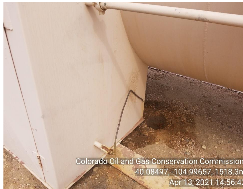
Photo 4 Improper discharge of fluid, separator being dumped on ground. Stained soil.