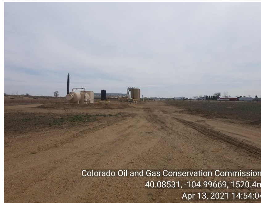
Photo 2 production equipment. Ruts on road and location no BMP's.