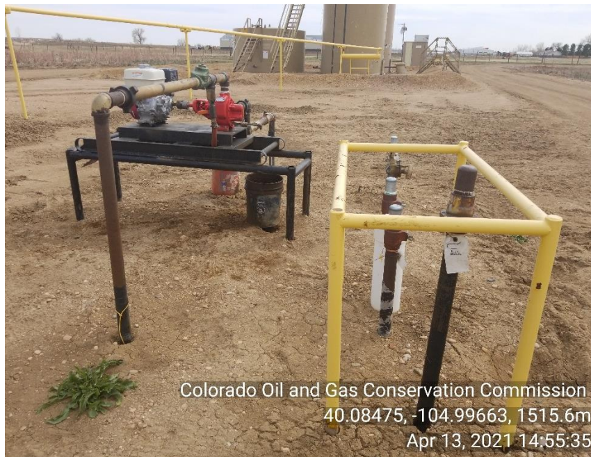
Photo 3 Stained soil under recirc pump. Improper BMP under pump. Risers tags are missing, faded, or torn.