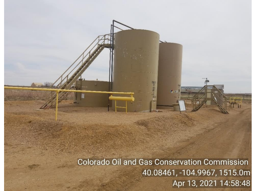
Photo 6 TNK BTRY. Secondary containment in disrepair Not adequate height and Prairie dog holes throughout berm.