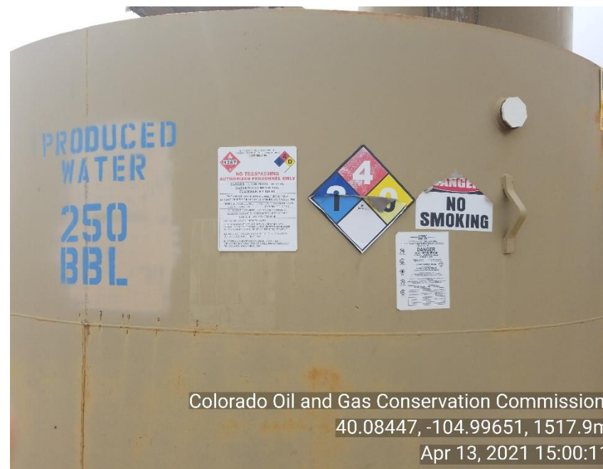
Photo 10 NFPA placard peeling and faded on produced water tank.