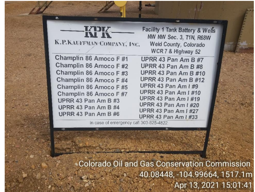
Photo 12 TNK BTRY well sign.