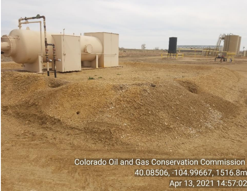
Photo 5 Secondary BMP in disrepair Prairie dog holes.