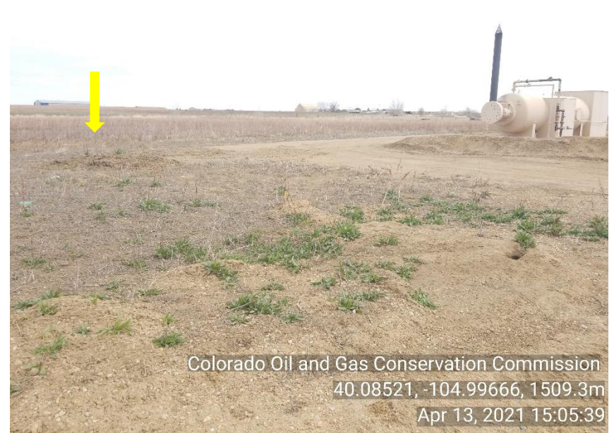
Photo 14 Material being pushed off location not NO BMP's in place.