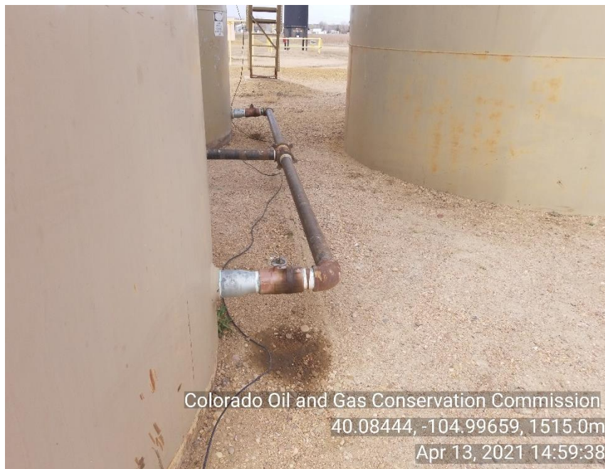
Photo 9 Stained soil under load lines on crude oil tanks. Mechanical issues 2" piping.