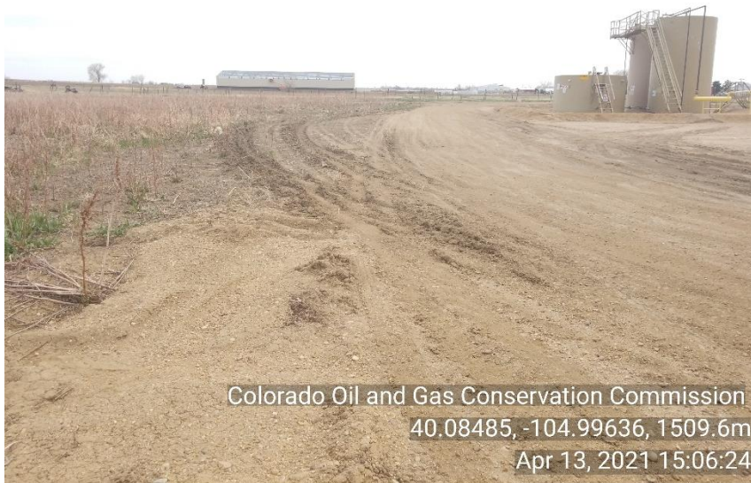
Photo 15 Material and truck traffic off location no BMP's in place.