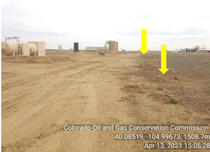
Photo 13 Material being pushed off location not NO BMP's in place.