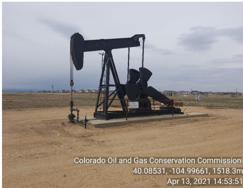
Photo 1 WH. Well head sign peeling and faded need to replace.