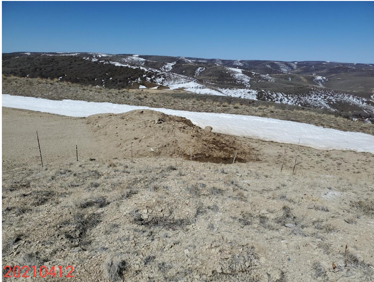
Photo 11: Photo taken from the north end of the Location. Photo shows soil stockpiled on the Location; unclear if this is the topsoil from the disturbed areas.