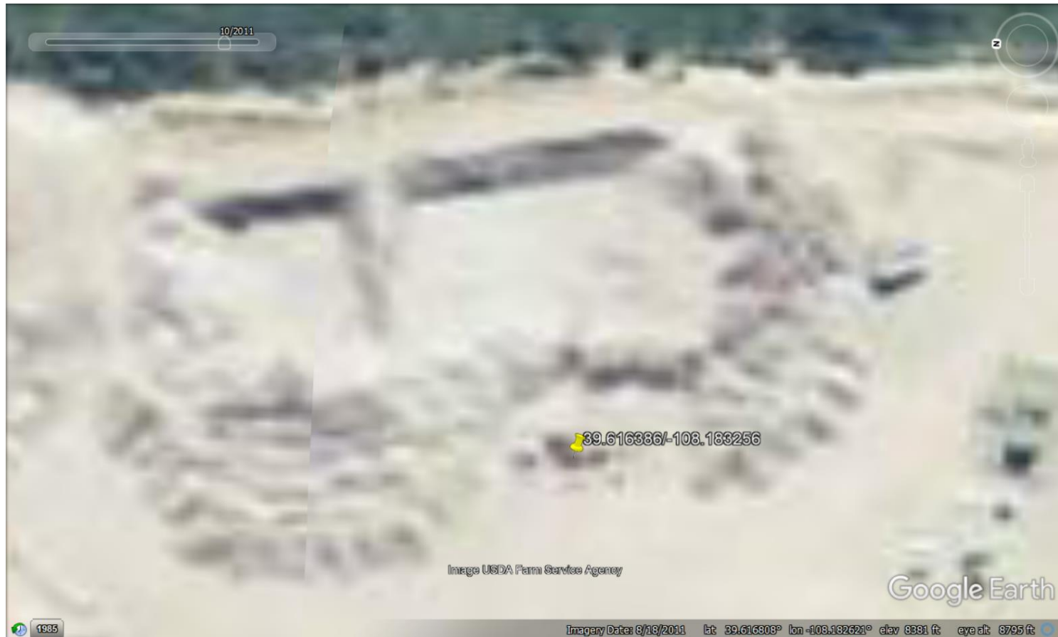
Photo 1: 2011 Google Earth Aerial imagery. Photo shows pits on the Location prior closure and interim reclamation