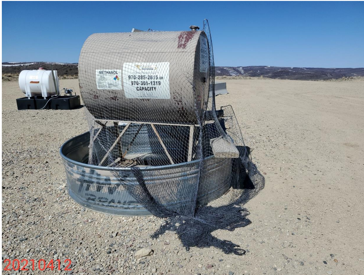
Photo 13: Photo shows the wildlife netting at the methanol tank is inadequate to prevent wildlife access to the containment BMP.