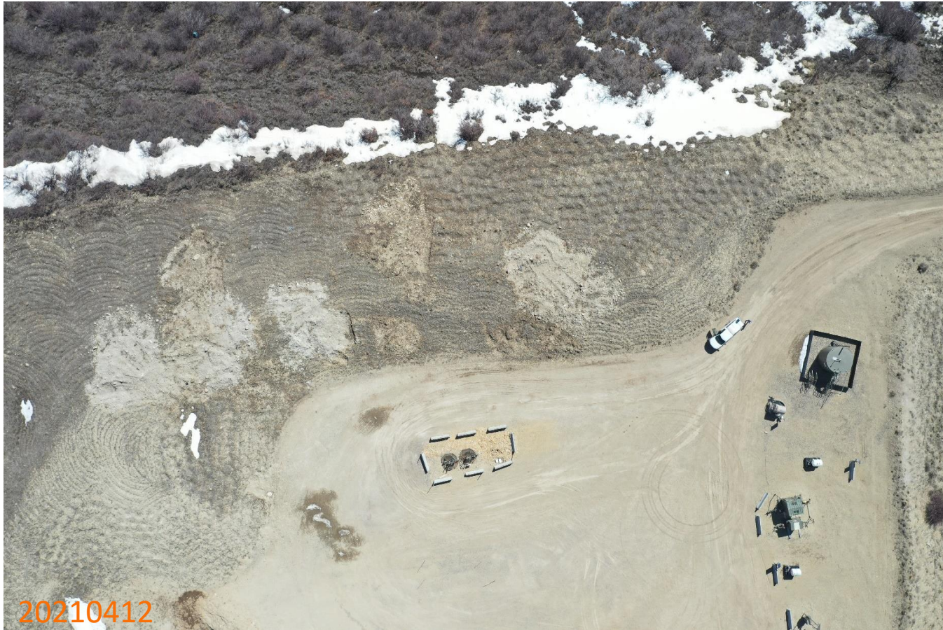
Photo 3: Aerial imager of the Location taken 4/12/2021. Photo shows interim areas on the east end of the Location (top of photo) have been disturbed. Areas require reclamation.