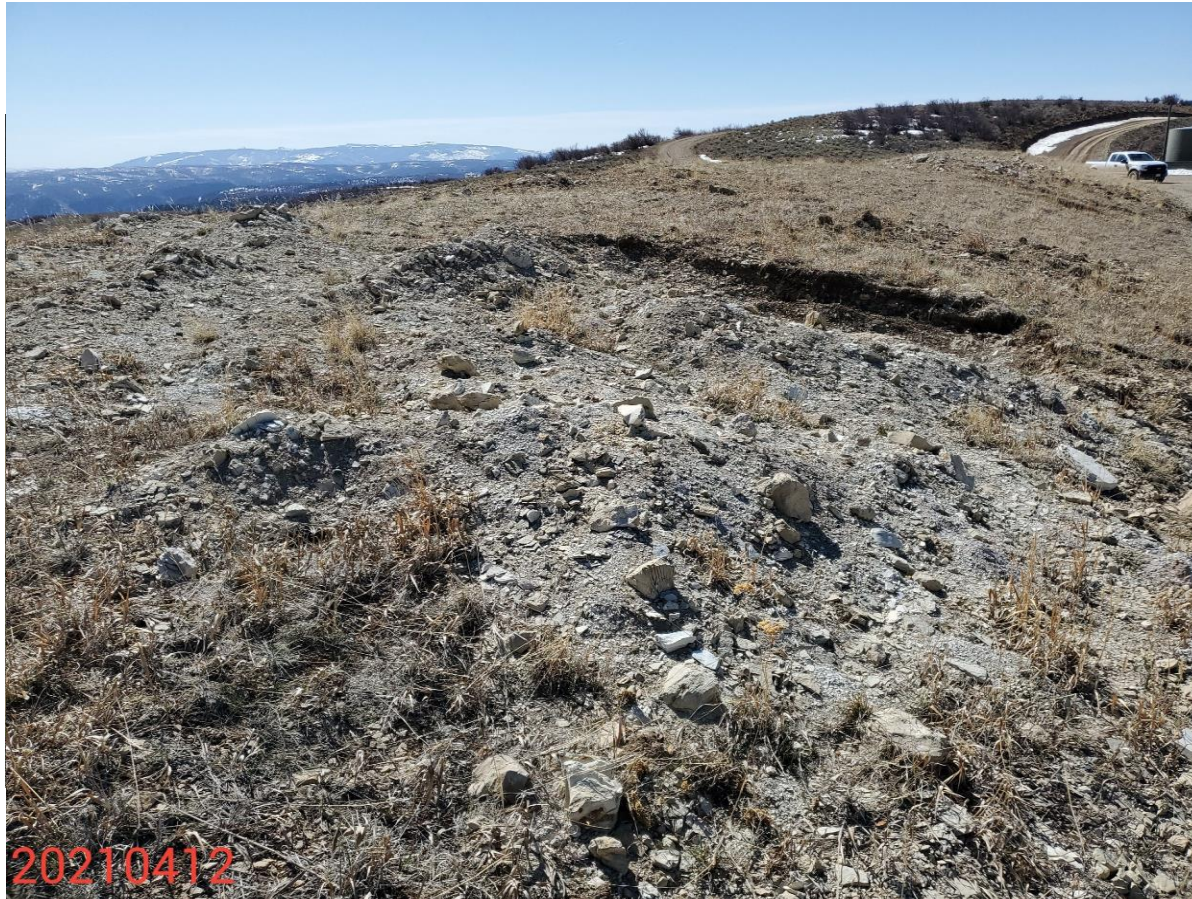
Photo 8: Photo taken from the eastern interim areas of the Location, facing south. Photo shows interim areas re-disturbed by Operator. Areas require reclamation.