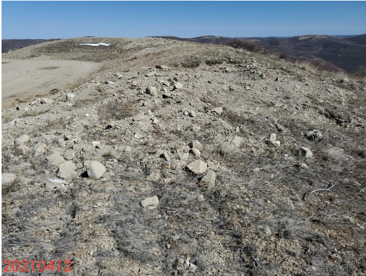
Photo 5: Photo taken from the eastern interim areas of the Location, facing north. Photo shows interim areas re-disturbed by Operator.