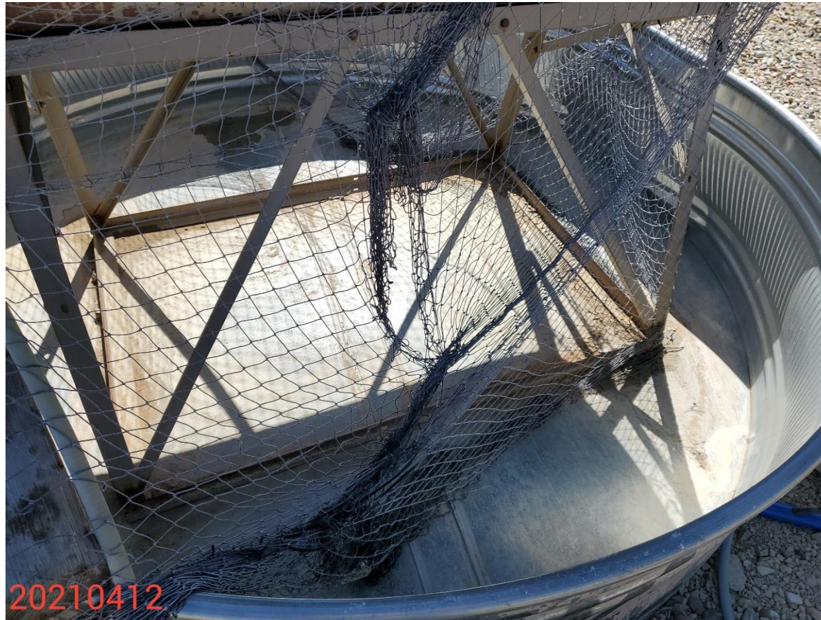
Photo 14: Photo shows the wildlife netting at the methanol tank is inadequate to prevent wildlife access to the containment BMP