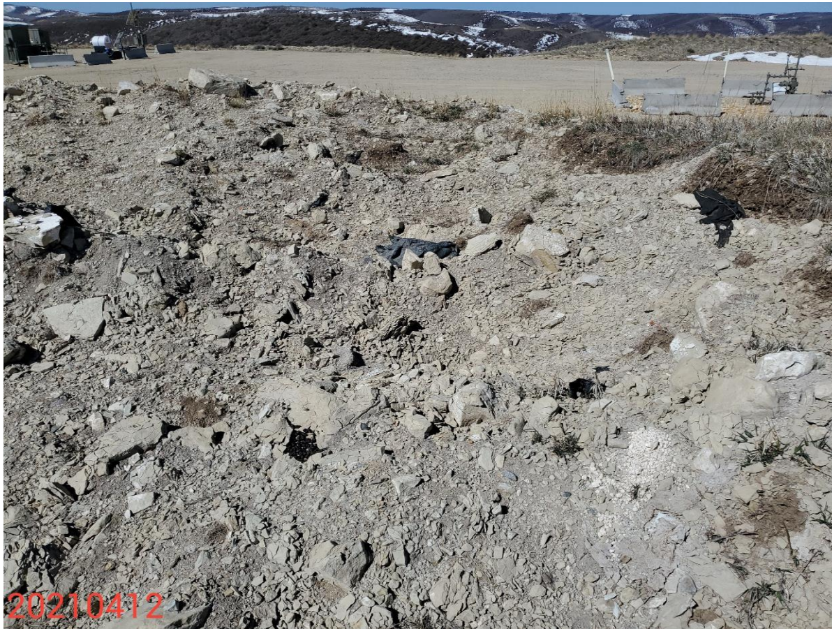
Photo 6: Photo taken from the eastern interim areas of the Location, facing west. Photo shows interim areas re-disturbed by Operator. Areas require reclamation. Various trash debris was also observed within these disturbed areas.