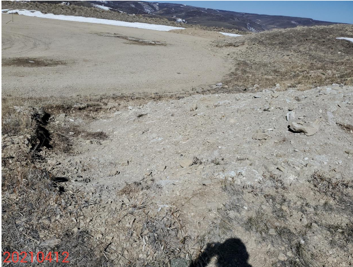
Photo 7: Photo taken from the eastern interim areas of the Location, facing west. Photo shows interim areas re-disturbed by Operator. Areas require reclamation.