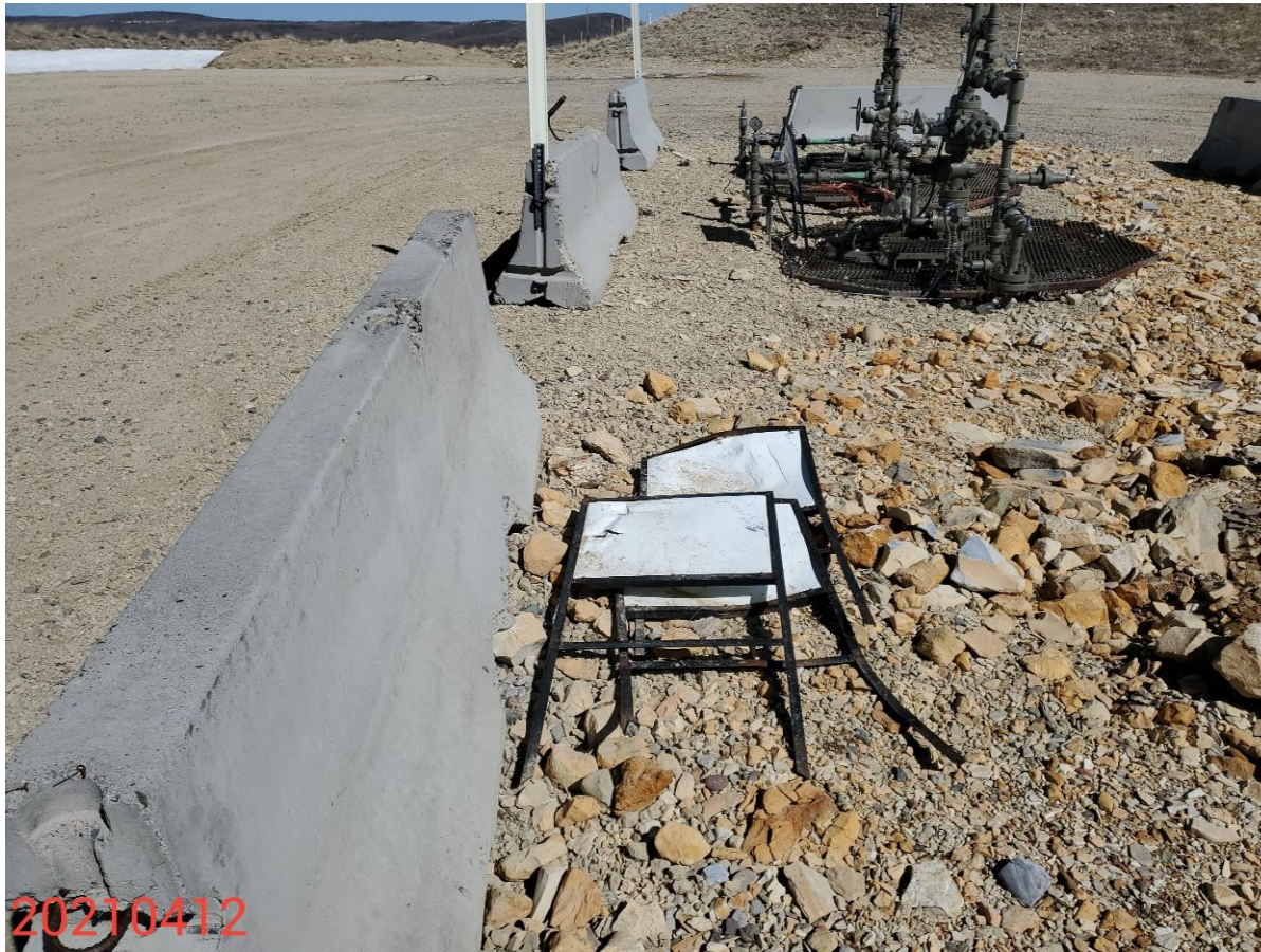
Photo 12: Photo shows unused signs associated with PAd wells stored on the Locaiton.