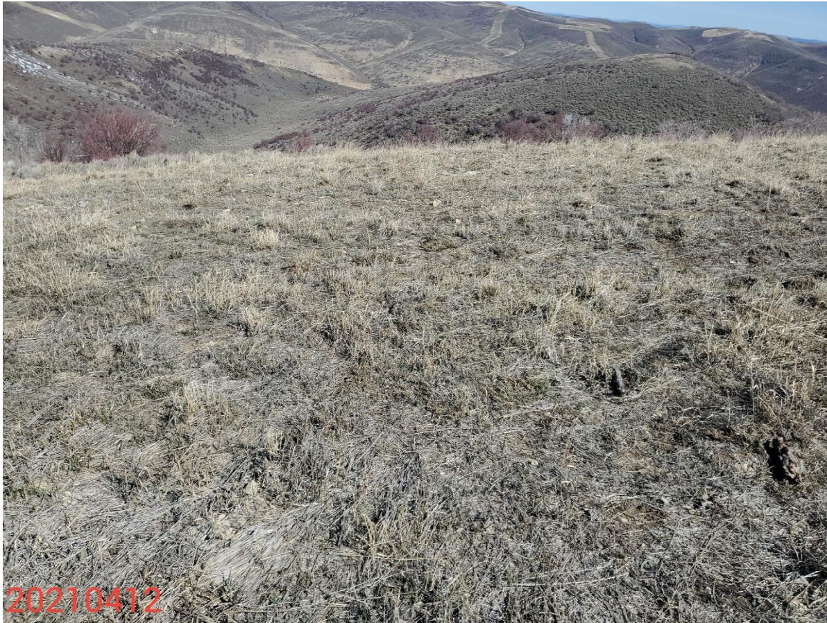
Photo 10: Photo taken from the interim areas on the north end of the Location, facing north. Interim reclamation progressing towards 1003 standards.