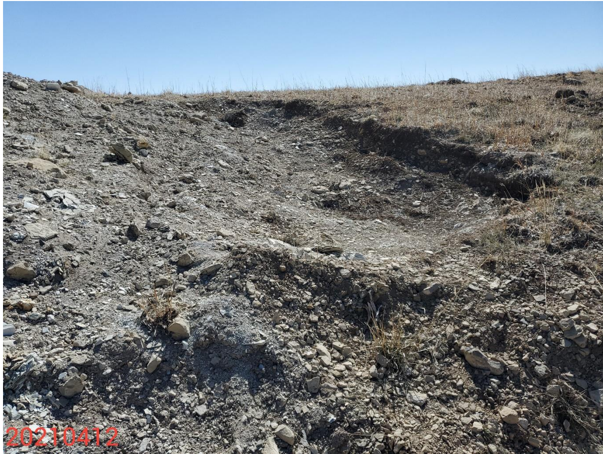
Photo 9: Photo taken from the eastern interim areas of the Location, facing east. Photo shows interim areas re-disturbed by Operator. Areas require reclamation.