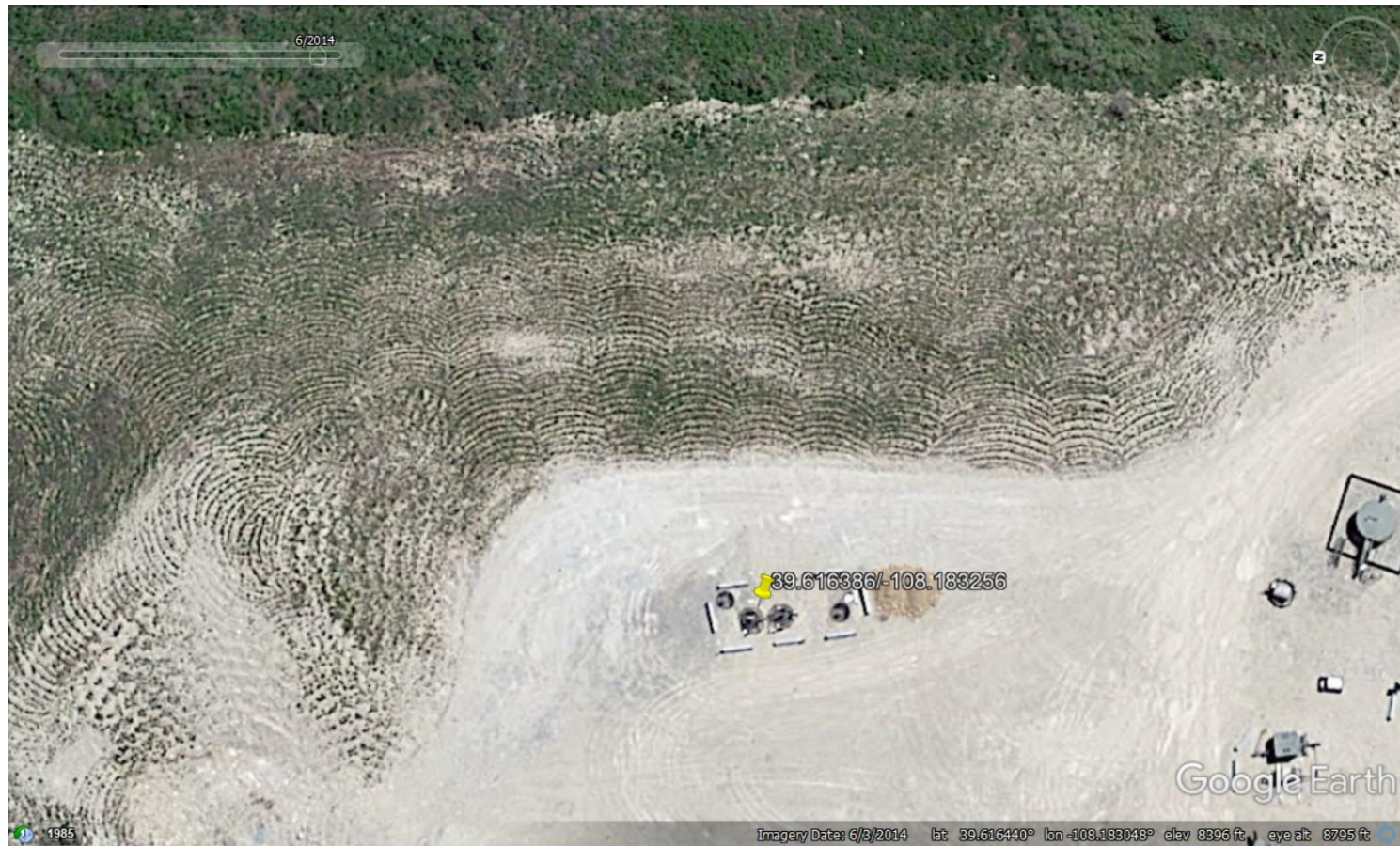
Photo 2: 2014 Google Earth aerial image. Photo shows pits have been closed and interim reclamation conducted.