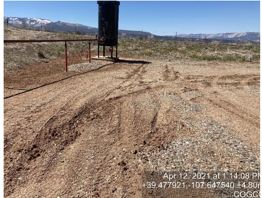
location and Lack of stabilization/compaction