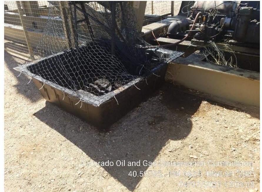
Photo 6 – 2-6H Secondary Containment place on top of Stain Soil. Stain Soil STILL REMAINS