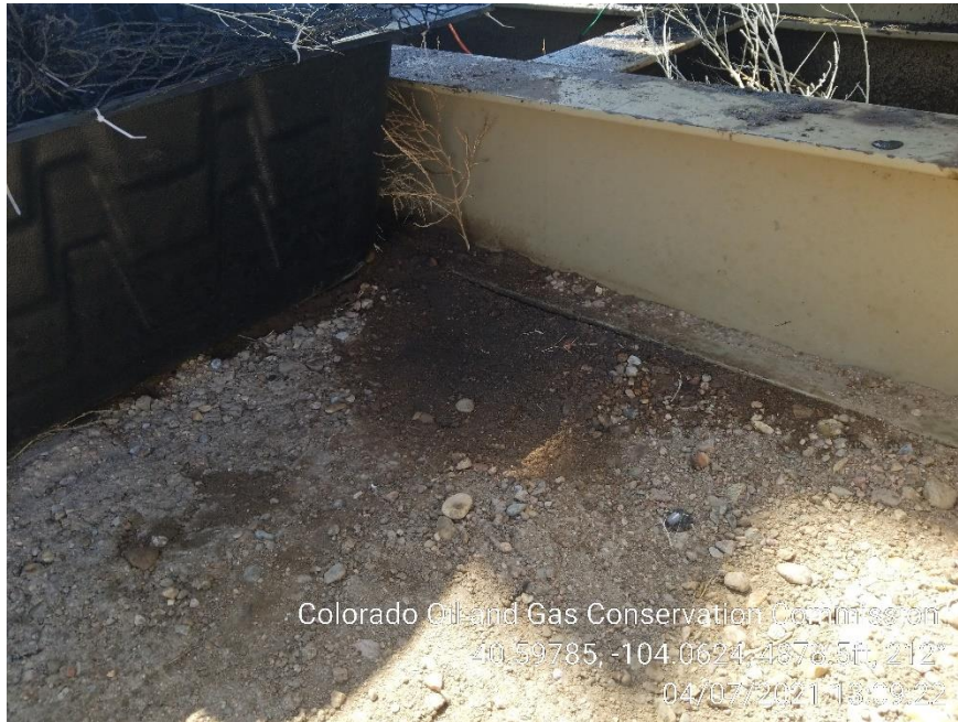
Photo 7 – 2-6H Secondary Containment place on top of Stain Soil. Stain Soil STILL REMAINS