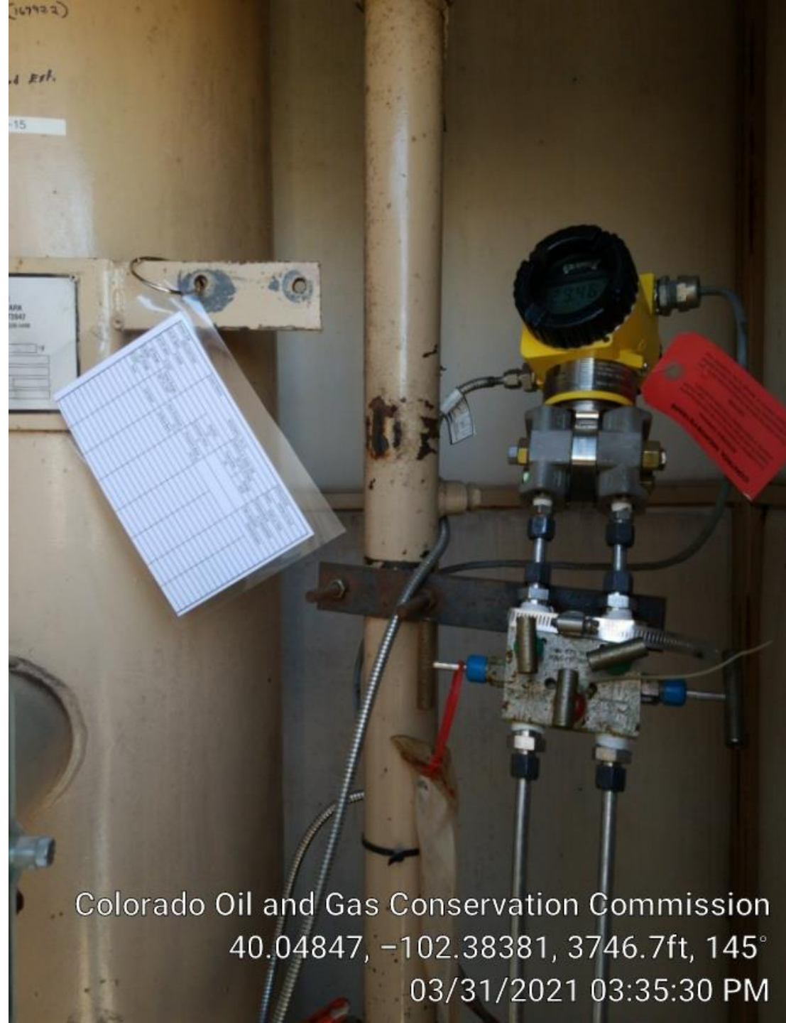
Colorado Oil and Gas Conservation Commission 40.04847, -102.38381, 3746.7ft, 145° 03/31/2021 03:35:30 PM