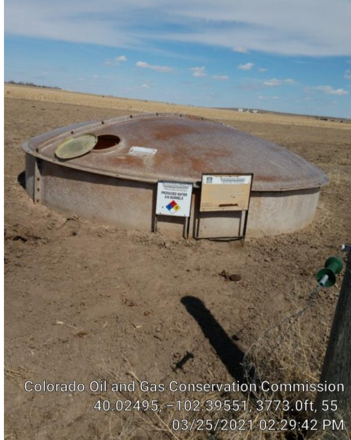
Colorado Oil and Gas Conservation Commission 40.02495, -102.39551, 3773.0ft, 55° 03/25/2021 02:29:42 PM