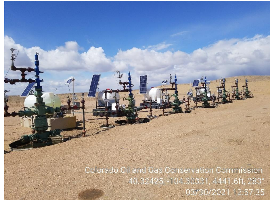
Photo 6 – Wellheads