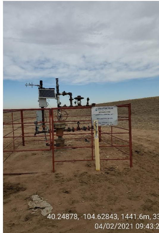
Photo 2 05-123-16410 ARISTOCRAT ANGUS 34-2