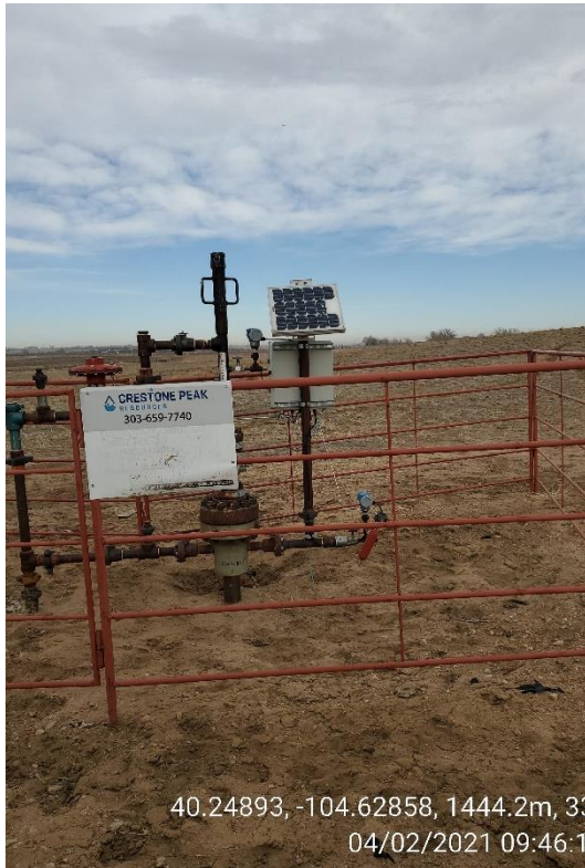
Photo 4 05-123-33027 ARISTOCRAT ANGUS 6-4-2

Location ID, Name: 332594, ARISTOCRAT ANGUS-63N65W 2SWSE