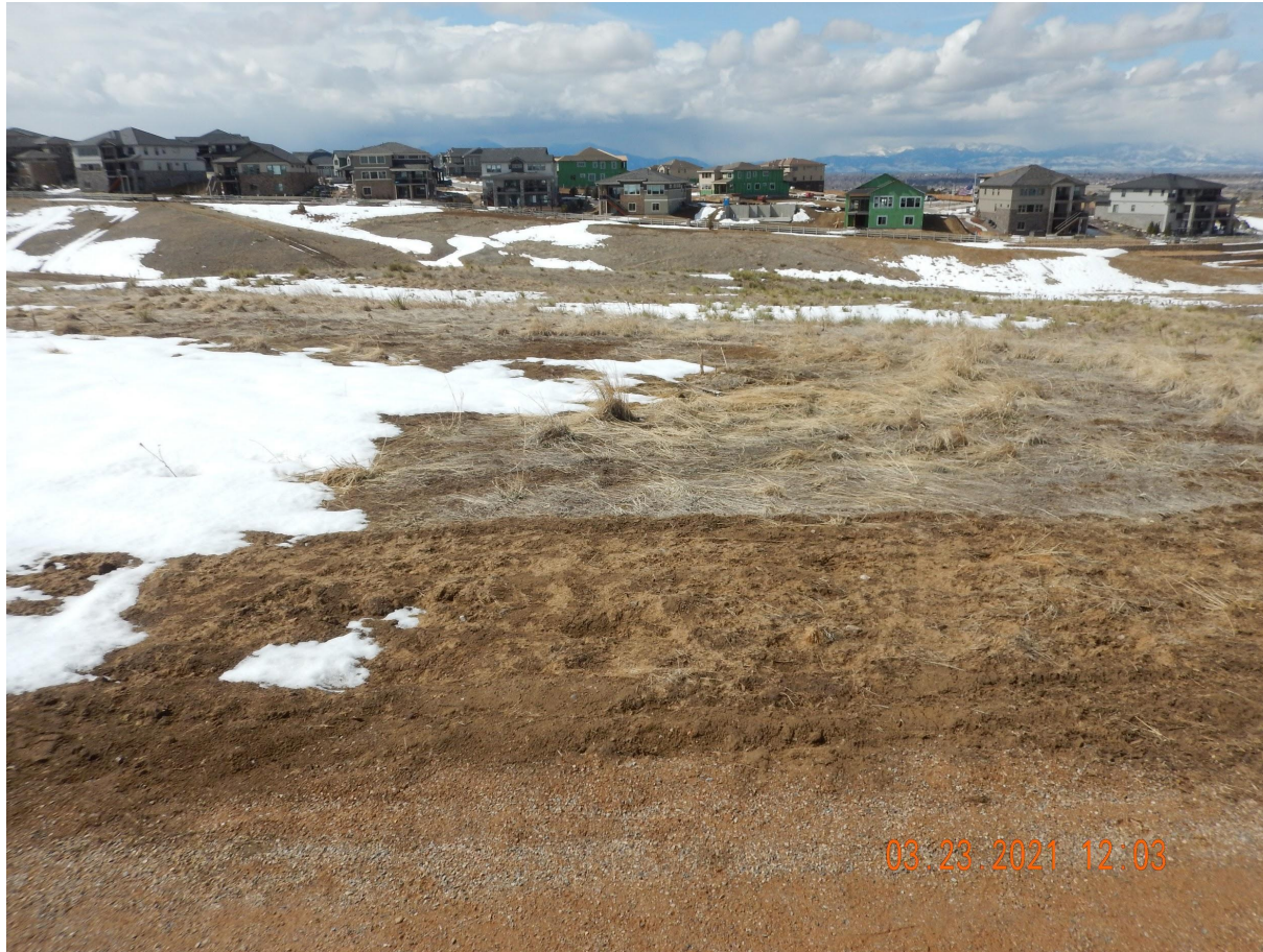
Photo 3. Photo taken from the well location, facing West. Photo illustrates all equipment has been removed from the location.