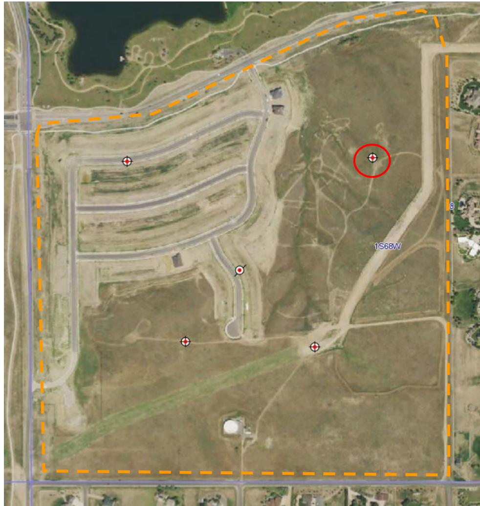
Photo 1. COGCC aerial imagery from 2019 illustrates the well location (red circle) in relation to the Anthem Neighborhood #5 housing development (orange dashed area= 132 acres). Based on the Anthem Filing No.24 Site Development Plan, the well location and the associated access road will be seeded- see Photo 2. All other two-tracks not associated with oil and gas will also be seeded.