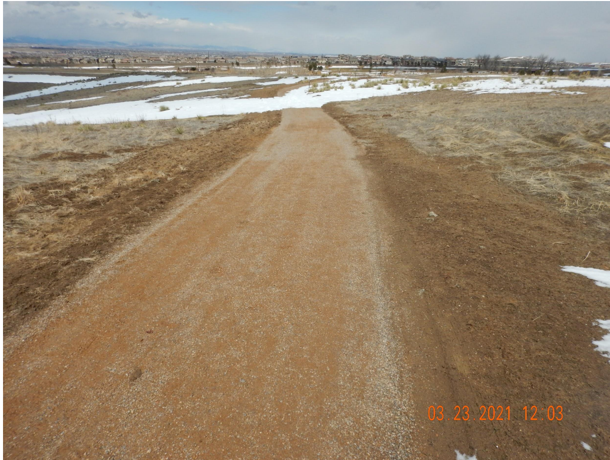
Photo 4. Photo taken from the well location, facing North. Photo illustrates an open space path under construction.