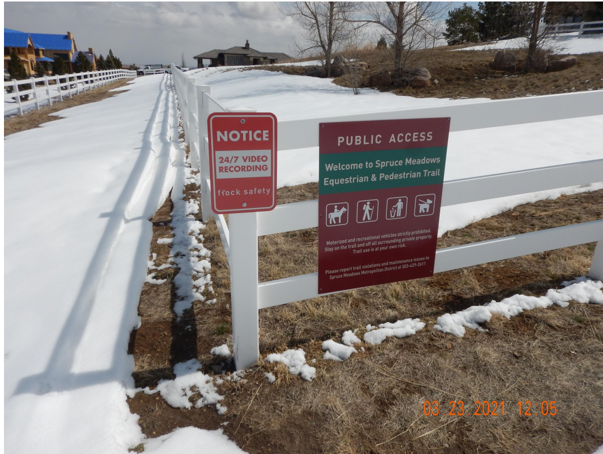
Photo 5. Photo taken from the eastern housing development boundary, facing East. Photo illustrates the Anthem development boundary will be connected to the Spruce Meadows Equestrian and Pedestrian Trail.