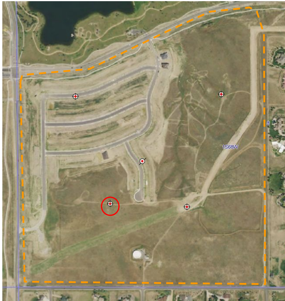
Photo 1. COGCC aerial imagery from 2019 illustrates the well location (red circle) in relation to the Anthem Neighborhood #5 housing development (orange dashed area= 132 acres). Based on the Anthem Filing No.24 Site Development Plan, the well location and the associated access road will be seeded- see Photo 2. All other two-tracks not associated with oil and gas will also be seeded.