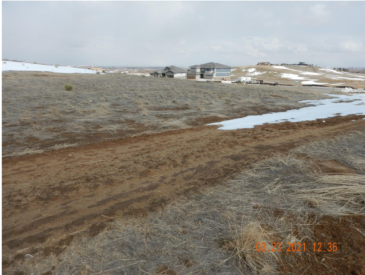
Photo 4. Photo taken from the well location, facing East. Photo illustrates the access road appears to have been seeded per the plan.