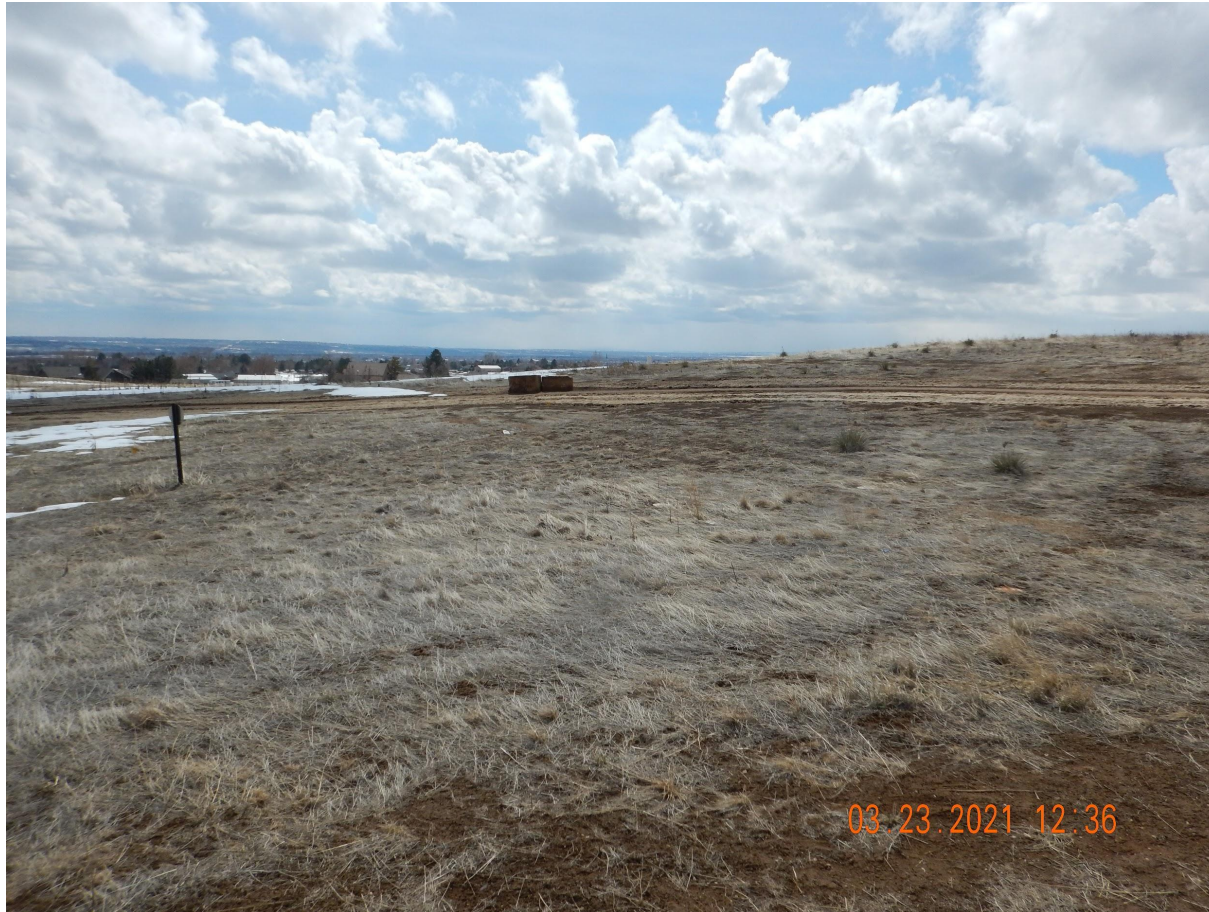
Photo 3. Photo taken from the well location, facing South. Photo illustrates all equipment has been removed from the location.