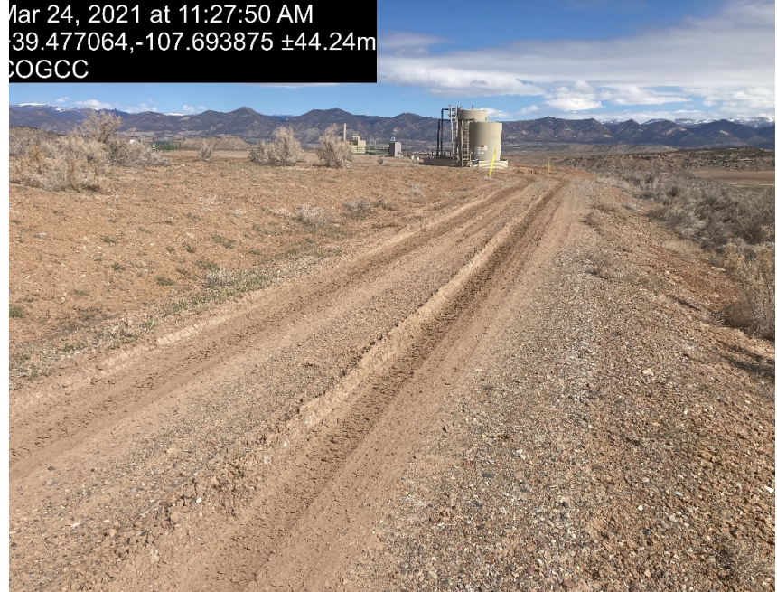
location entrance / lack of stabilization / lack of compaction

Mar 24, 2021 at 11:27:50 AM 39.477064,-107.693875 ±44.24m COGCC