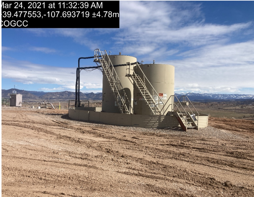
Location / No evidence of Tank battery sign

Mar 24, 2021 at 11:32:39 AM 39.477553,-107.693719 ±4.78m COGCC