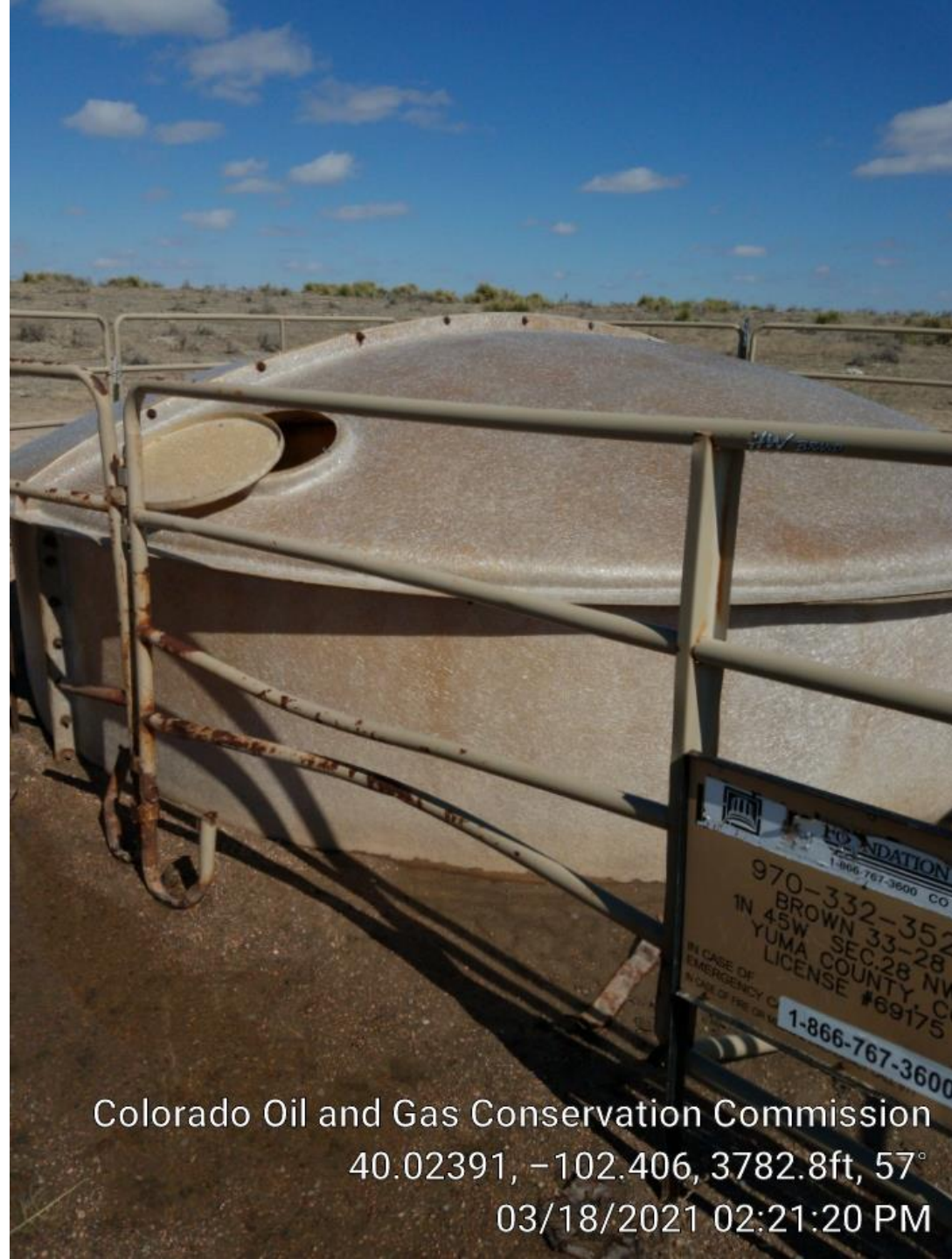
Colorado Oil and Gas Conservation Commission 40.02391, -102.406, 3782.8ft, 57° 03/18/2021 02:21:20 PM