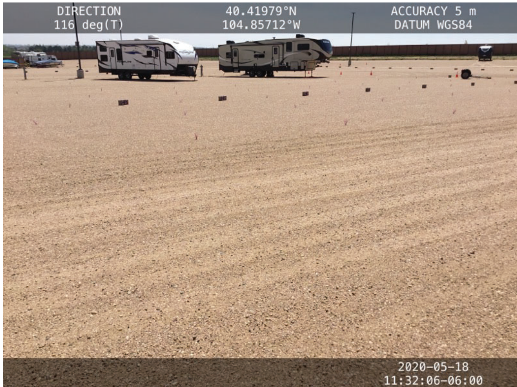
Photo Point E: Reference Crop Vegetation - Facing East - Southeast

Operator Location Information (API) - ARTIST 11-12 Well (05-123-18431)