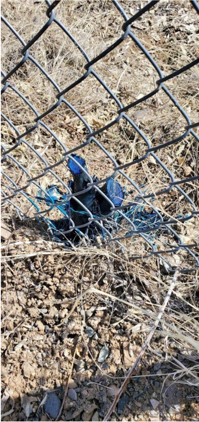
Chemical Treatment of weeds