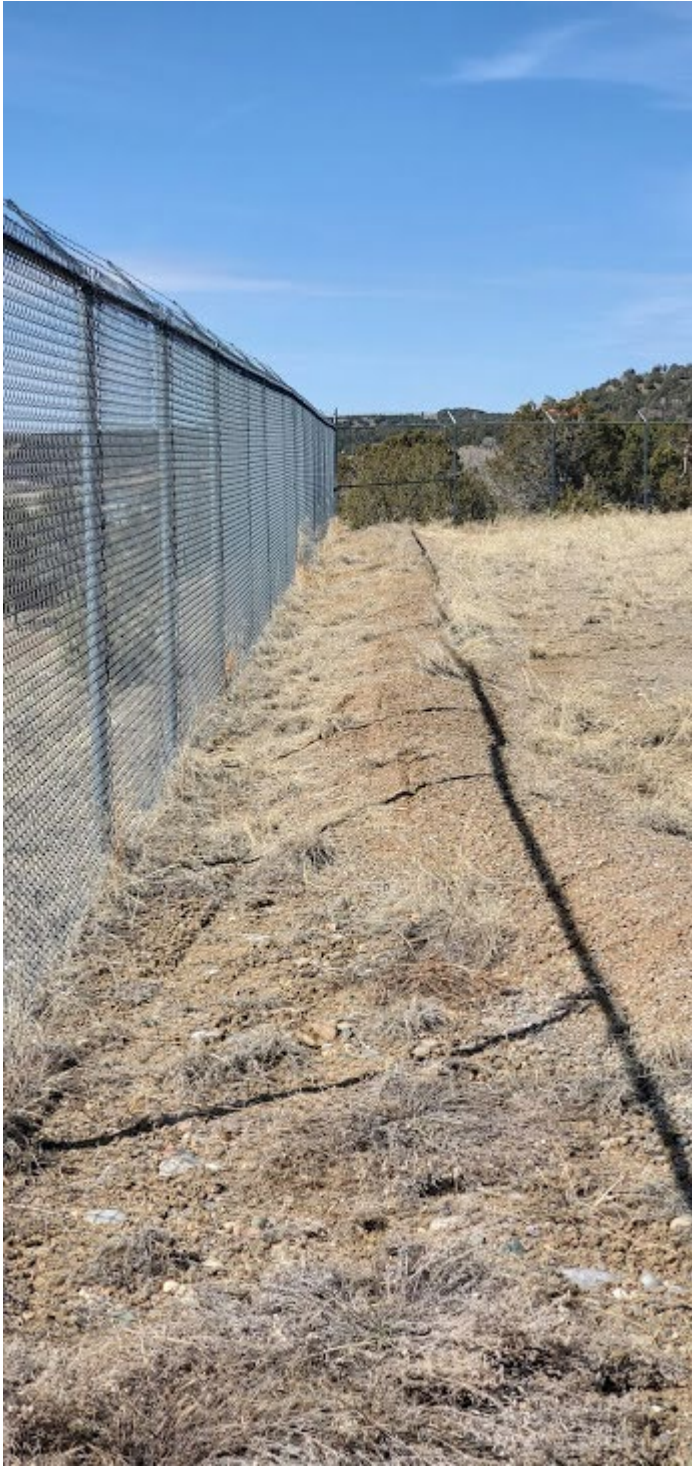
Mechanical Removal of weeds