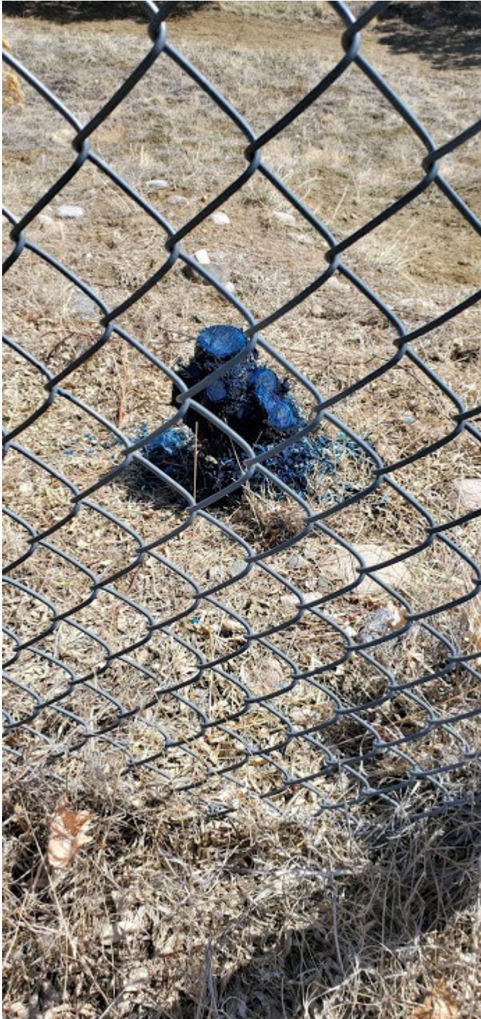
Chemical Treatment of weeds