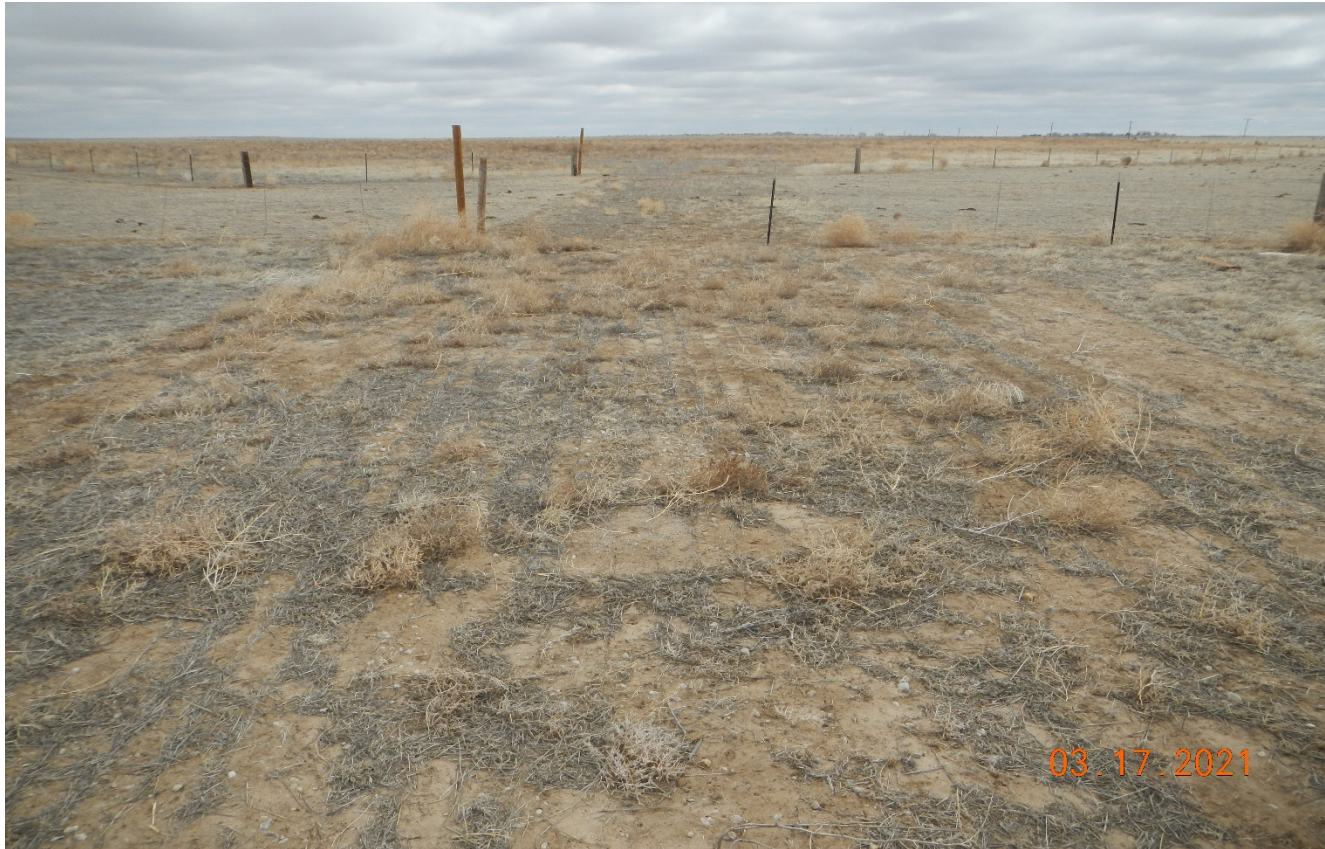
Photo 1. Facing east at the former access road. The fence will need to be reinstalled to the where it originally existed.