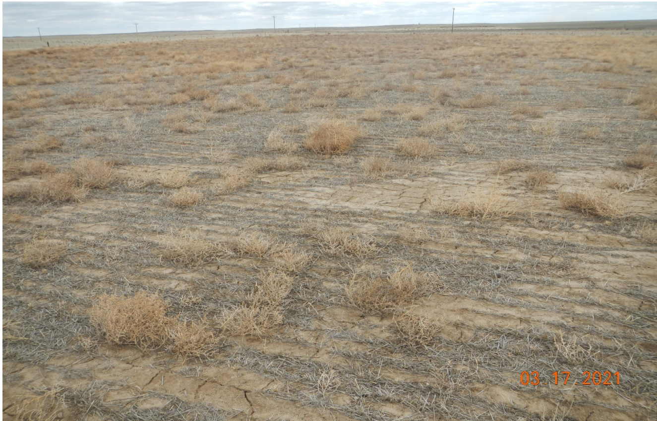
Photo 6. Center of the location facing south.