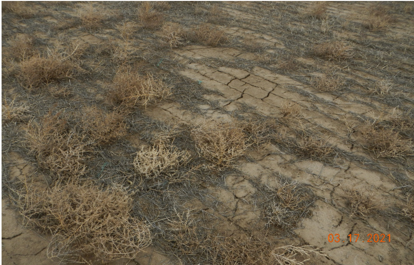
Photo 7. View of groundcover shows insufficient desirable vegetation establishment.