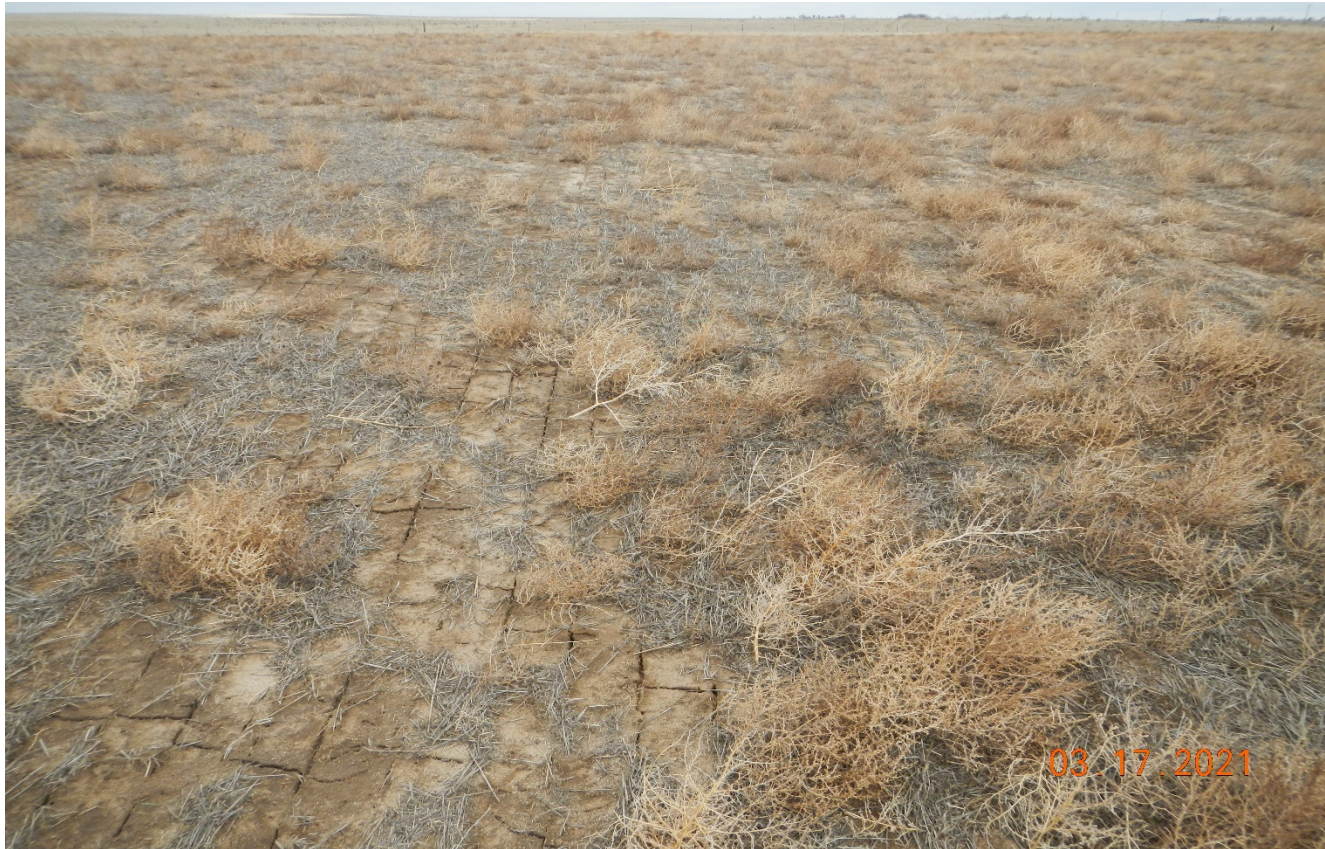
Photo 3. Center of the location facing east.