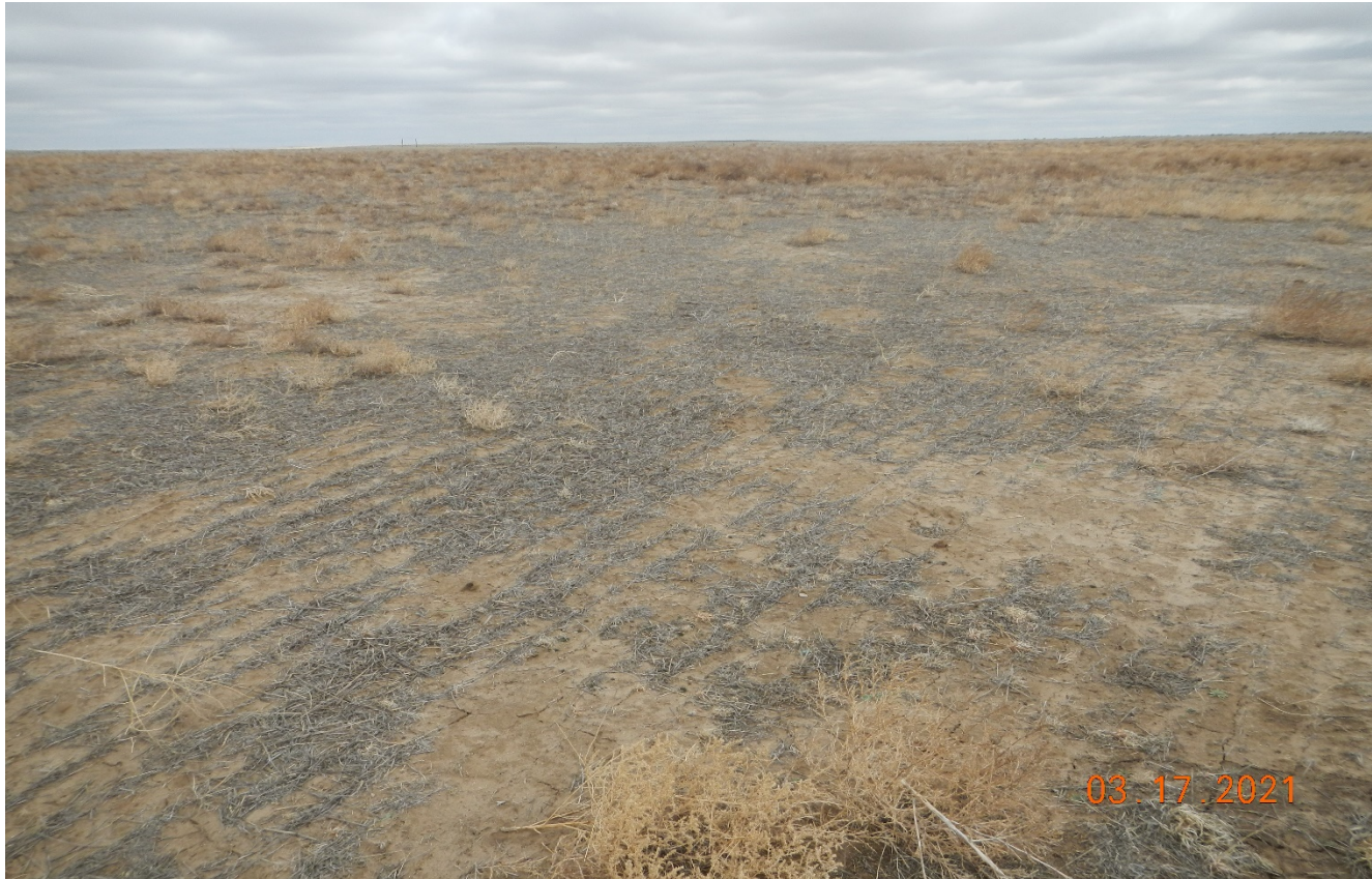
Photo 2. . Facing east toward the location. It does not appear vegetation is establishing and there are undesirable weed debris throughout the location.