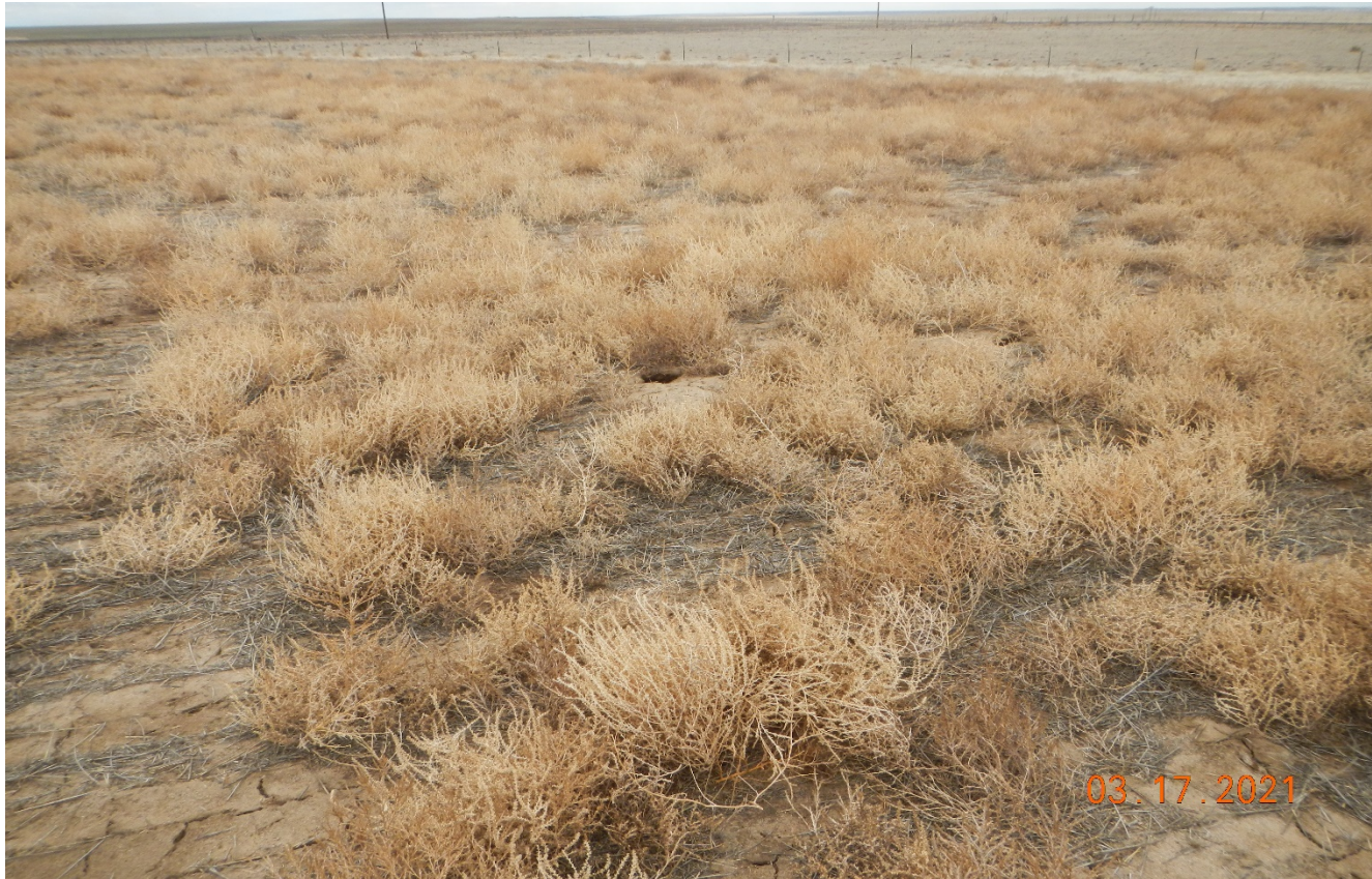
Photo 8. Facing toward the south side of the location. The vegetation shown in the photo is undesirable weeds (Russian thistle). The weeds and debris need to be controlled and removed.