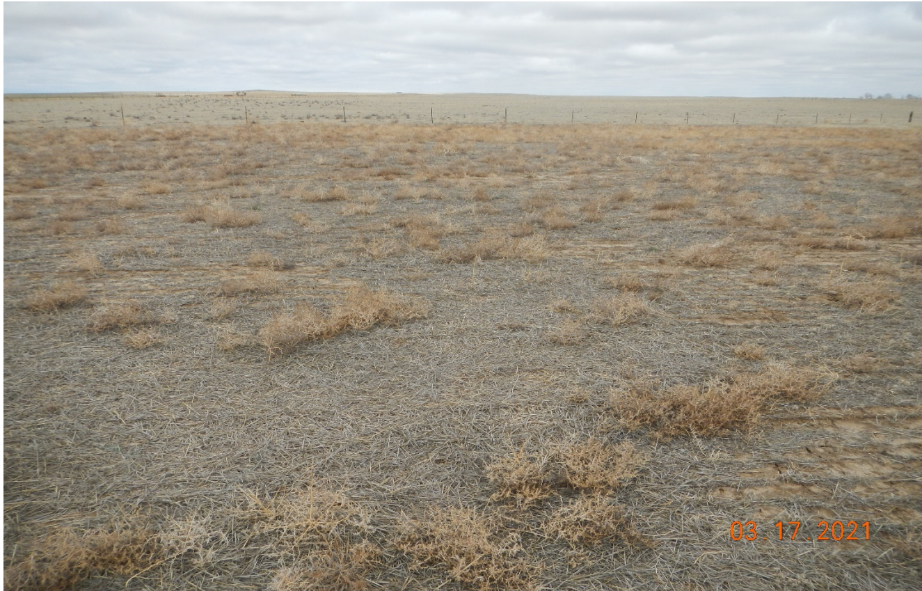
Photo 4. Center of the location facing north.