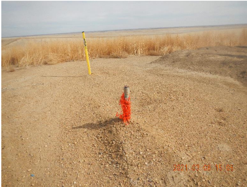
Photo 7: Riser by horizontal heated separator. Capped with plug installed.

Well Name : Morehead 41-9 1 API # : 001-08194