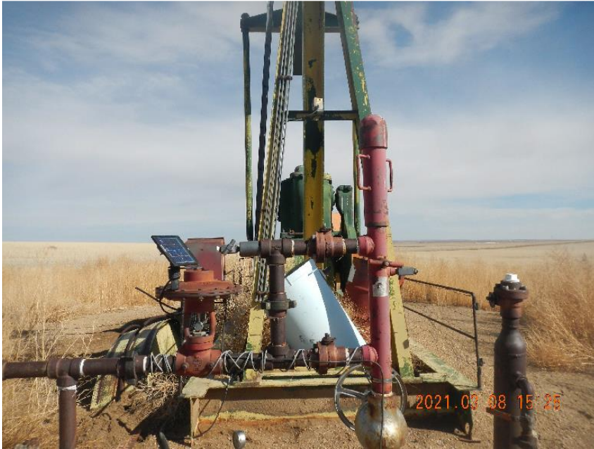
Photo 9: View of current plunger lift system.

Well Name : Morehead 41-9 1 API # : 001-08194