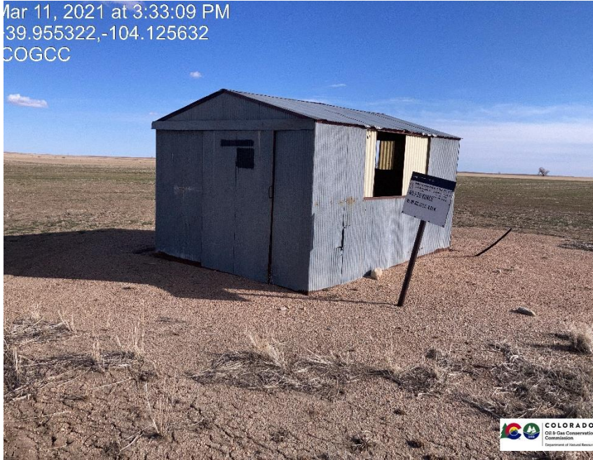
Pic 1 unused equipment

Mar 11, 2021 at 3:33:09 PM 39.955322,-104.125632 COGCC