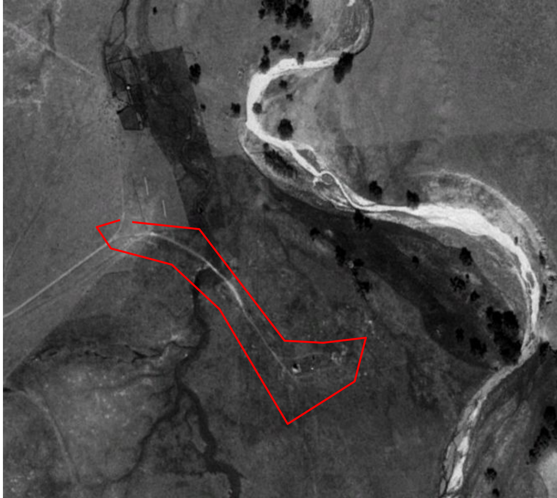
Photo 2. Aerial imagery from 9/29/199 illustrates the road that was constructed for the State B#1 well location.