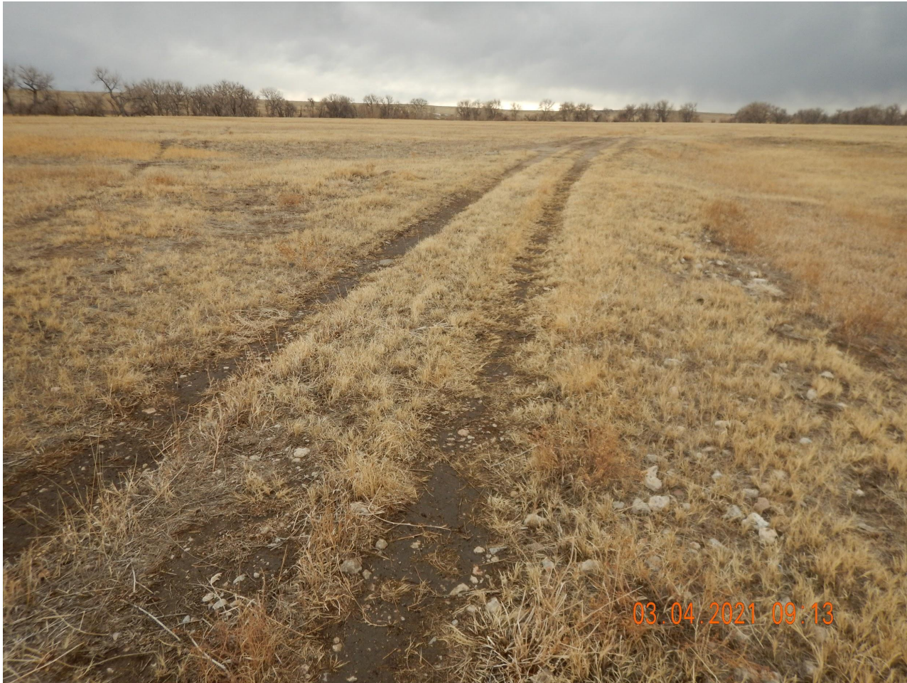
Photo 4. Photo taken from a portion of the lease road, facing South. Photo illustrates the lease road has not been reclaimed but the SLB has requested to leave it.