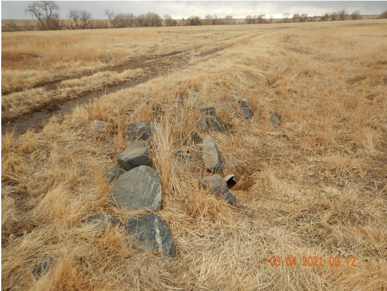
Photo 3. Photo taken from a drainage crossing along the access, facing South. SLB has requested to leave the road, as this is the only crossing point along the drainage.