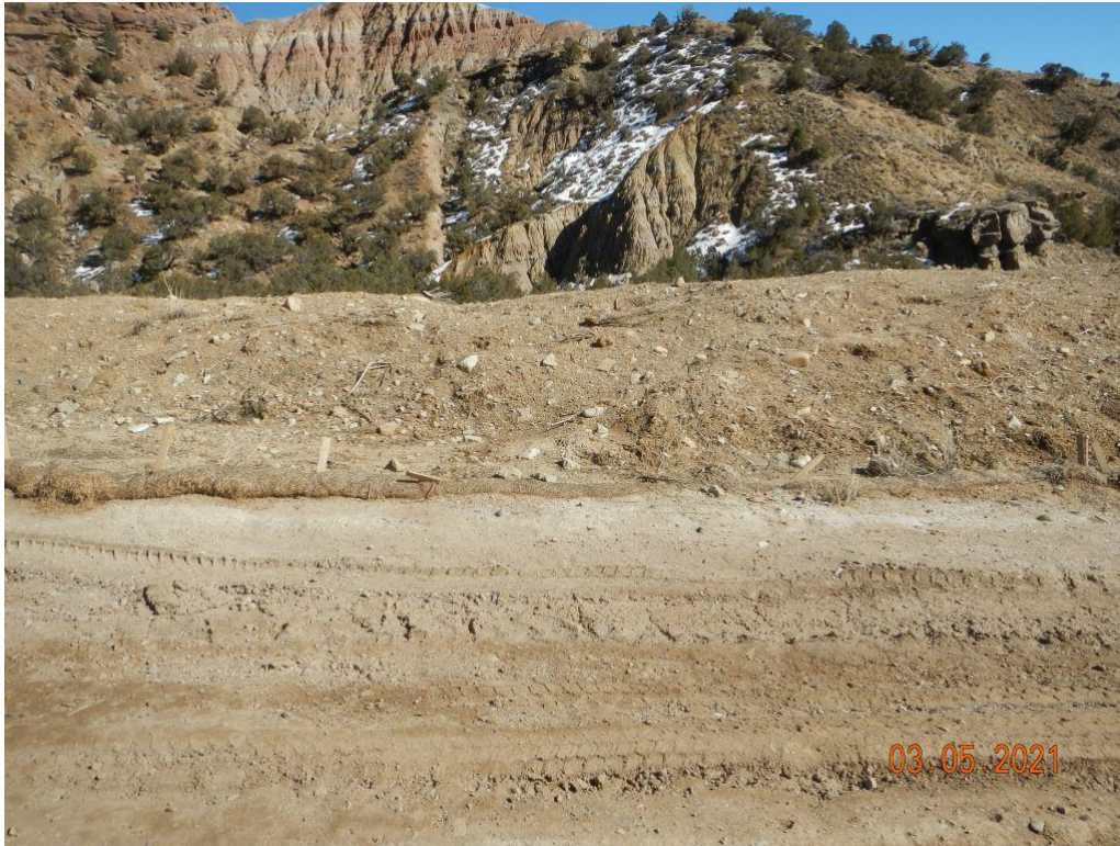
Photo#8: Topsoil pile along road to lower Location. Note damaged wattles.