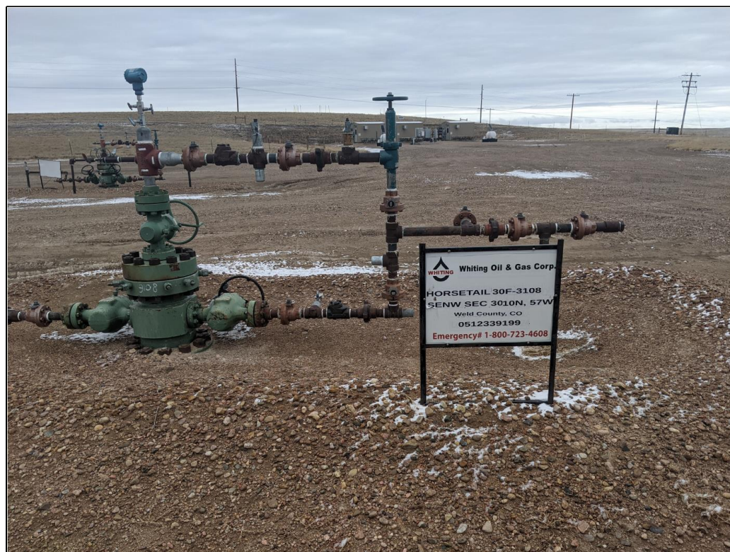
Horsetail 30F-3108 Wellhead Sign Installed