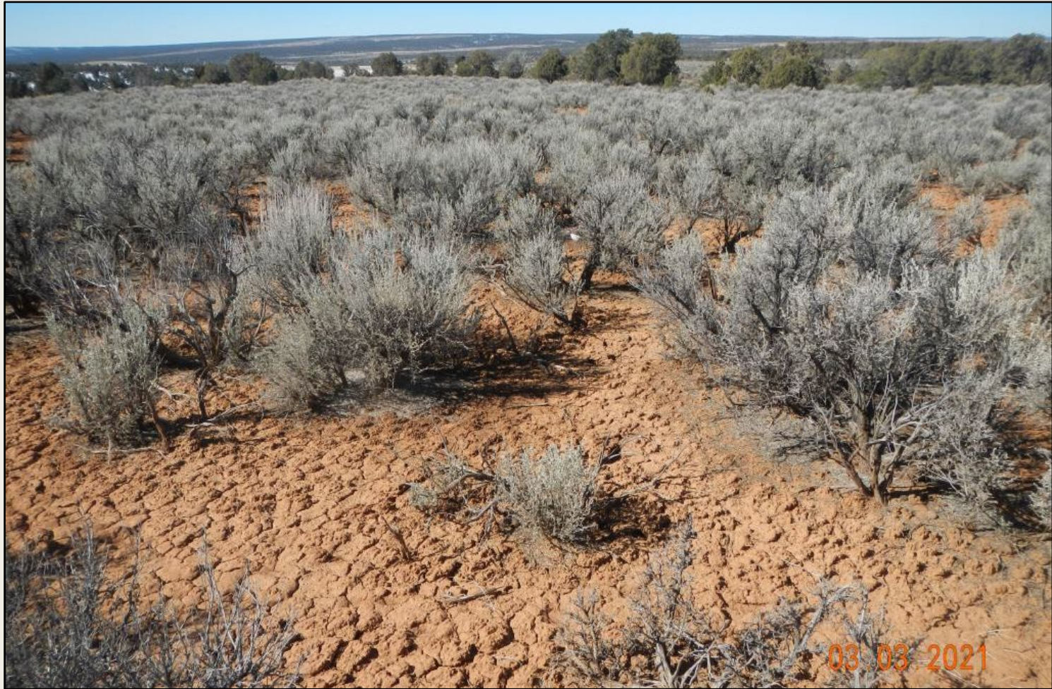
Photo 5. View of the reference area comprised of sagebrush shrubland with understory of grasses and forbs such as James galleta and forbs in a dormant condition at this time.