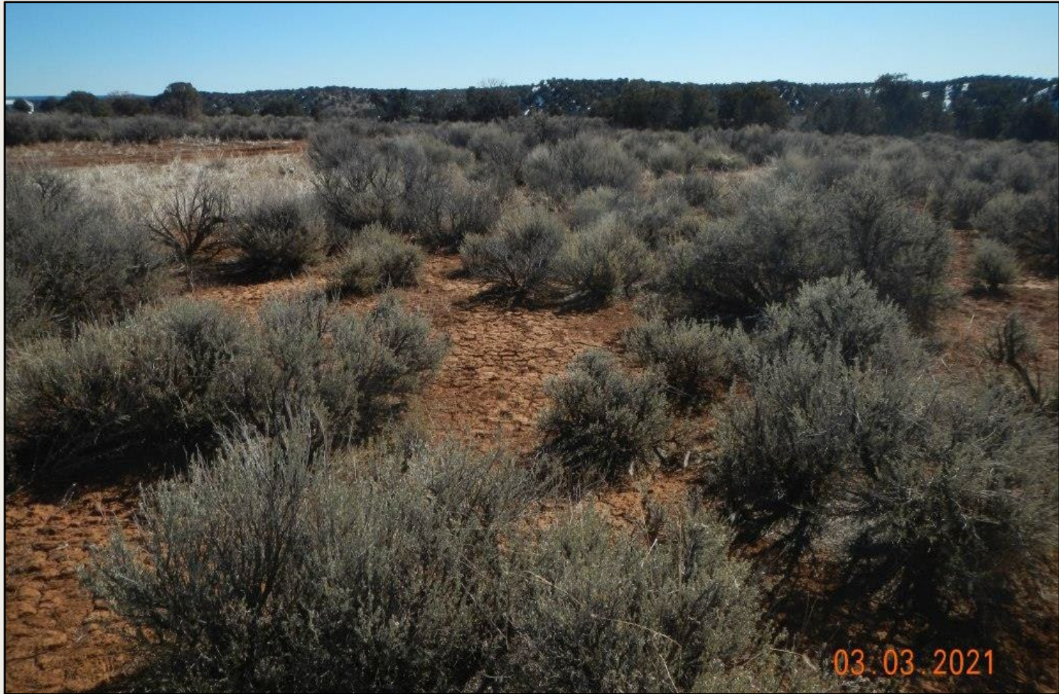
Photo 2. View of the southern project area from the southeastern corner facing northward. Vegetation is largely comprised of sagebrush, which is largely continuous with the surrounding sagebrush shrubland.