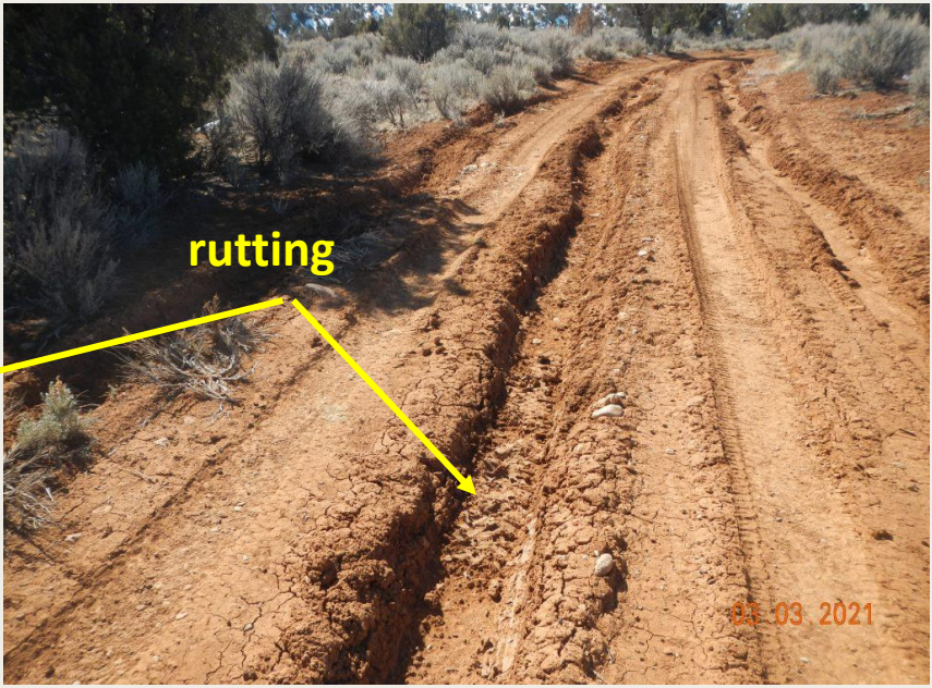
Photos 3/4. View of rutting and tracking up to 15 inches deep and wide observed along the access road.