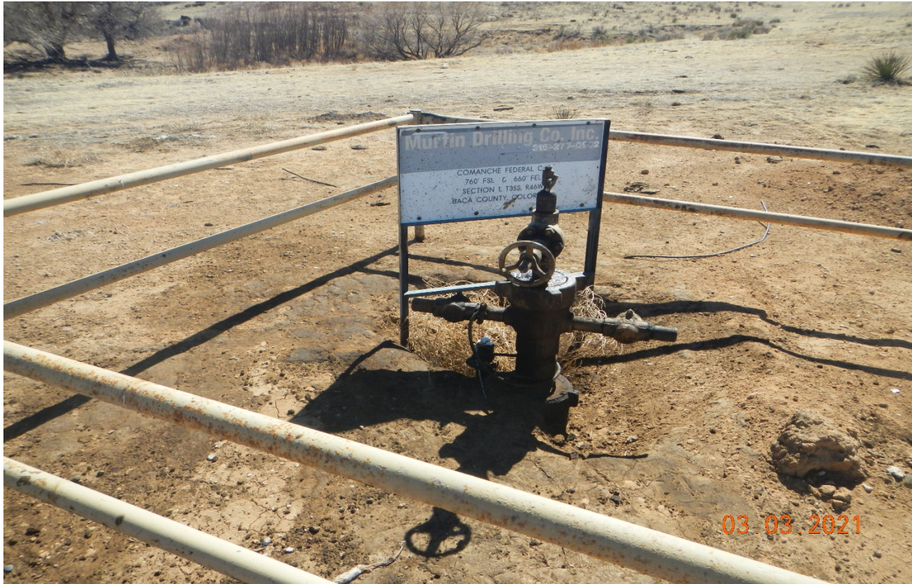
Photo 8. The well sign is posted at wellhead. The emergency number is faded and unidentifiable.