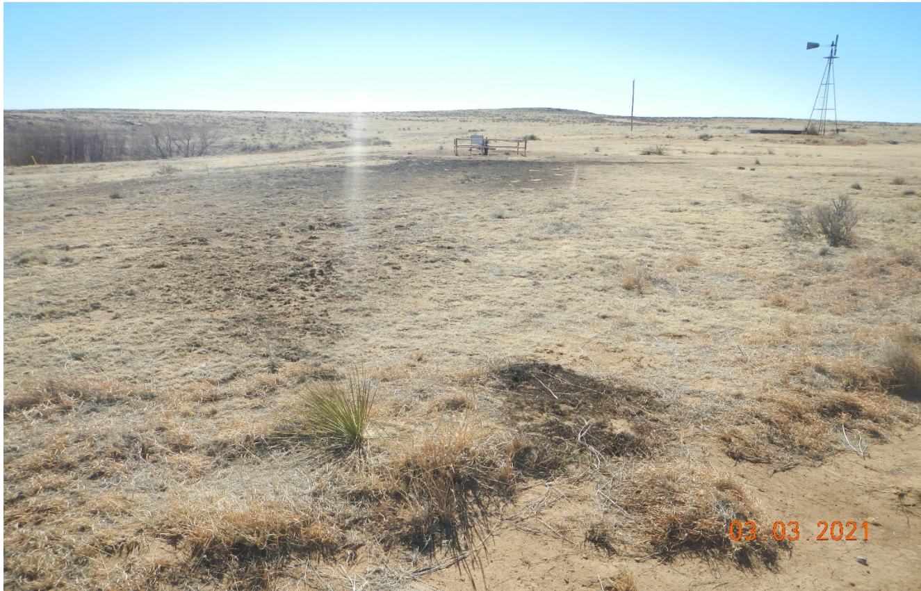
Photo 1. Facing southwest standing from the county road. It was observed while passing by that there was a blackend area near the well.