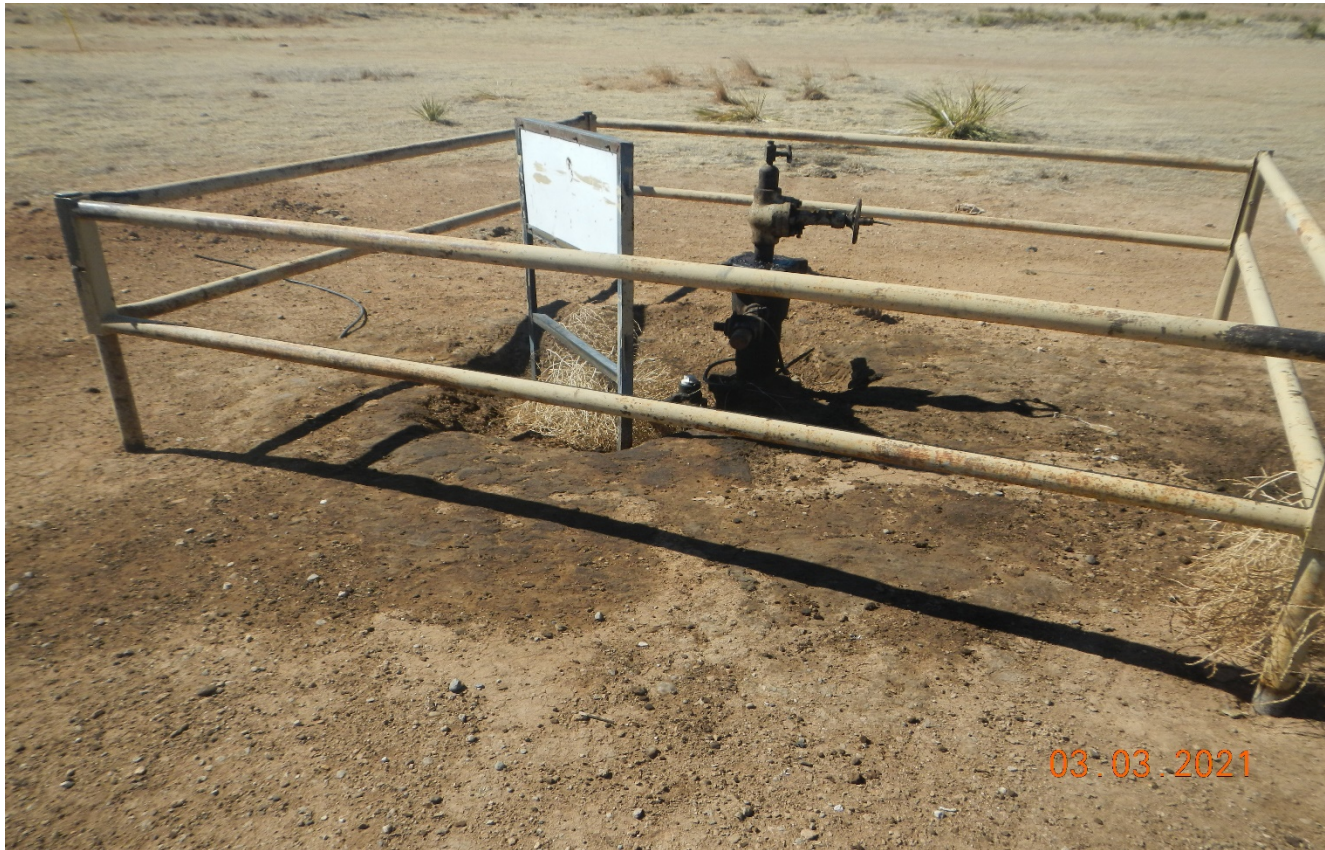
Photo 7. There is oil stained soil around the wellhead.