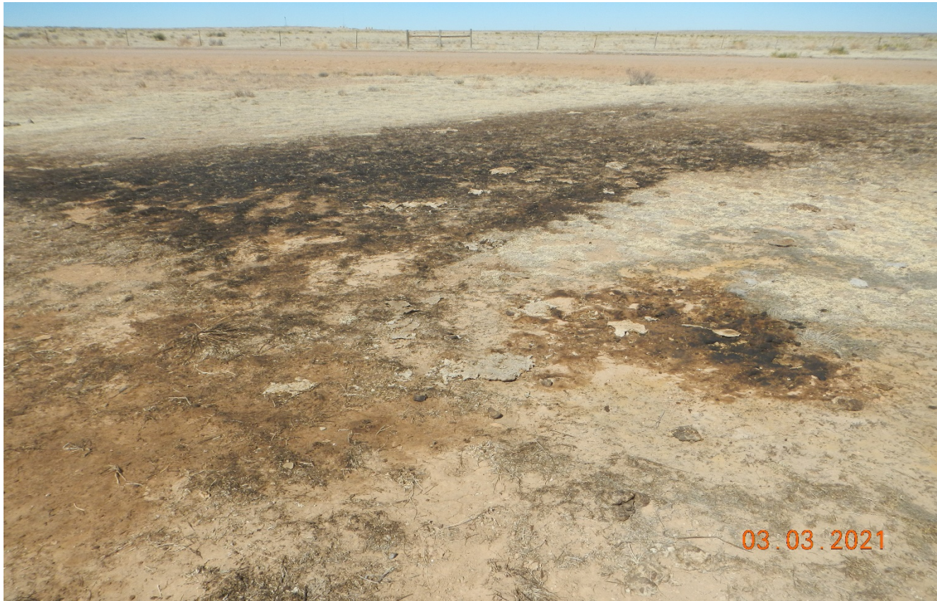
Photo 5. blacken oil spilled area is approximately 60'x30'.