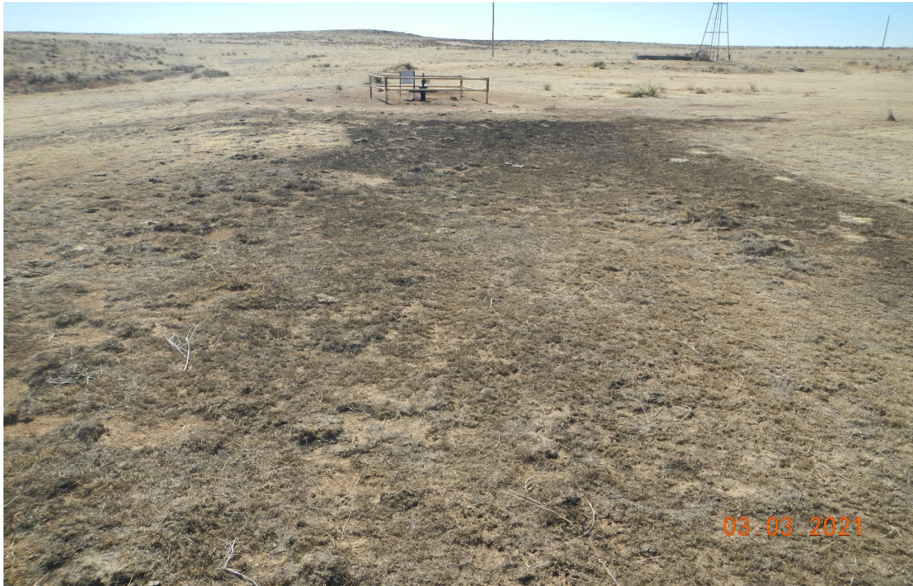
Photo 2. The blacken oil spilled area is approximately 60'x20'.