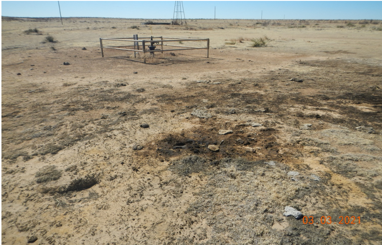
Photo 3. Facing southwest toward the well.