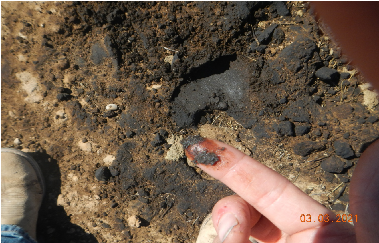
Photo 4. View of oily soil found near the well.