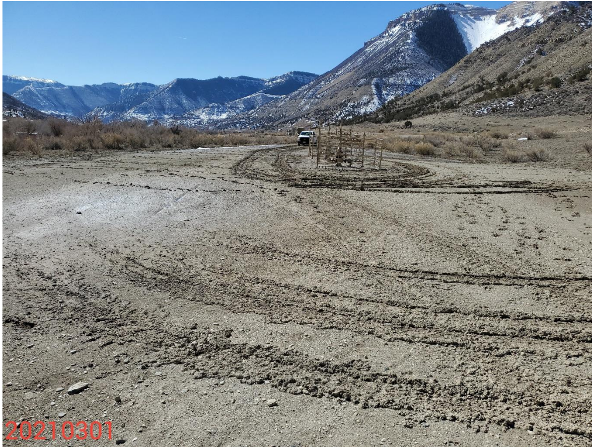
Photo 1: Photo taken from the north end of the Location, facing south. Photo provides an overview of the Location. Photo also shows rutting and tracking issues observed on the Location. Photo also shows areas where stormwater ponding on the Location is evident; Pad does not appear to have been constructed to allow for proper stormwater discharge