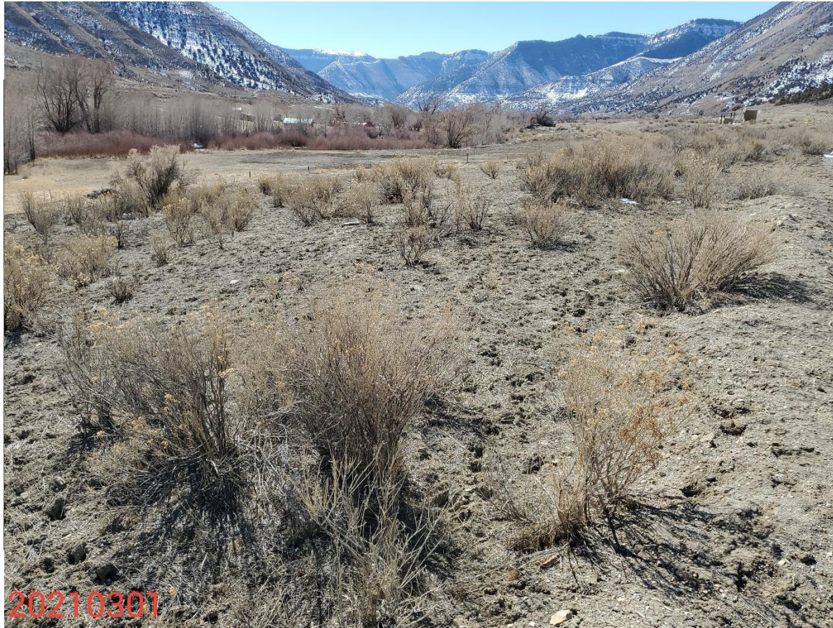
Photo 6: Photo taken from the eastern interim areas of the Location, facing south. See comments under photo 5