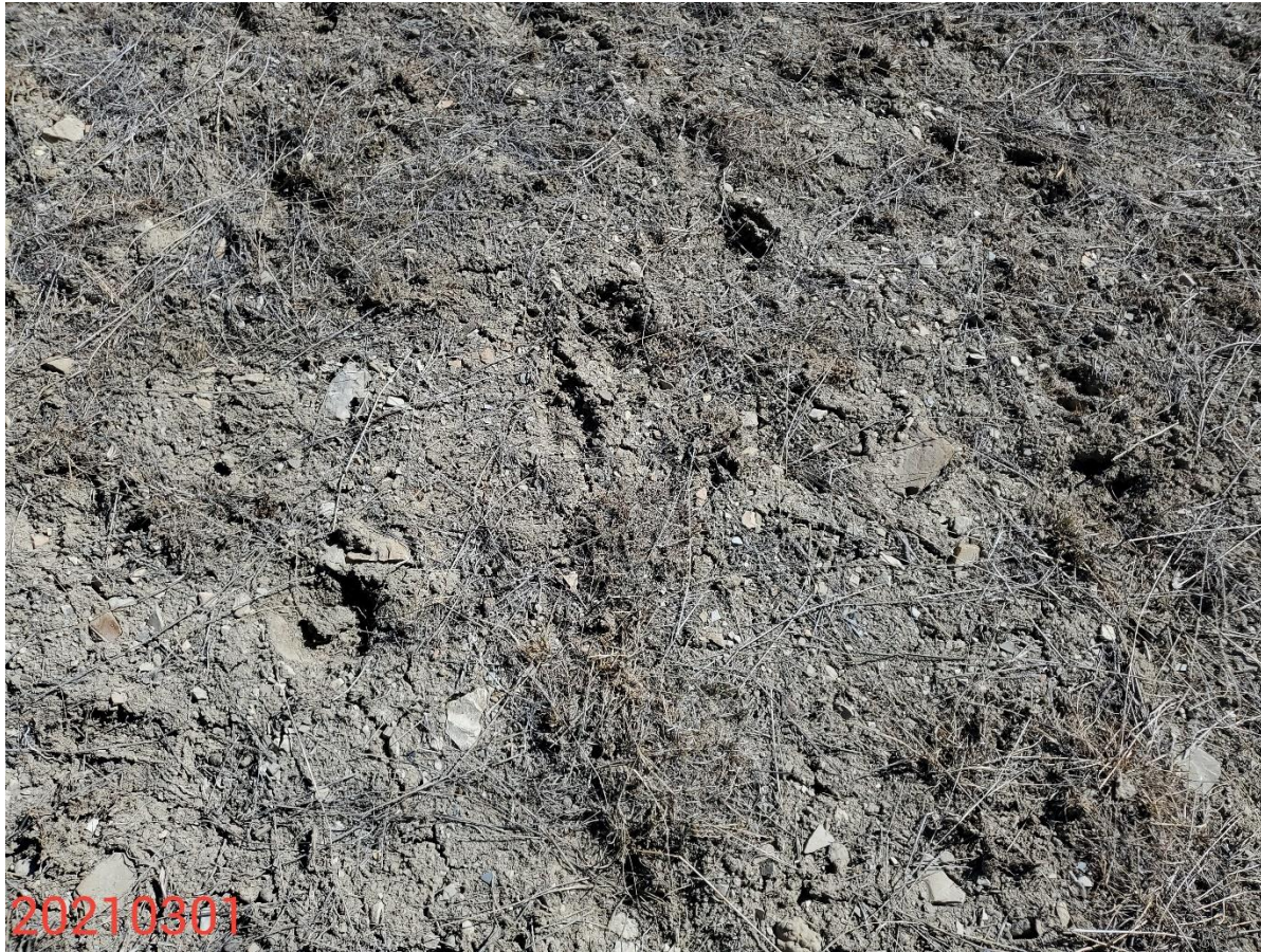
Photo 4: Photo taken from the interim areas. Photo shows desirable perennial vegetative establishment is evident. Cheat grass and heavy grazing pressure also evident throughout interim areas.