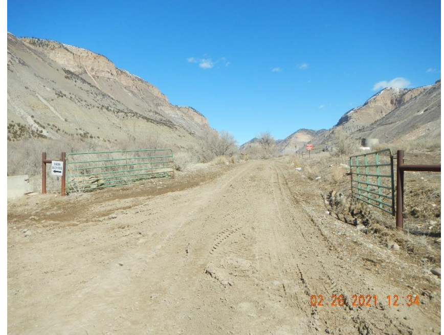
Access road shows signs of lack of stabilization BMP's in some areas (rutting is present).