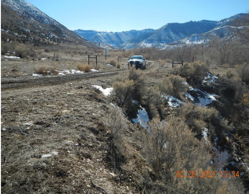
Access road along eroding creek bank.