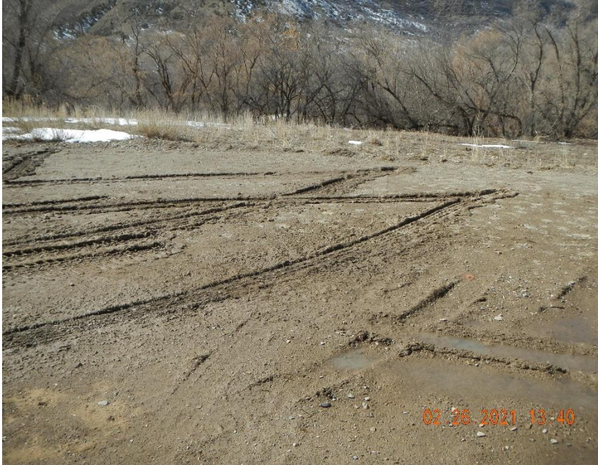
Location shows signs of lack of stabilization BMP's in some areas (rutting is present).