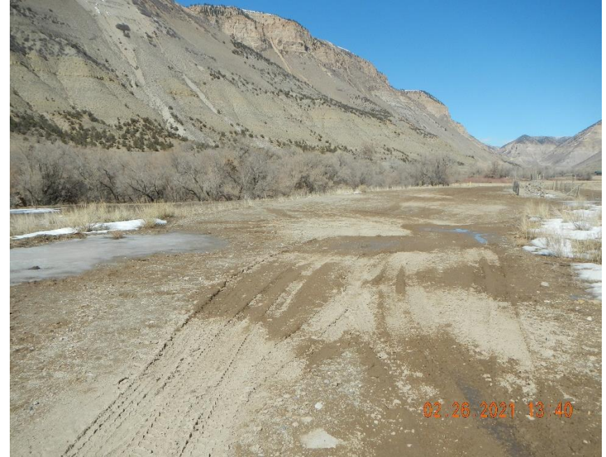
Location shows signs of lack of stabilization BMP's in some areas (rutting is present).