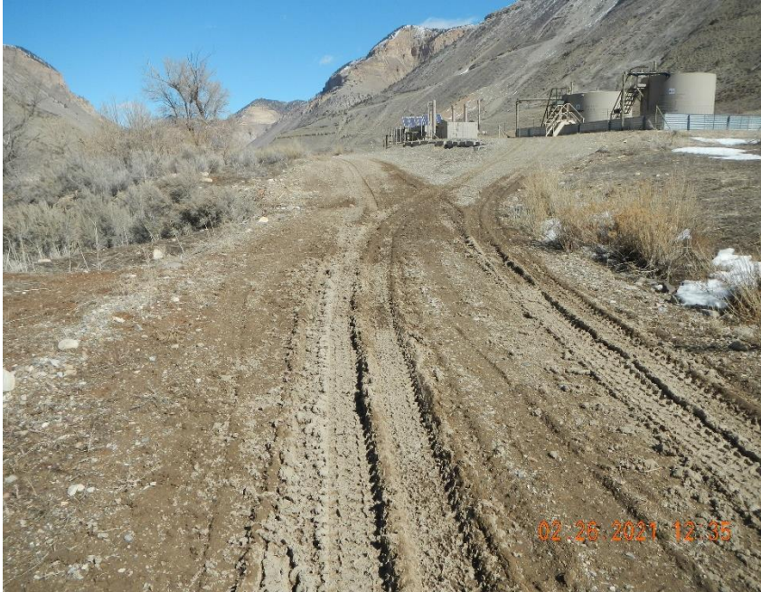
Access road shows signs of lack of stabilization BMP's in some areas (rutting is present).