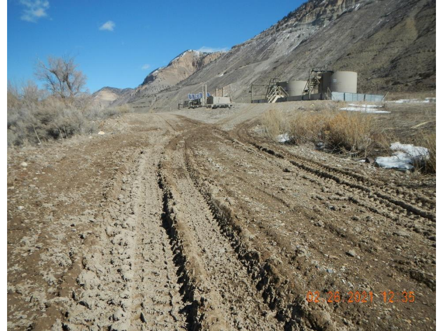
Access road shows signs of lack of stabilization BMP's in some areas (rutting is present).