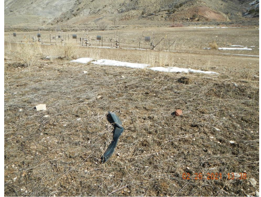
Flattened water hose off the edge of location.