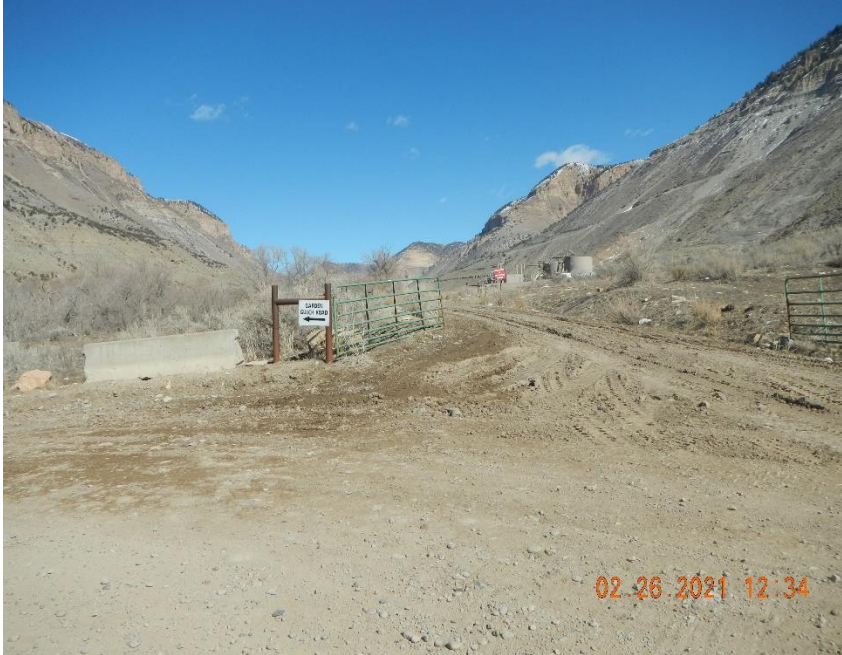
Access road shows signs of lack of stabilization BMP's in some areas (rutting is present).