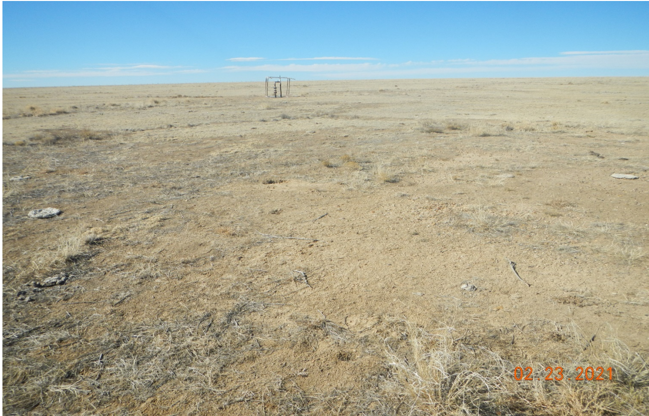
Photo 4. Facing northwest at the location. Vegetation has not re-established in this area. Soil may be compacted in this area.