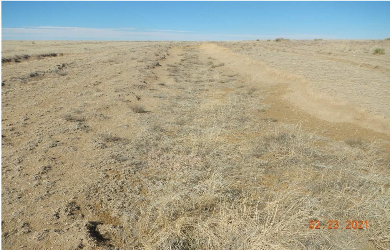
Photo 2. Facing north along the former access road at Lat/Long:37.87672,-102.72188. This area of the road has eroded and needs to be repaired and reclaimed.