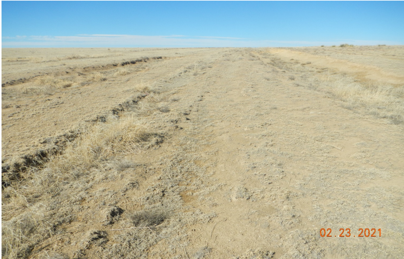
Photo 1. Facing north along the former access road at Lat/Long:37.87672,-102.72188. This area of the road has eroded and needs to be repaired and reclaimed.