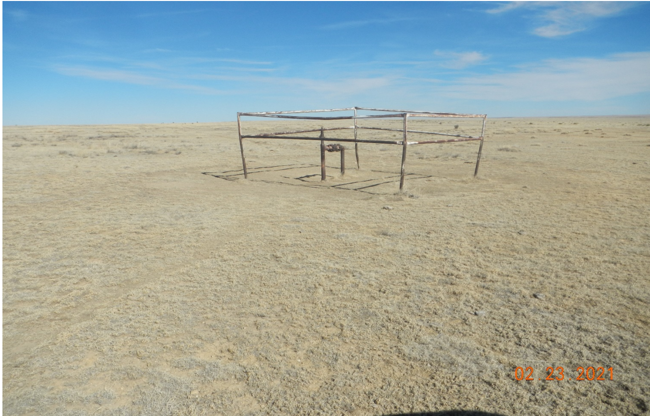
Photo 6. Another pipe riser associated with the well site was found at Lat/Long:37.87789,-102.71800. All equipment/risers need to be removed.