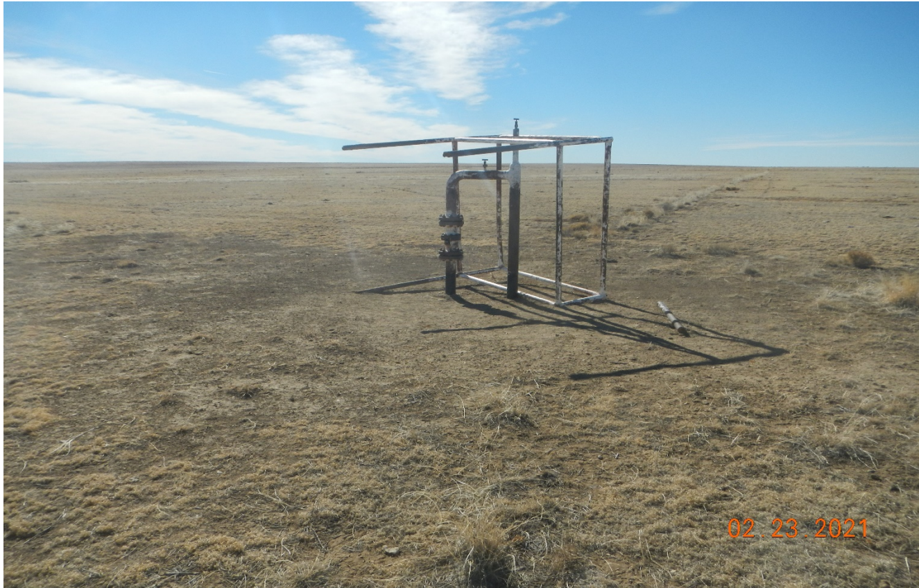
Photo 5. Facing toward the pipe riser at the west side of the location. All equipment/risers need to be removed.