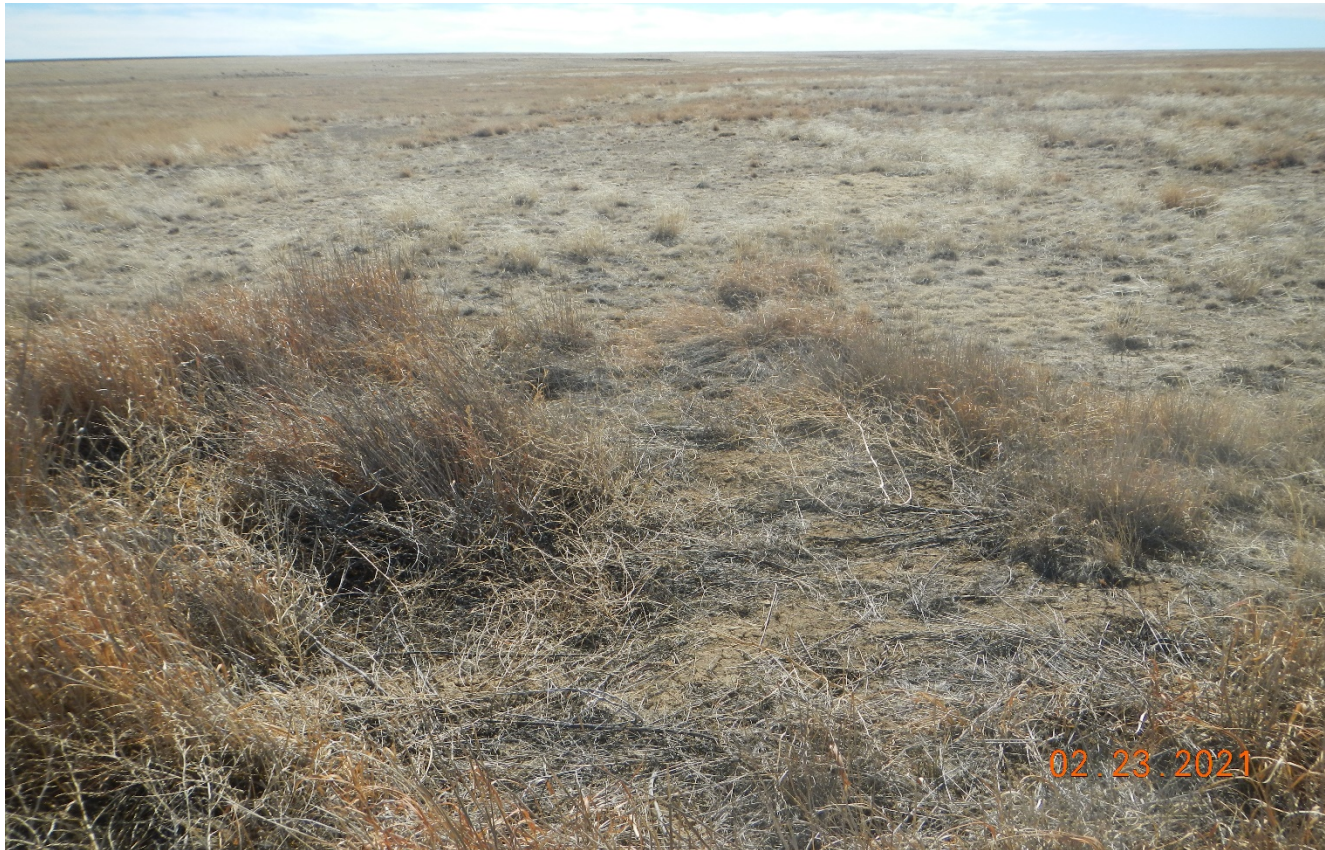
Photo 3. Facing south at the center of the location.