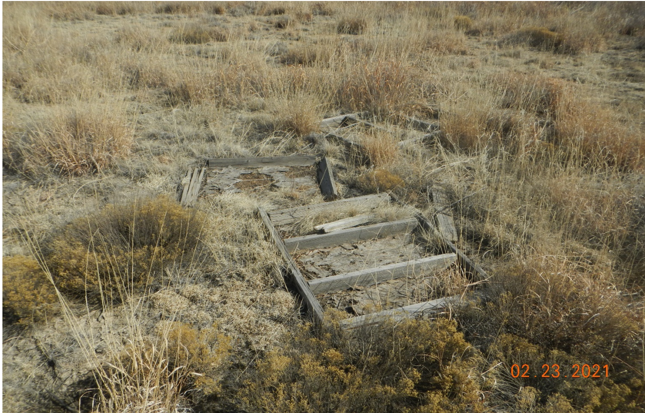
Photo 4. Plywood debris has not been removed.