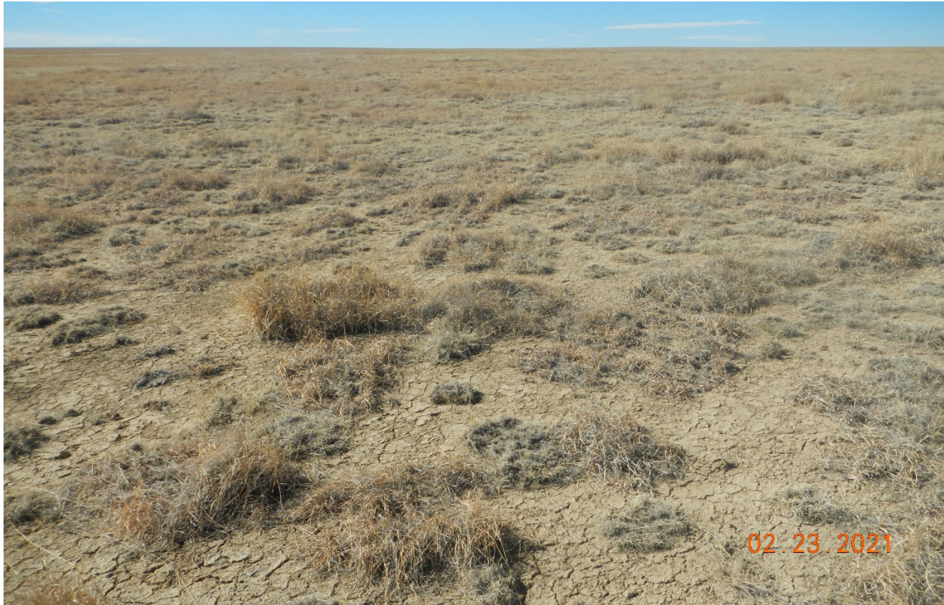
Photo 6. Facing west toward the surrounding undisturbed area.