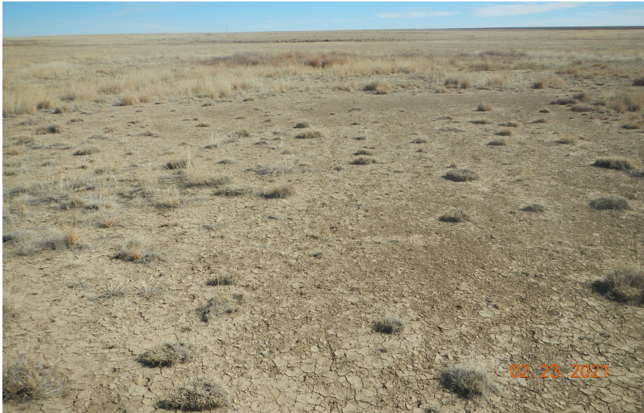
Photo 5. Facing east at the north side of the location. This area has not established vegetation.