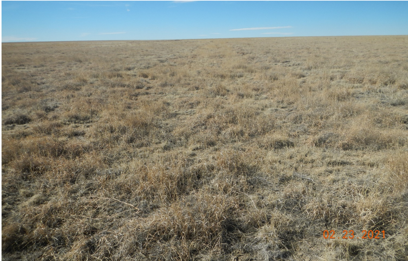
Photo 1. Facing west toward the reclaimed access road. Vegetation has uniformly re-established.