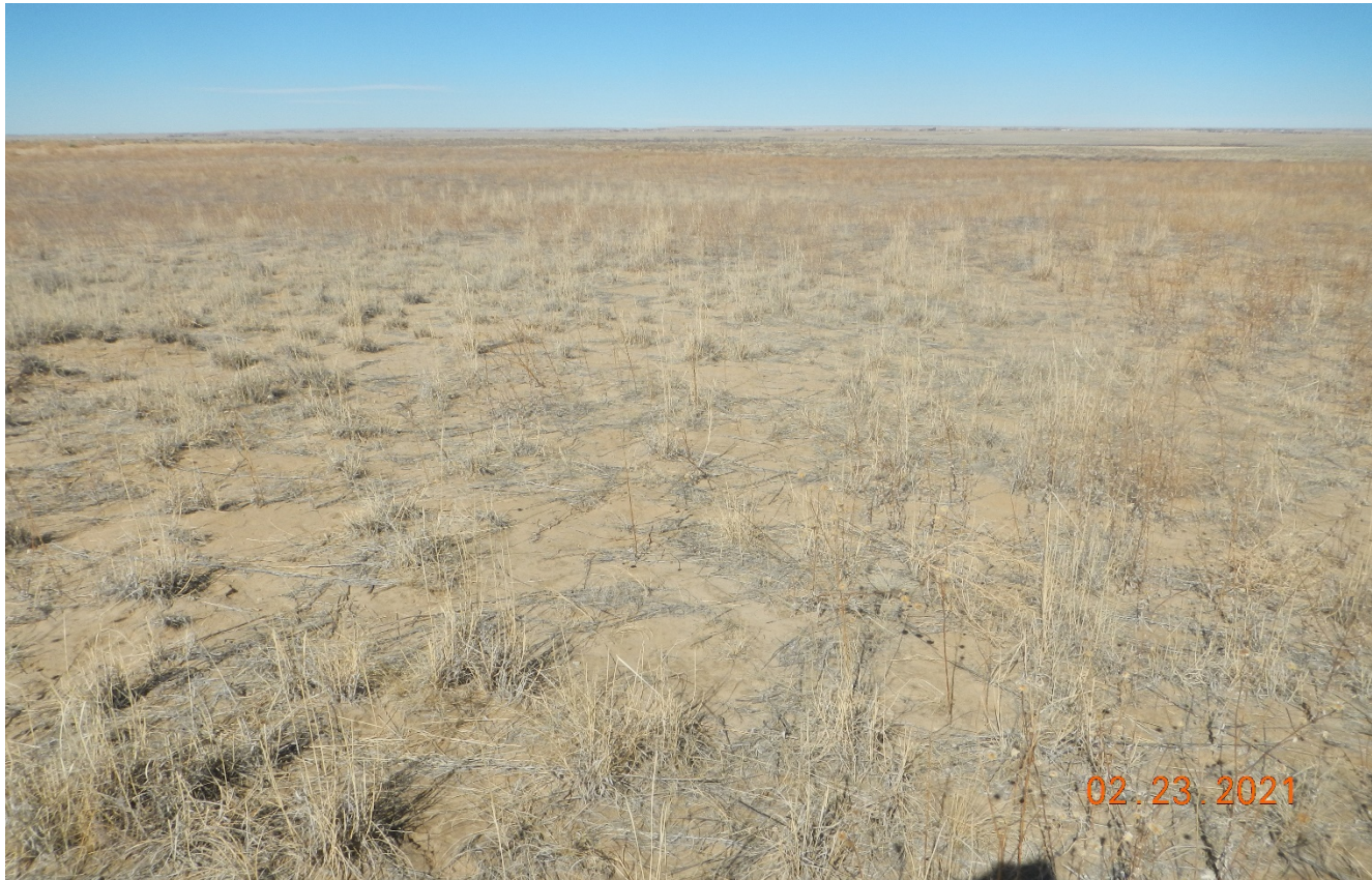
Photo 7. Facing north toward the surrounding undisturbed area.