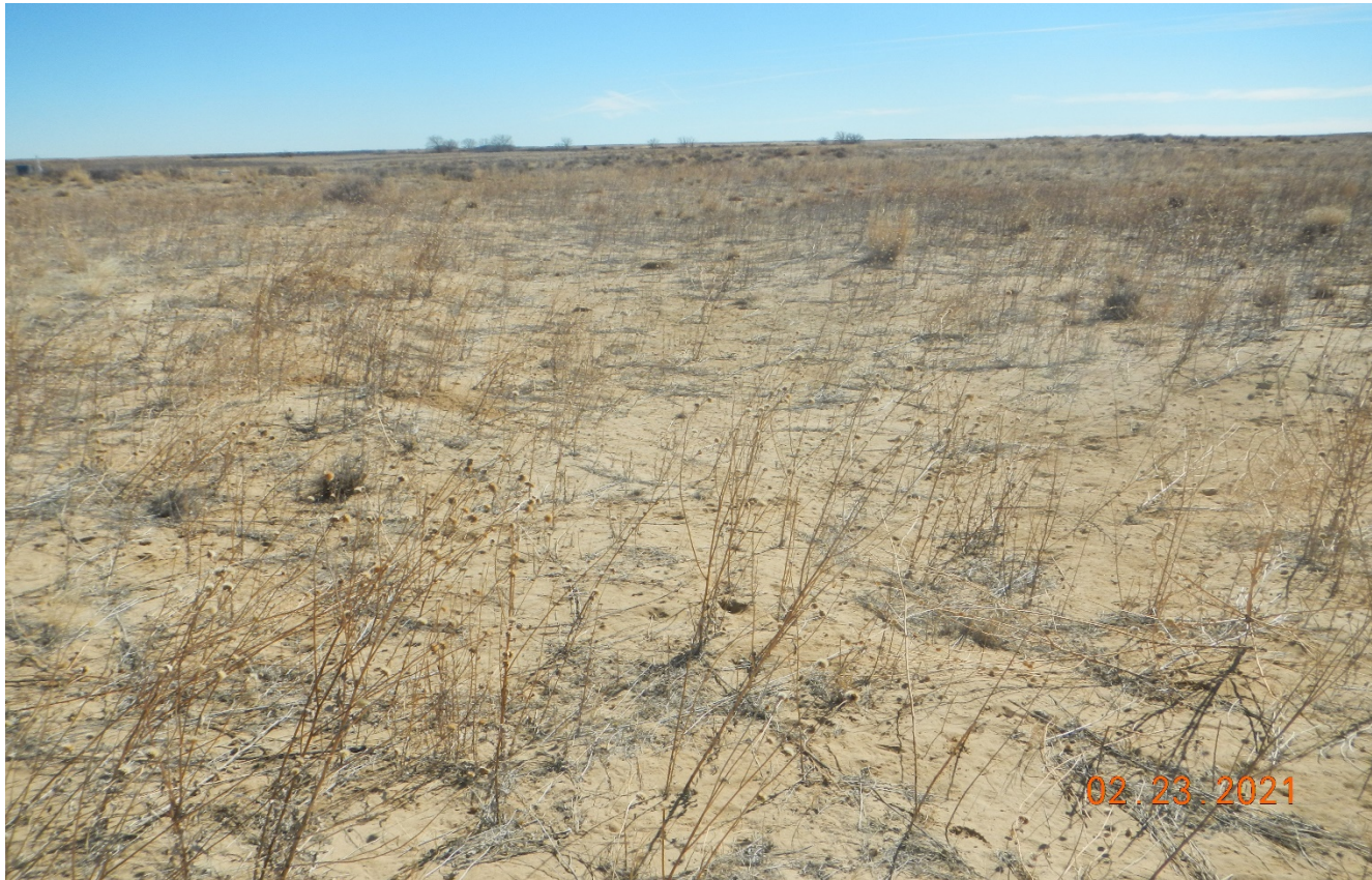
Photo 6. Facing southeast at the location.