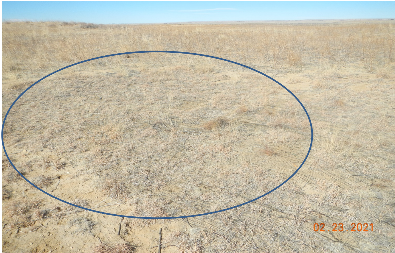
Photo 3. Facing northwest toward the location. The area circled is where straw blanket was installed. Vegetation grew really well compared to other areas without starawblanket.