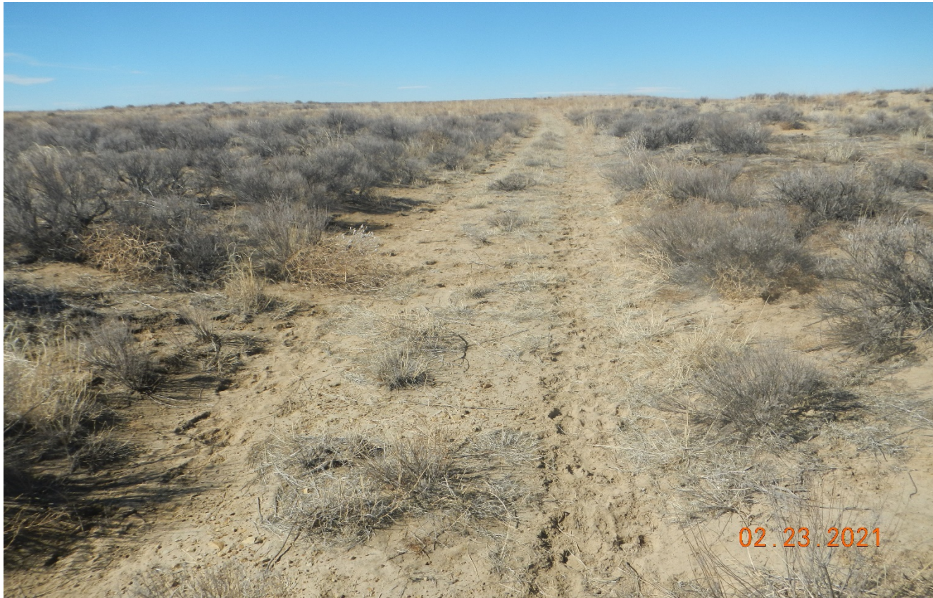
Photo 2. Facing west along the access road. The access road needs to be reclaimed.