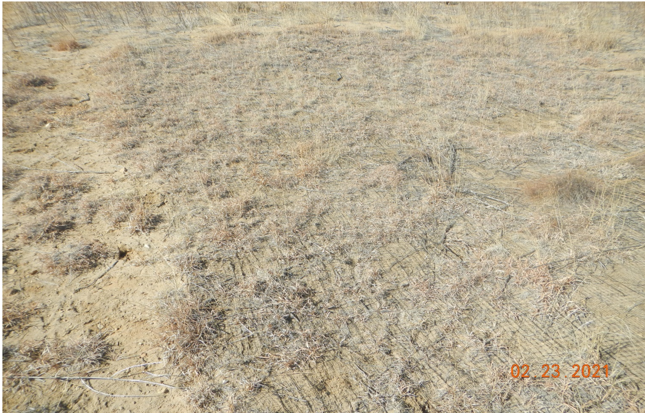
Photo 4. View of groundcover where blanket was installed.