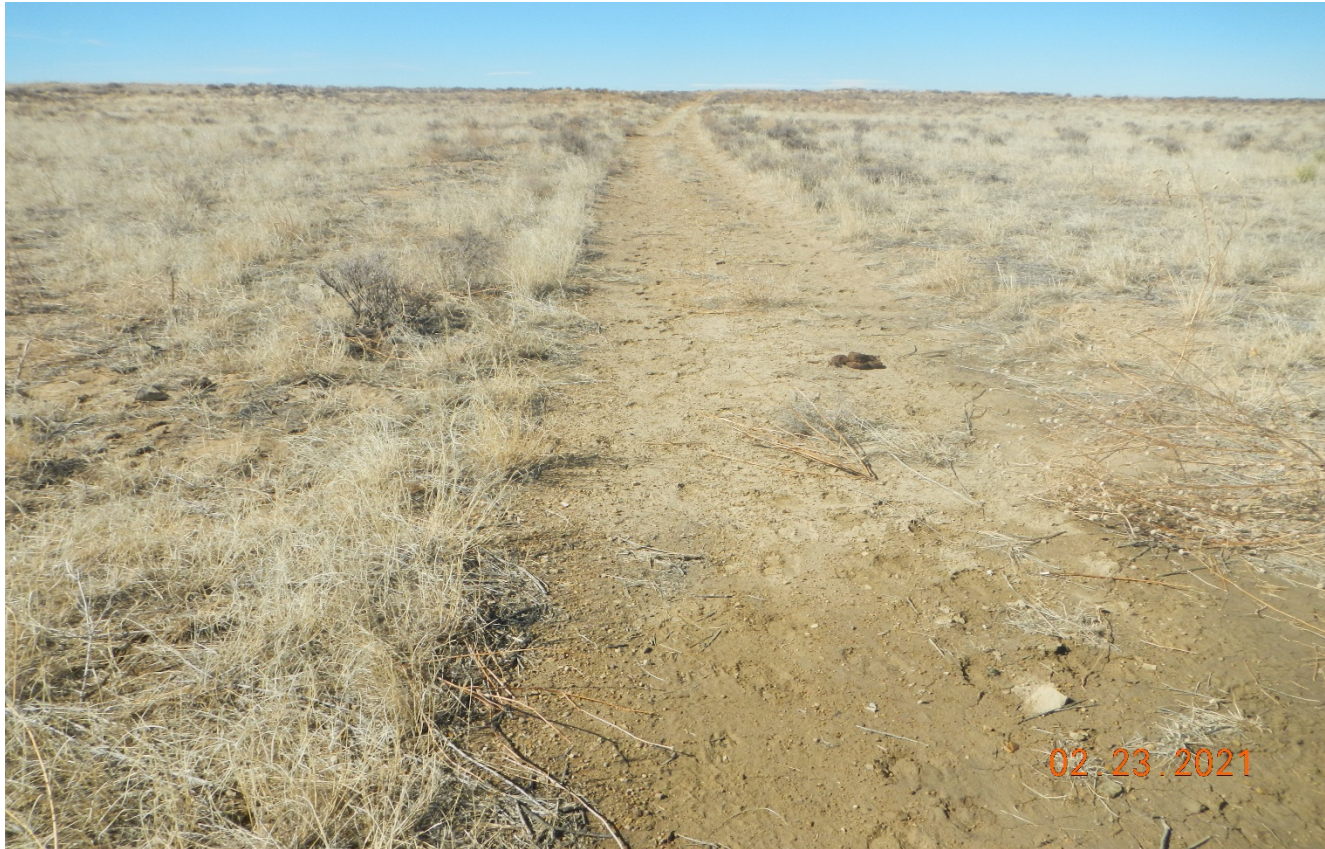
Photo 1. Facing west toward the access road which has not been reclaimed.