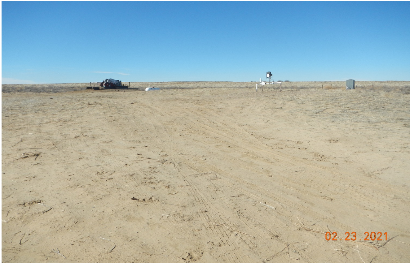
Photo 1. Facing southwest toward the location.