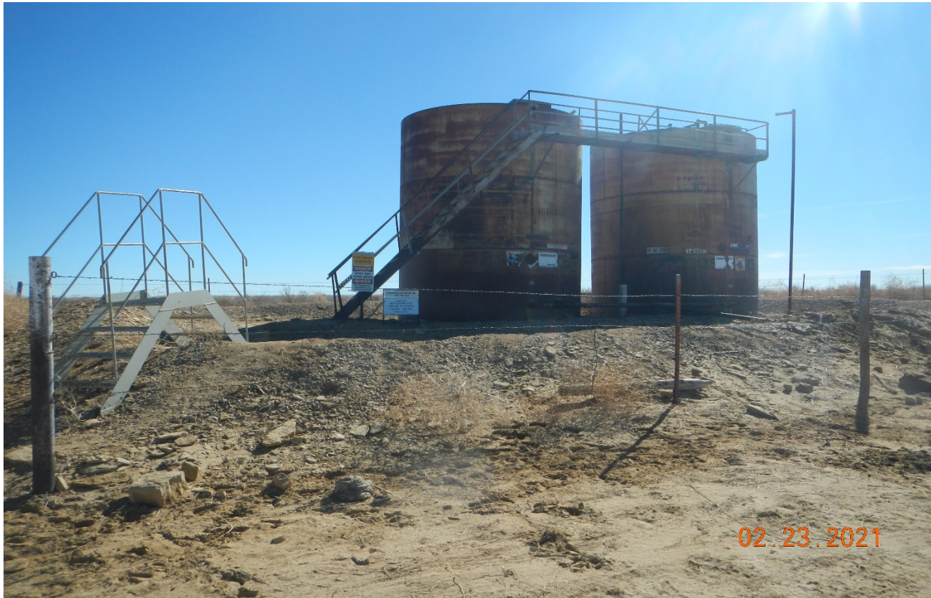
Photo 2. Facing toward the tank battery.