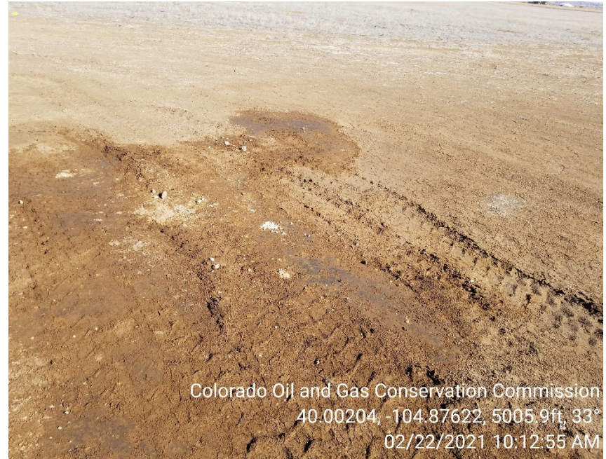
Photo 10 – Stained soil visible on location outside of excavation area