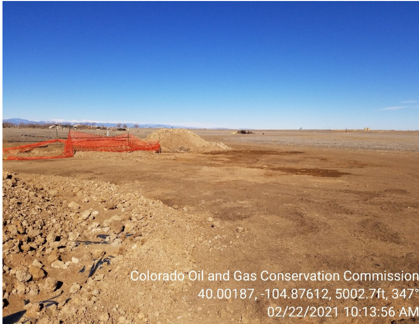
Photo 9 – Stained soil visible on location outside of excavation area