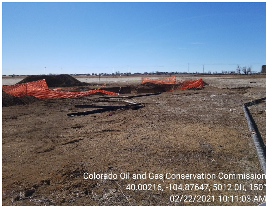
Photo 1 – Spill area. Pipe and additional debris on left on location