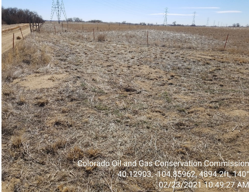
Photo 11 – Former pit area. No evidence of work performed for Remediation Project No. 16185.