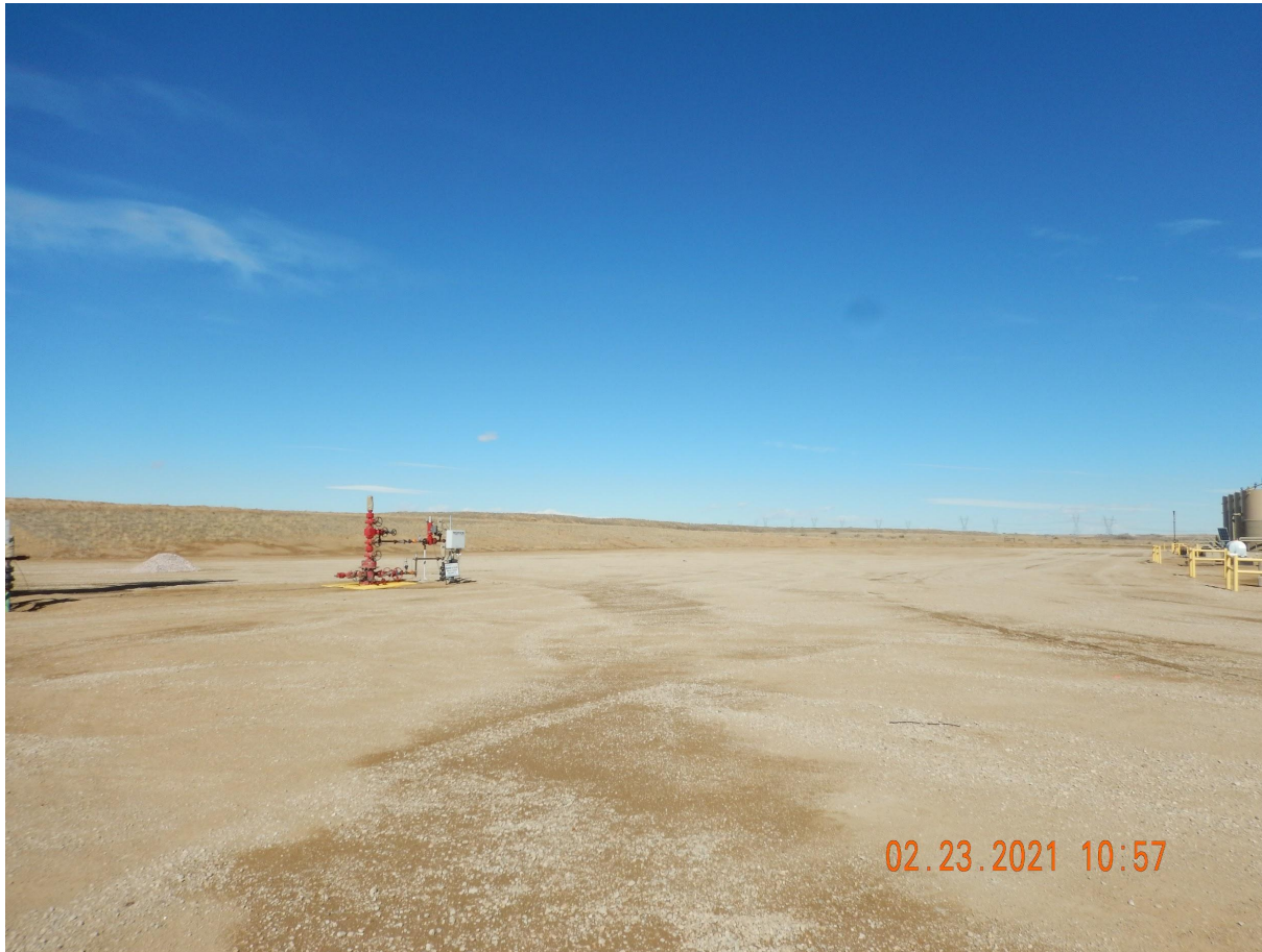
Photo 2. Photo taken from the southern location, facing Northwest. Photo documents that interim reclamation has not commenced.