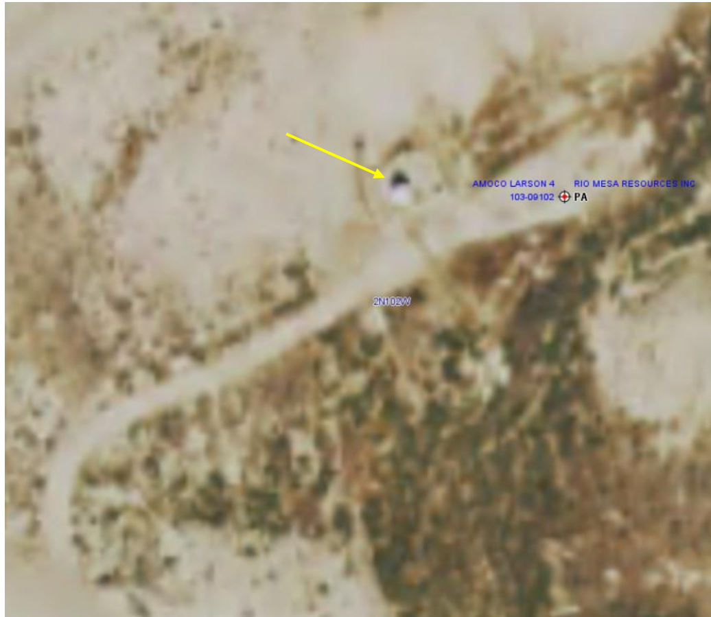
Photo 8: 2019 COGIS aerial image of the Location. Records show well PA 5/27/2014; Pursuant to Rule 1004.a, surface equipment required to be removed by 8/27/2014, and all reclamation work required to be completed by 5/27/2015. Photo shows equipment (tank) remained on the Location in 2019.