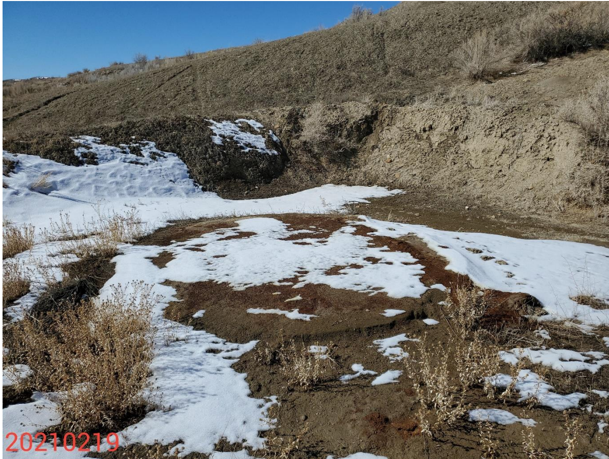
Photo 4: Photo taken from the north end of the Location, facing west. Photo shows area where production equipment (tank) was Location. Photo shows areas have not been reclaimed in accordance with COGCC 1004 Rules.