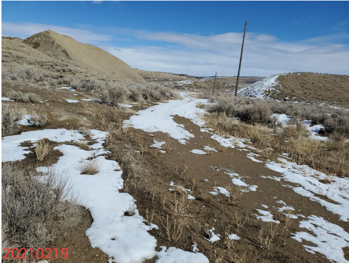
Photo 7: Photo taken from the access road, west of the Location, facing east. Photo shows access road/Location has not been reclaimed in accordance with COGCC 1004 Rules.