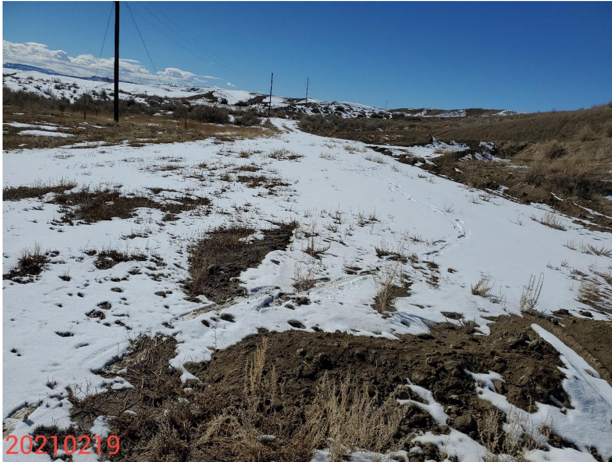
Photo 6: Photo taken from the east end of the Location, facing west. Photo shows Location has not been reclaimed in accordance with COGCC 1004 Rules.