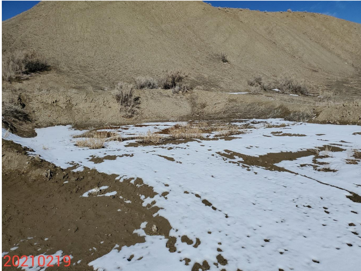
Photo 3: Photo taken from the north end of the Location, facing northeast. Photo shows area where production equipment (tank) was Location. Photo shows areas have not been reclaimed in accordance with COGCC 1004 Rules.