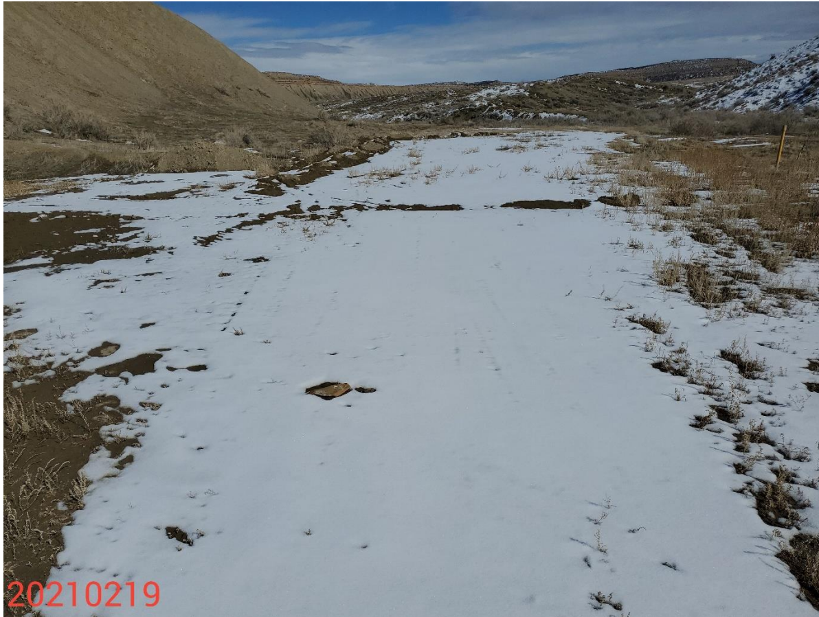
Photo 2: Photo taken from the west end of the Location, facing east. Photo shows Location has not been reclaimed in accordance with COGCC 1004 rules.