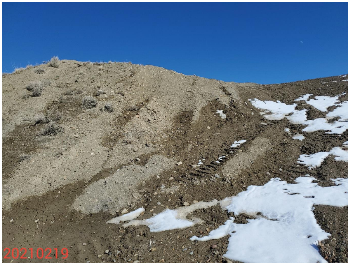
Photo 9: Continued from photo #8. See comments under photo #4 regarding uniform revegetation activities and stormwater/erosion control management.