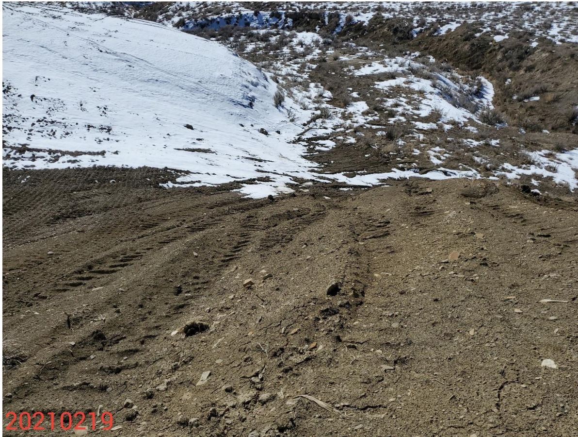
Photo 7: Photo taken from the west end of the Location, facing southwest. See comments under photo #4 regarding uniform revegetation activities and stormwater/erosion control management.