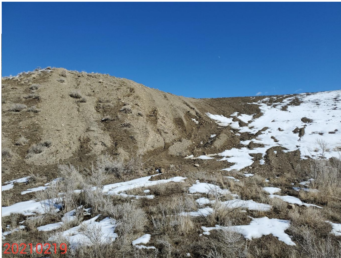
Photo 8: Photo taken from the west end of the Location, facing east. Photo looking up the slopes in photo #7. See comments under photo #4 regarding uniform revegetation activities and stormwater/erosion control management.