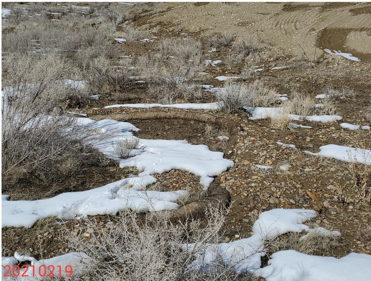
Photo 13: Photo shows stormwater runoff controls (straw wattles) observed on the southwestern perimeter of the Location. BMPs are no longer in proper functioning condition. Stormwater and erosion control measures are missing, or insufficient to stabilize the soils and manage runoff from the Location.