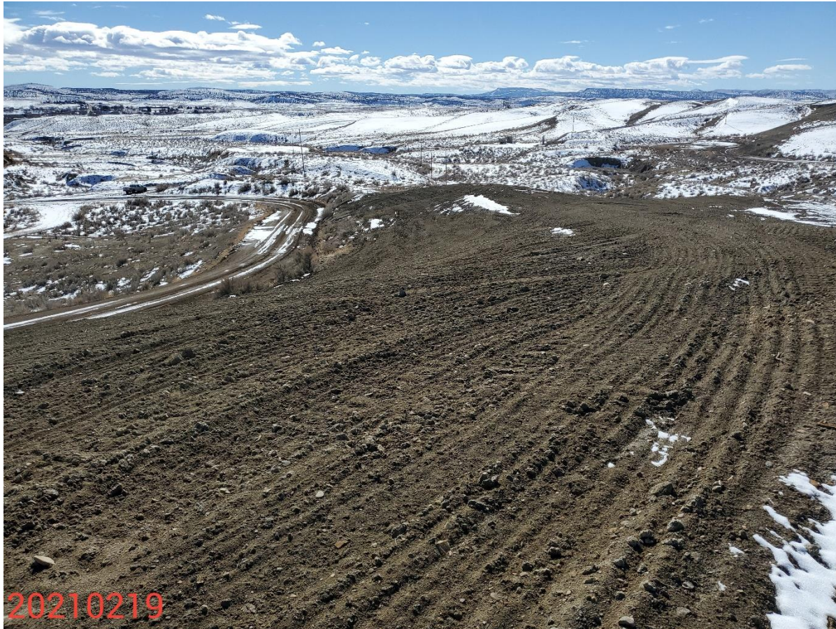
Photo 6: Photo taken from the northeast end of the Location, facing southwest. See comments under photo 6.