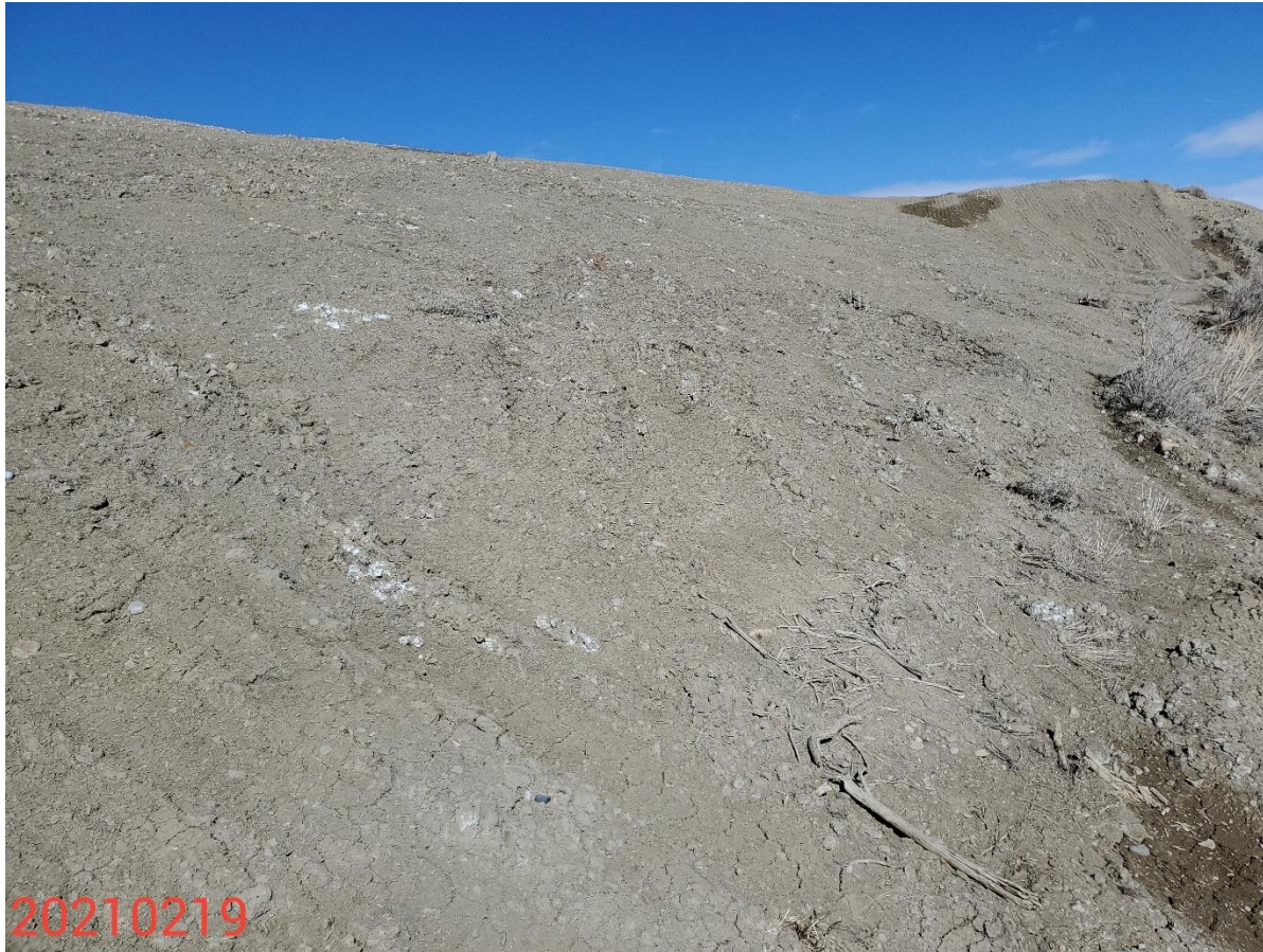
Photo 4: Photo taken from the slopes on the east end of the disturbance area/Location. It was observed that drill seeding appears to have been conducted on the Location. Photo shows an example of slopes observed on the Location where drill seeding, or broadcast seeding is not evident; uniform revegetation activities do not appear to have been conducted. Photo also shows that stormwater and erosion control measures are missing, or insufficient to stabilize the soils and manage runoff from the Location.