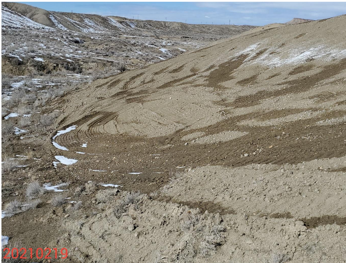
Photo 14: Photo taken southwestern end of the Location/disturbance area, facing north. Photo shows that stormwater and erosion control measures are missing, or insufficient to stabilize the soils and manage runoff from the Location.