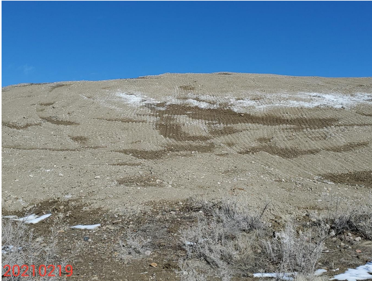
Photo 12: Continued from photo 11. Photo shows areas of the Location where drill seeding was performed up the slope, rather than along the contour; seeding has not been performed in accordance with good engineering practices; stormwater and erosion control measures are missing, or insufficient to stabilize the soils and manage runoff from the Location.