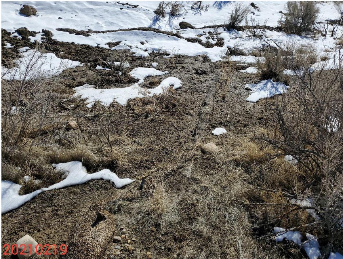
Photo 10: Photo shows stormwater runoff controls (straw wattles) observed on the western perimeter of the Location. BMPs are no longer in proper functioning condition. Stormwater and erosion control measures are missing, or insufficient to stabilize the soils and manage runoff from the Location.