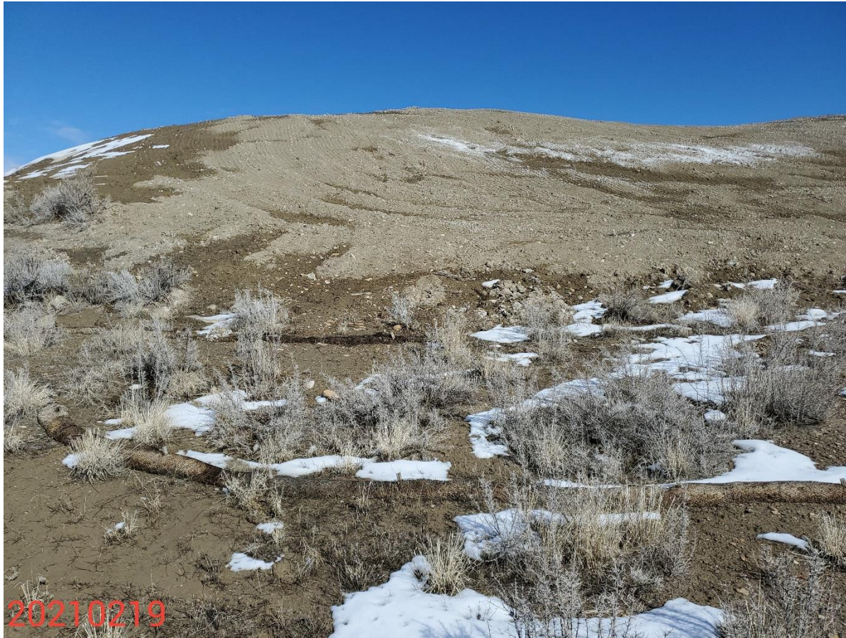
Photo 11: Photo taken southwestern end of the Location/disturbance area, facing northeast. Photo shows that stormwater and erosion control measures are missing, or insufficient to stabilize the soils and manage runoff from the Location.