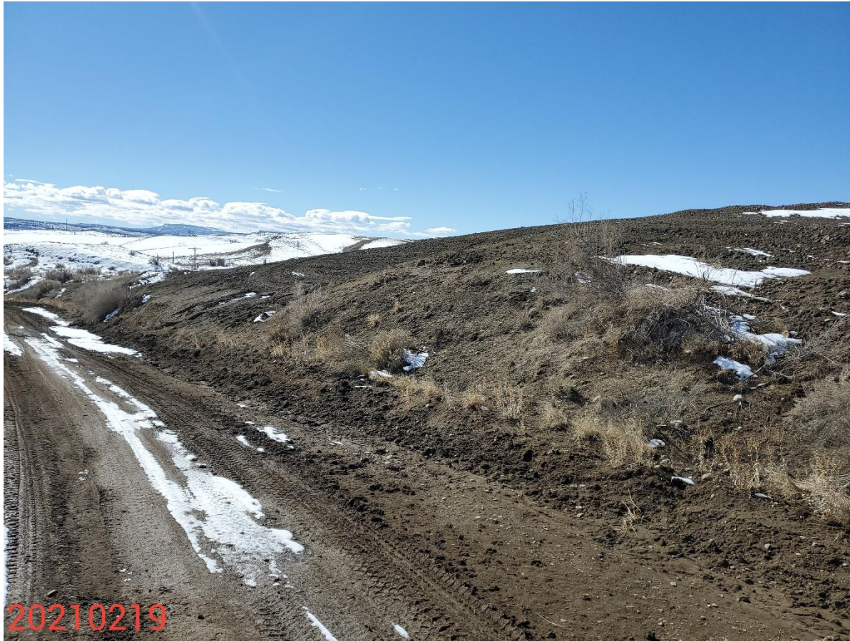
Photo 1: Photo taken from the access road east of the Location, facing southwest. Photo 1-3 provide an overview of the Location/reclamation area from southwest to northwest.