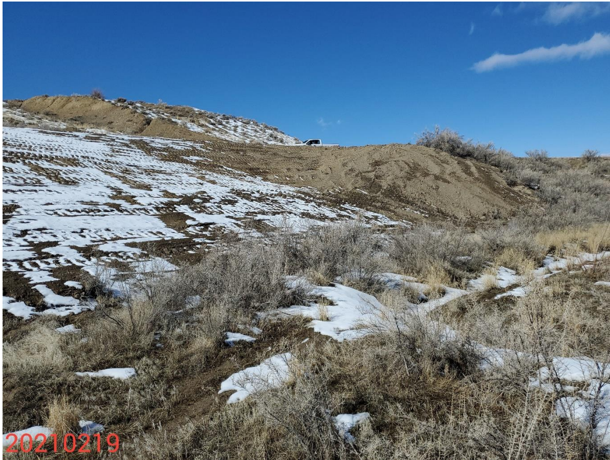
Photo 7: Photo taken from the reast end of the Location, facing north. Photo shows stormwater and erosion control measures are missing, or insufficient to stabilize the soils and manage runoff from the Location.