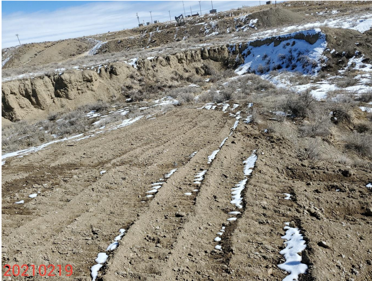
Photo 5: Photo taken from the southwest end of the Location, facing east. Photo shows stormwater and erosion control measures are missing, or insufficient to stabilize the soils and manage runoff from the Location.