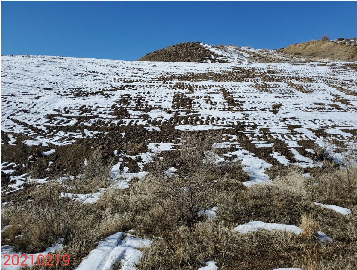
Photo 6: Photo taken from the east end of the Location, facing west. Photo shows stormwater and erosion control measures are missing, or insufficient to stabilize the soils and manage runoff from the Location; Operator appears to have only installed surface roughening (tracking) on the Location, no additional BMPs have been installed in conjunction with surface roughening; photo also shows that tracking has been installed perpendicular to the contours of the land, and not parallel in accordance with good engineering practices.