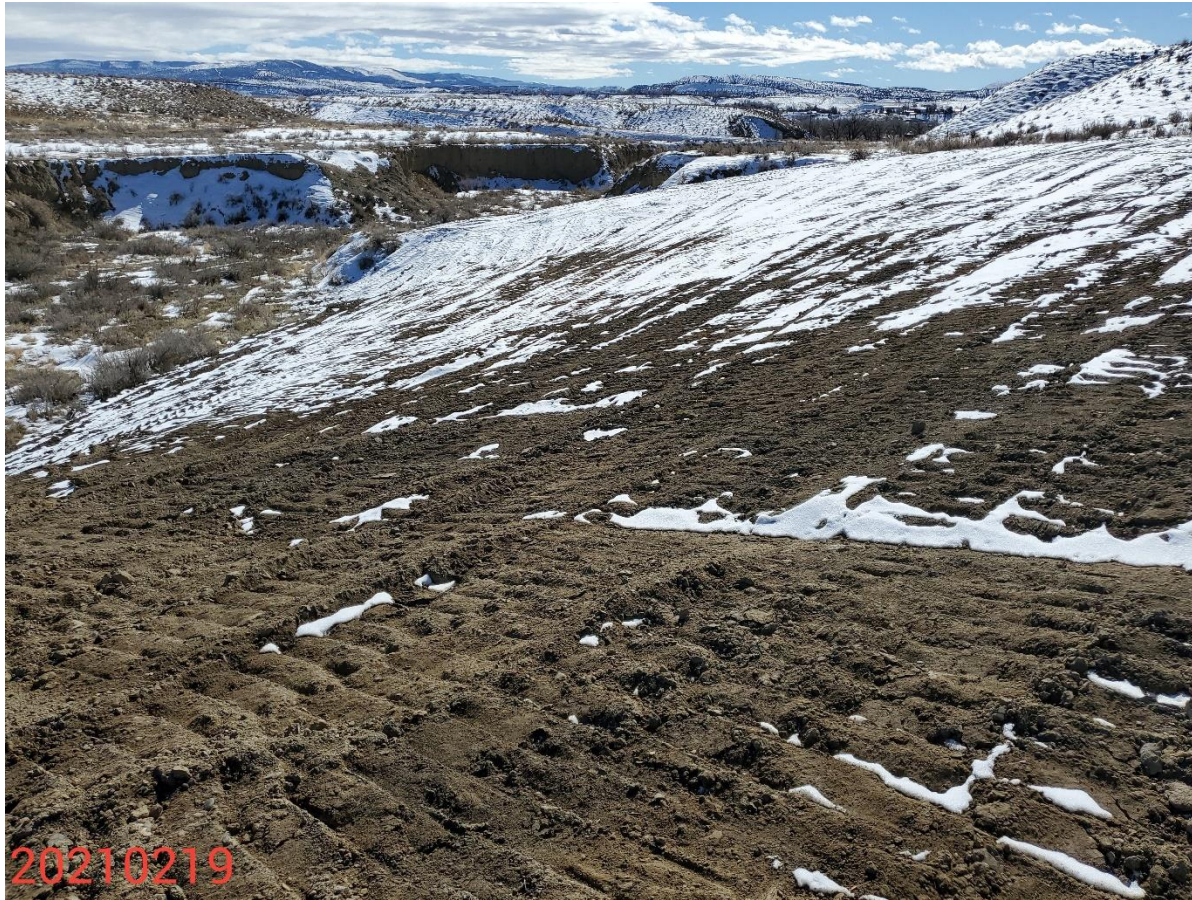
Photo 2: Photo taken from the north end of the Location, facing southeast. Photos 2-4 provide an overview of the Location from southeast, south to southwest.