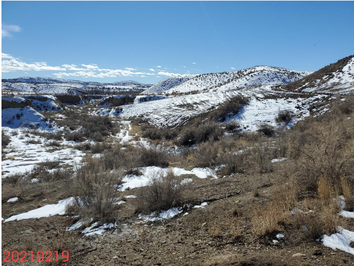
Photo 1: Photo taken from the access road north of the Location, facing south. Photo provides and overview of the Location/reclamation area.