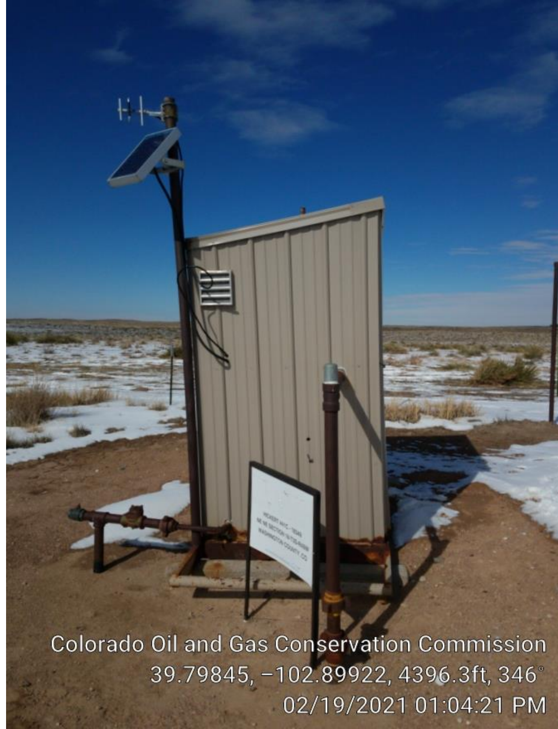
Colorado Oil and Gas Conservation Commission 39.79845, -102.89922, 4396.3ft, 346° 02/19/2021 01:04:21 PM