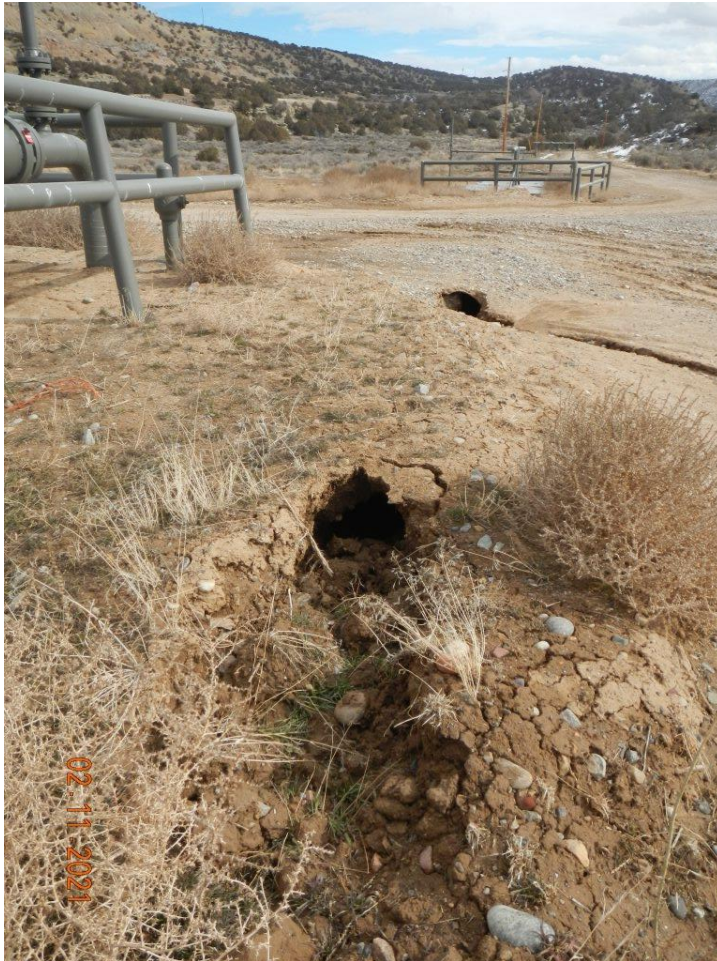
Photo#17: Erosion concerns at access road intersection with main lease road.