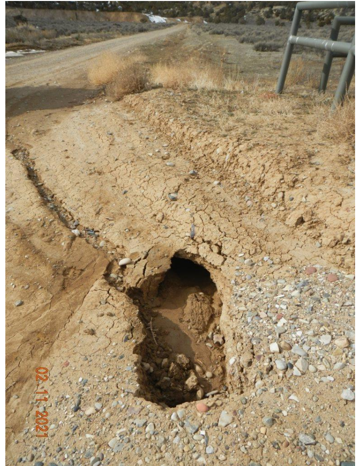
Photo#18: Erosion concerns at access road intersection with main lease road.