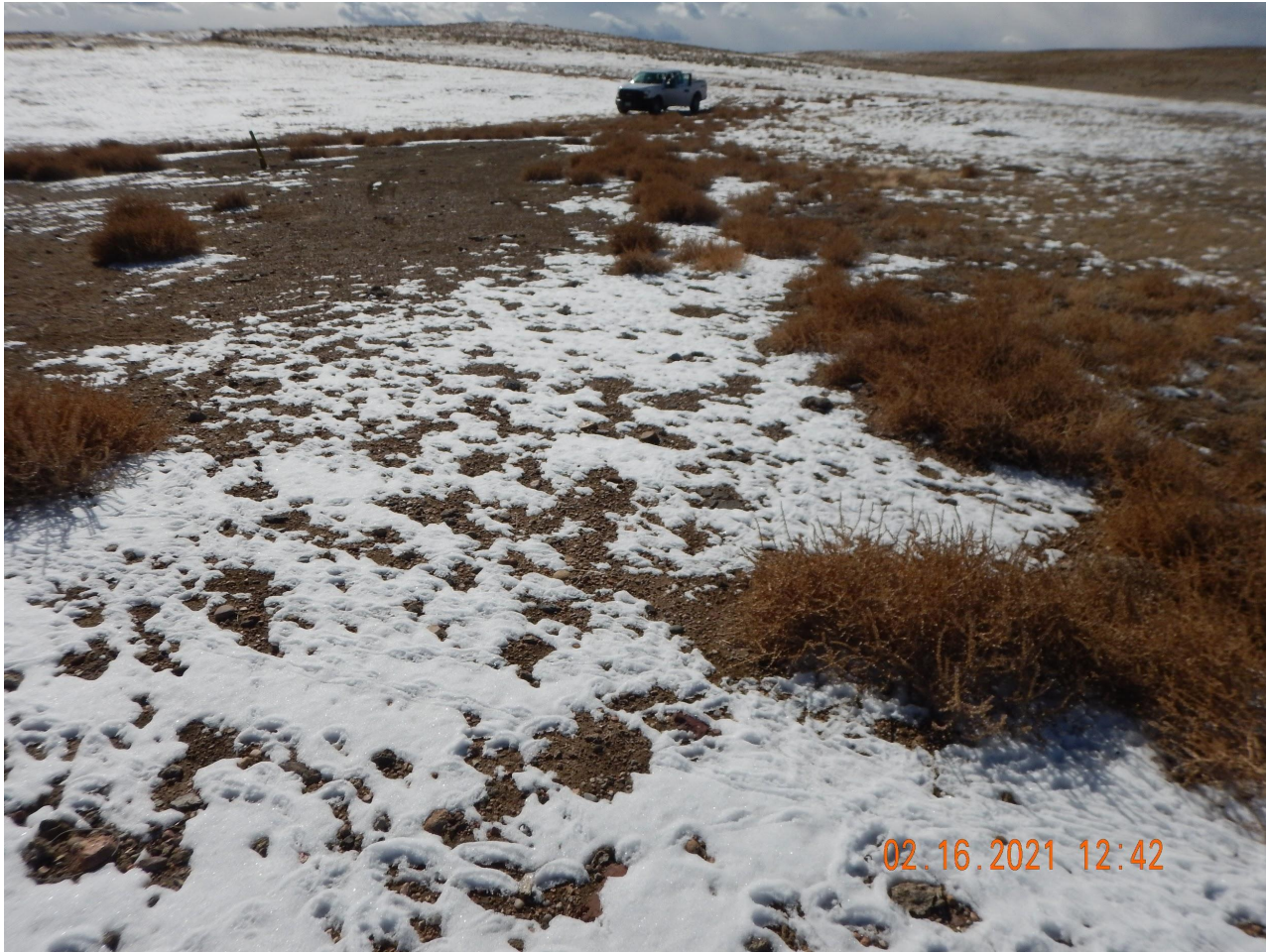
Photo 8. Photo taken from the well location, facing West. See comments under Photo 6.