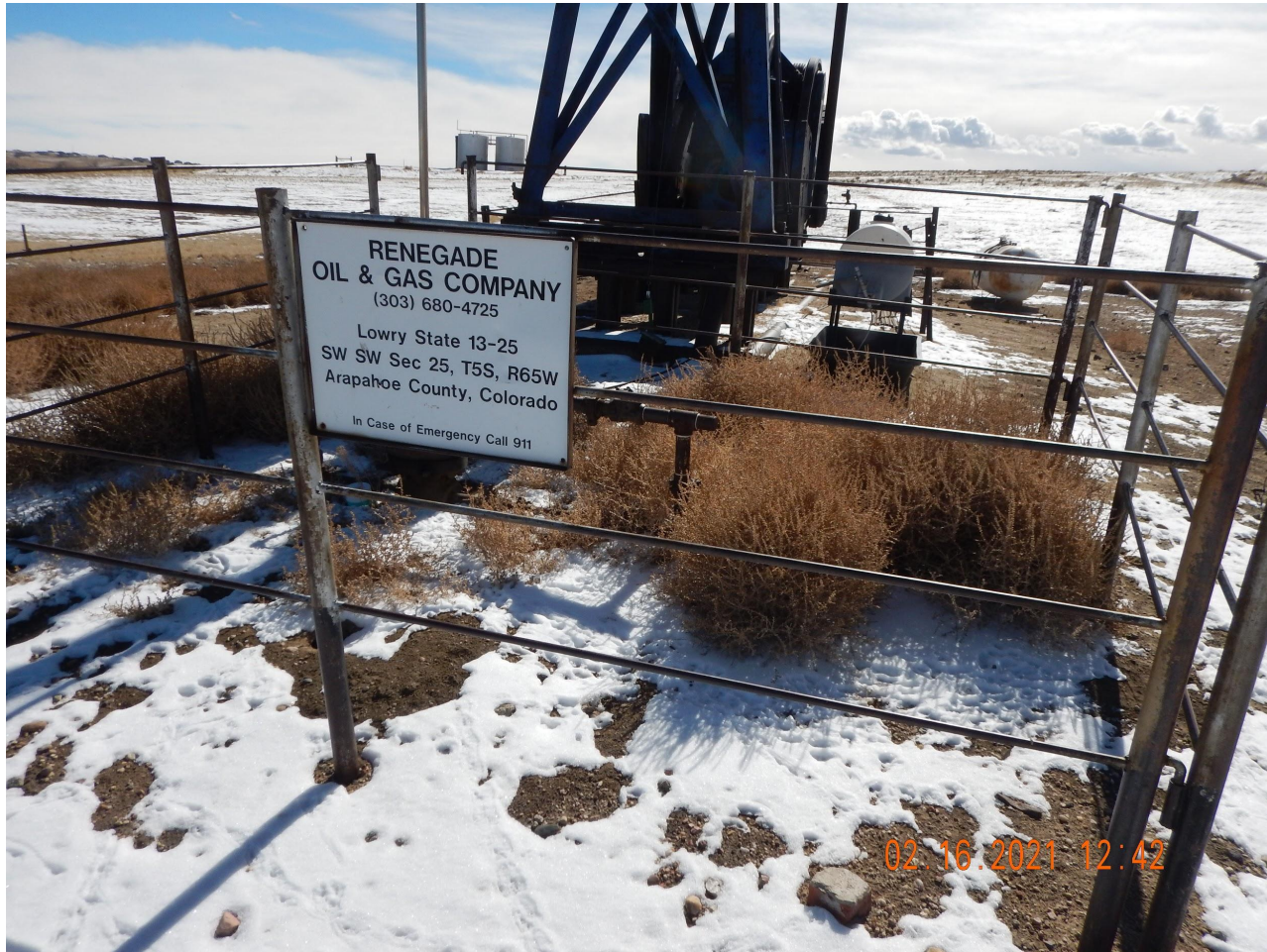
Photo 6. Photo taken from the well location, facing South. Photo illustrates unmanaged weeds.