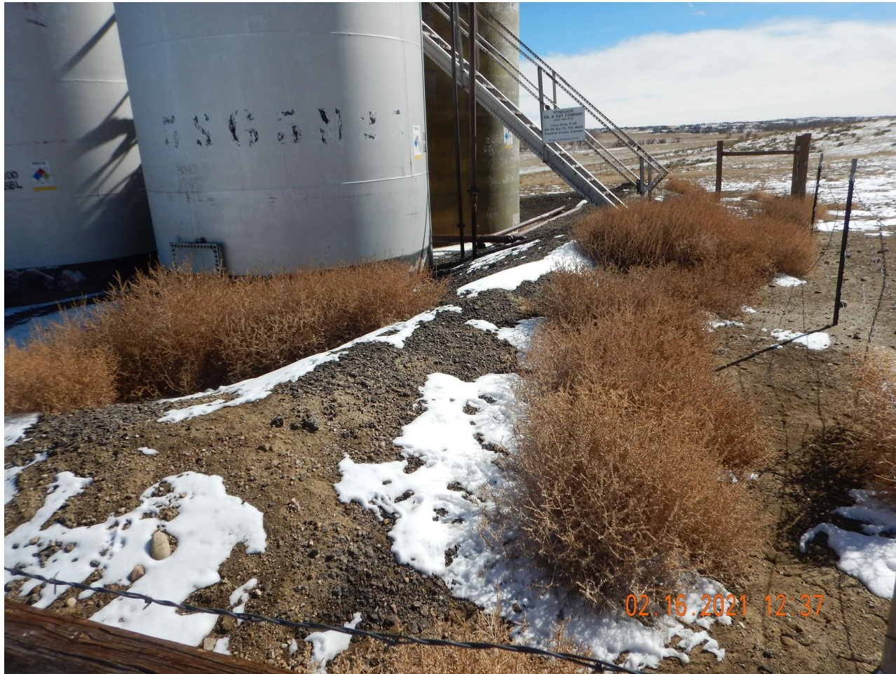
Photo 2. Photo taken from the western tank battery, facing South. Photo illustrates unmanaged weeds.