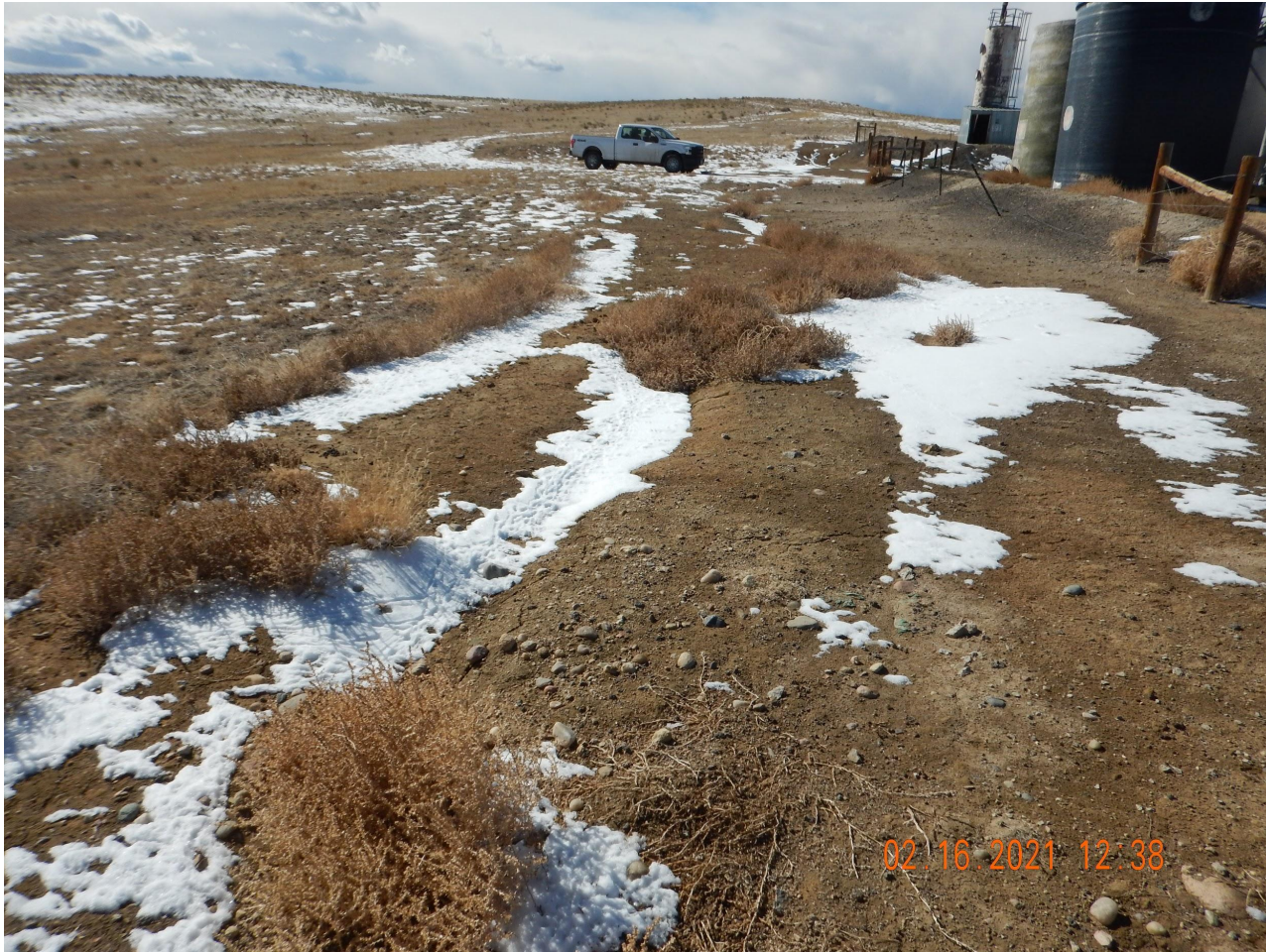
Photo 4. Photo taken from the eastern tank battery, facing West. Photo illustrates stormwater erosion due to concentrated runoff from the tank battery location.