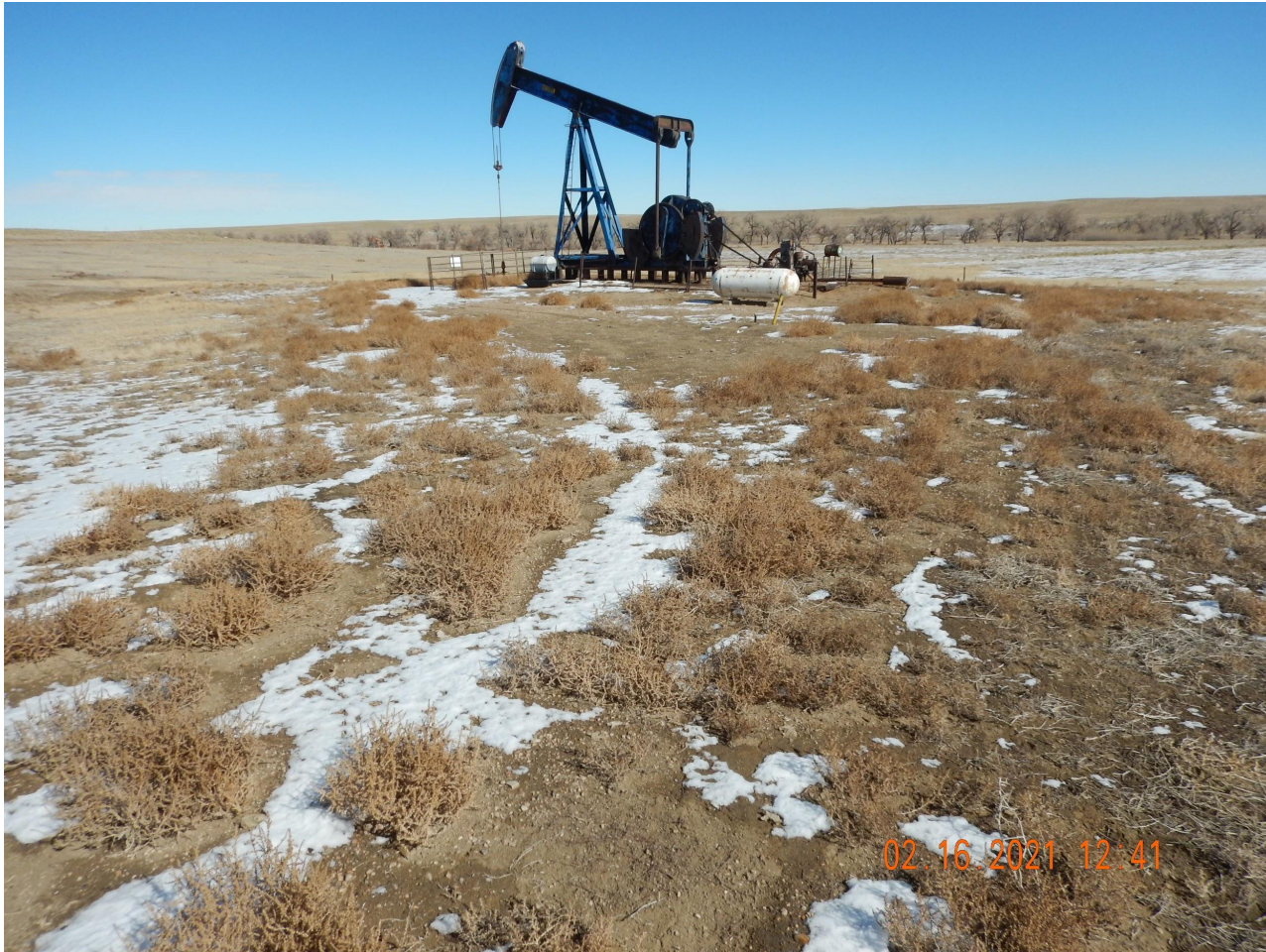
Photo 7. Photo taken from the western well location, facing East. See comments under Photo 6.