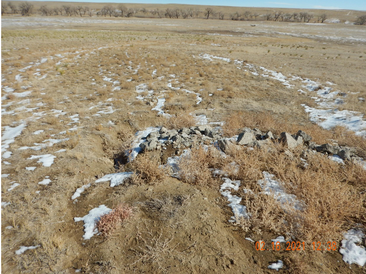
Photo 3. Photo taken from the eastern tank battery, facing East. Photo illustrates stormwater erosion due to concentrated runoff from the tank battery location.