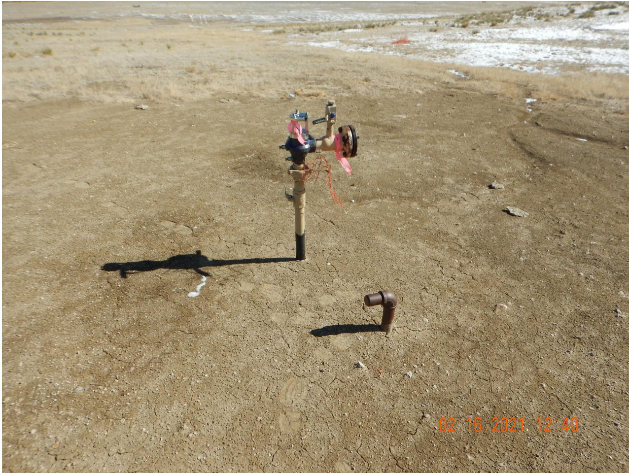
Photo 5. Photo taken from the southern tank battery, facing East. Photo illustrates risers from a previous meter house.