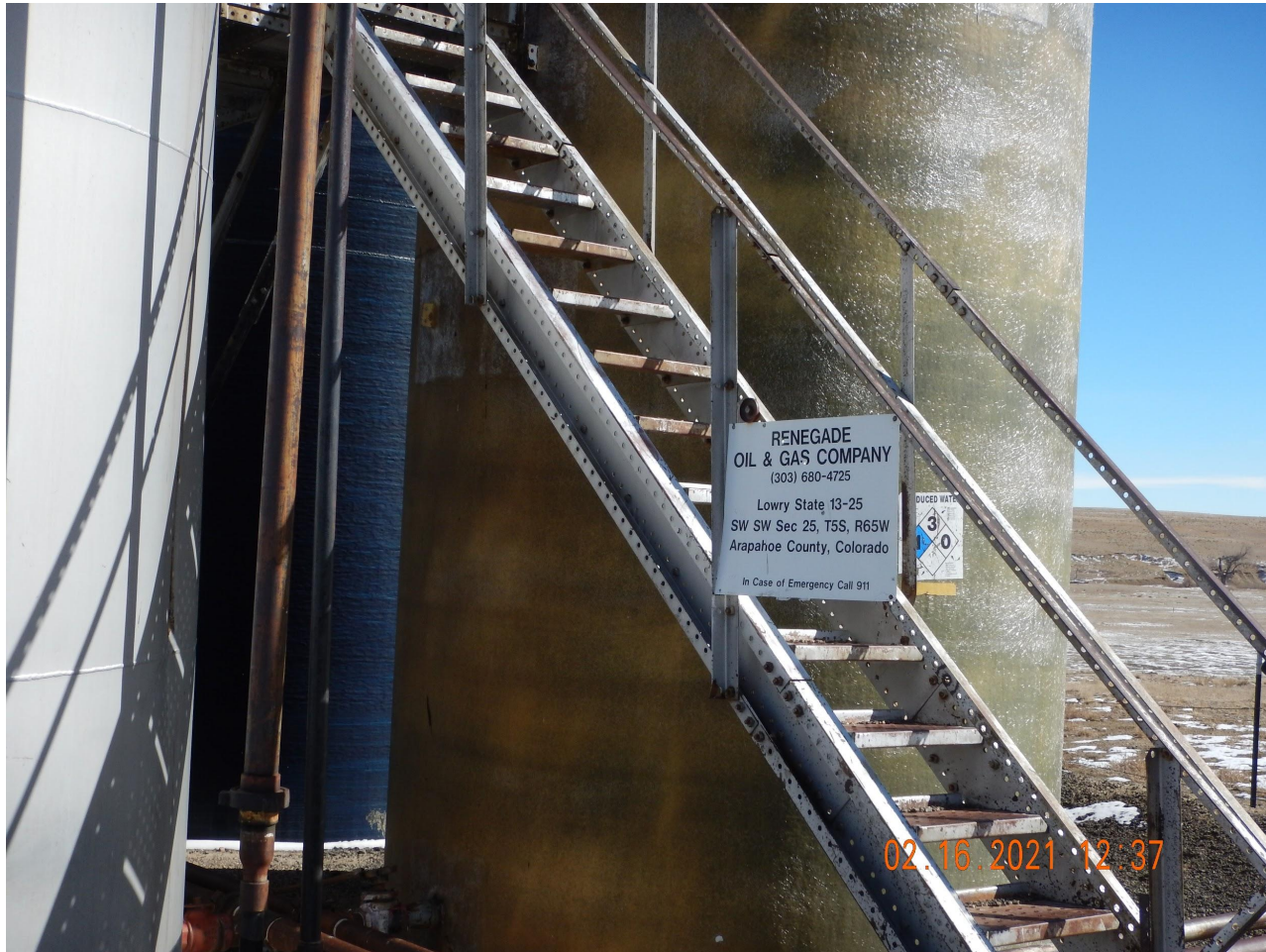
Photo 1. Photo taken of the Operator sign at the tank battery.