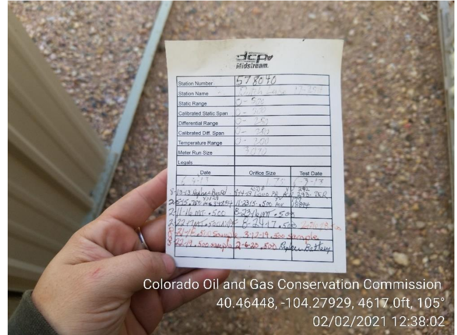
Colorado Oil and Gas Conservation Commission 40.46448, -104.27929, 4617.0ft, 105° 02/02/2021 12:38:02