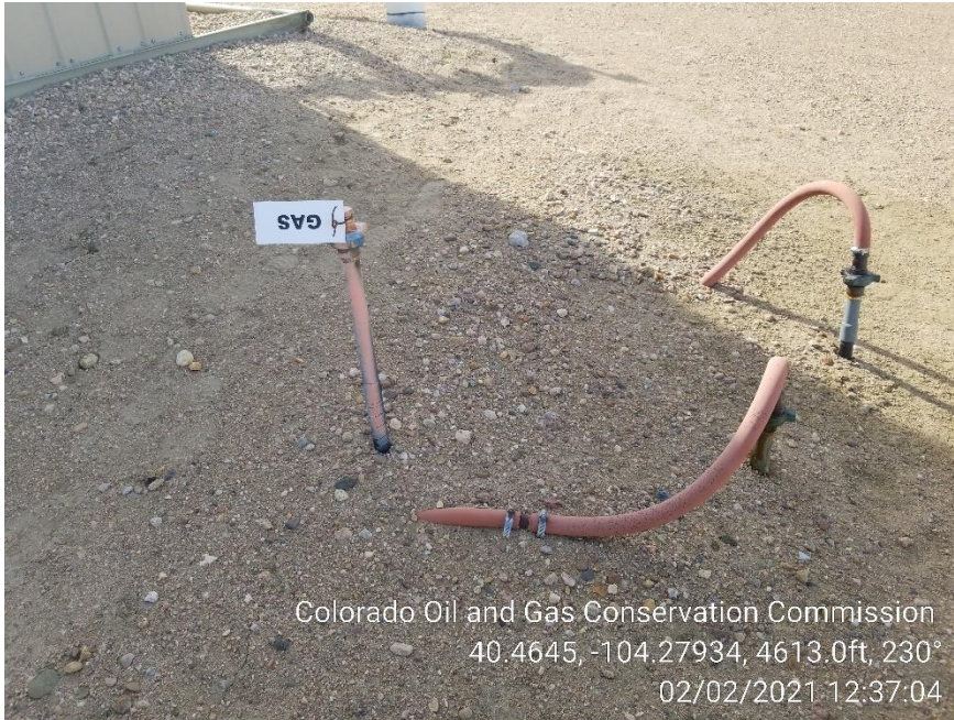
Colorado Oil and Gas Conservation Commission 40.4645, -104.27934, 4613.0ft, 230° 02/02/2021 12:37:04