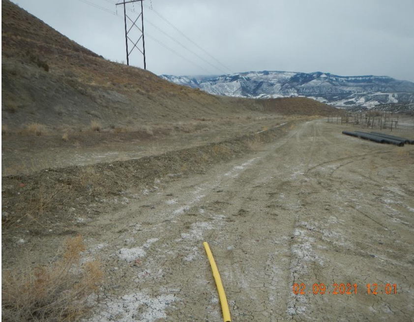
Deadman marker broken off and not at deadman.