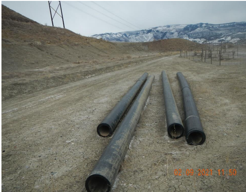
Unused equipment (polylines)