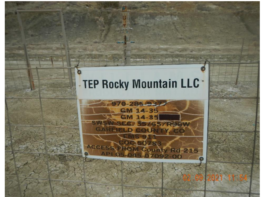
Weathered well sign