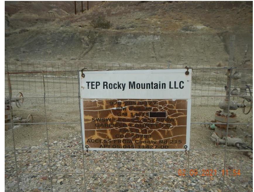
Weathered well sign