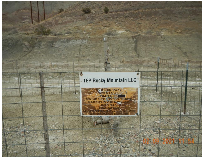
Weathered well sign