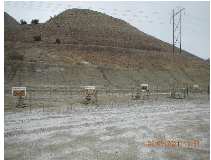
Weathered well signs