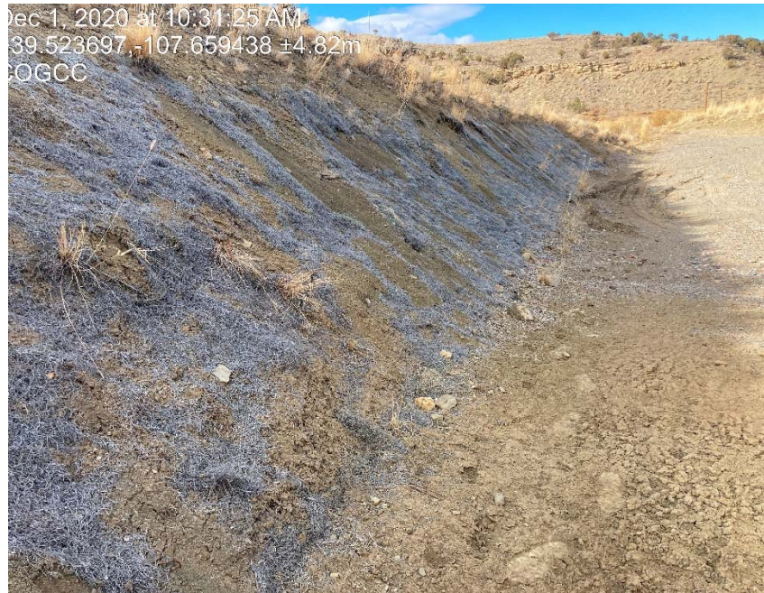
Previous inspection photo of lack of stabilization