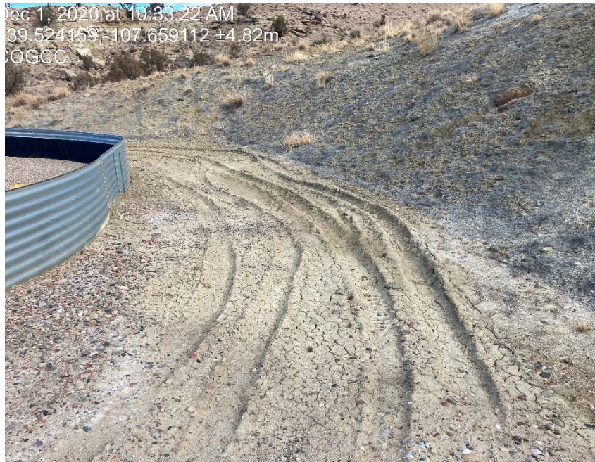
Previous inspection photo of lack of stabilization