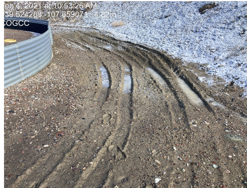
Follow up inspection photo shows that nothing has been done about the lack of stabilization on the pad