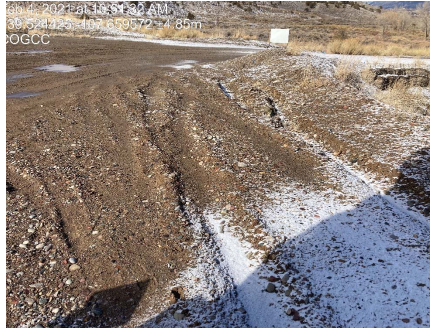
Follow up inspection photo shows that nothing has been done about the lack of stabilization on the pad