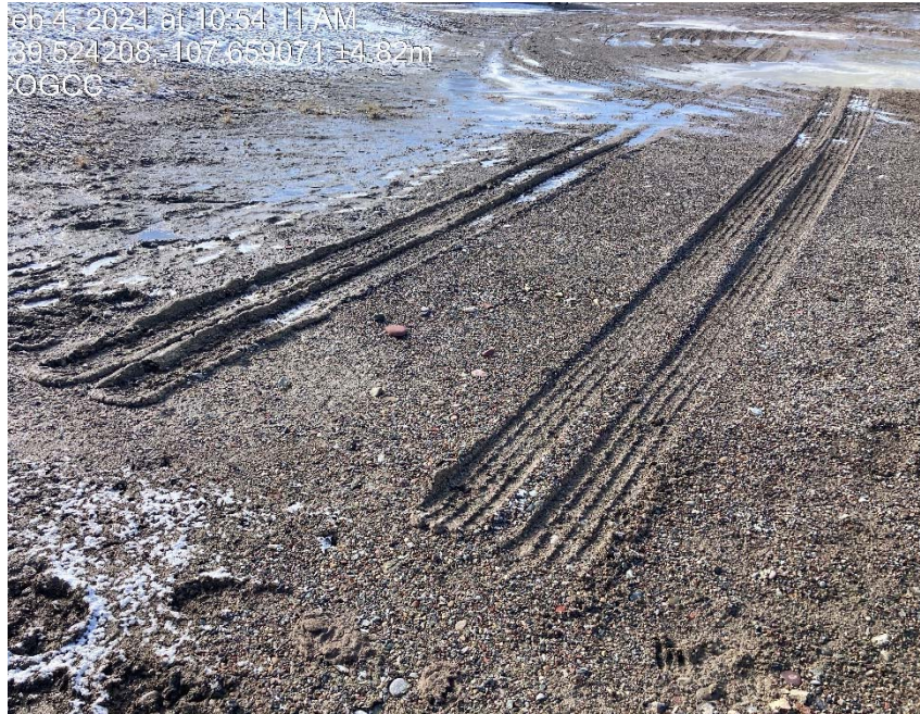
Lack of stabilization