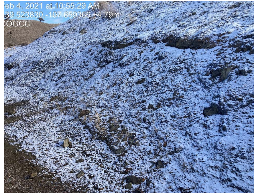
Follow up inspection photo shows that nothing has been done about the lack of stabilization on the cut slope