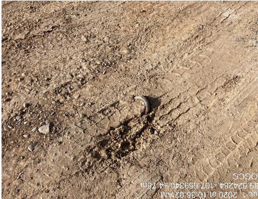
Unmarked dead man from previous inspection