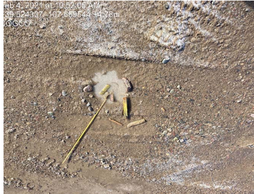
Follow up photo shows dead man was attempted to be marked but not marked appropriately