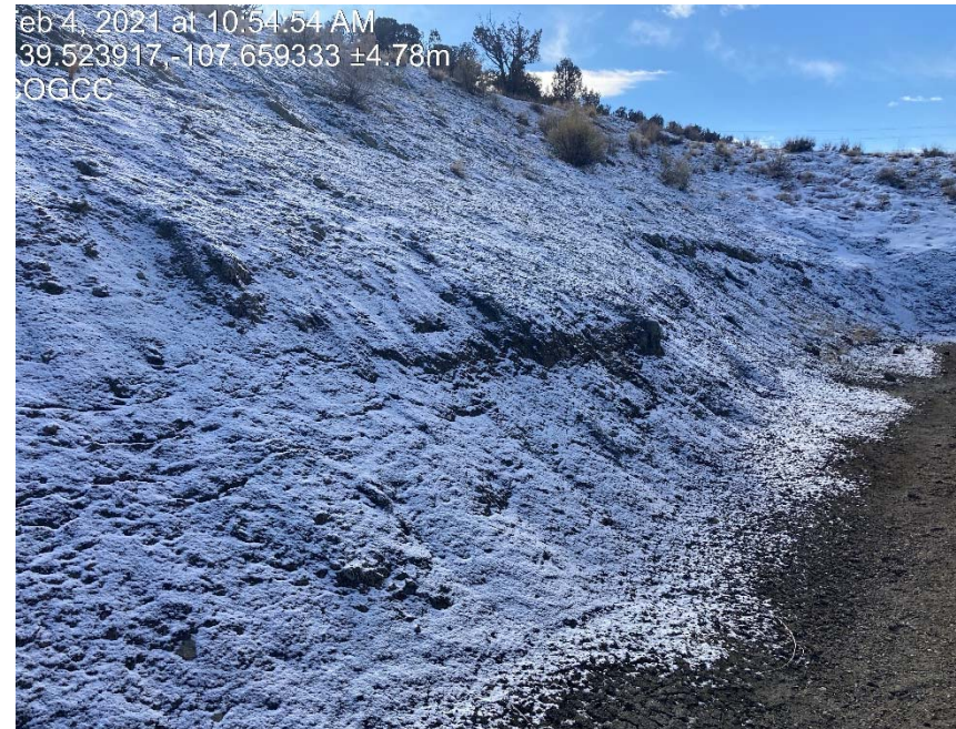
Follow up inspection photo shows that nothing has been done about the lack of stabilization on the cut slope