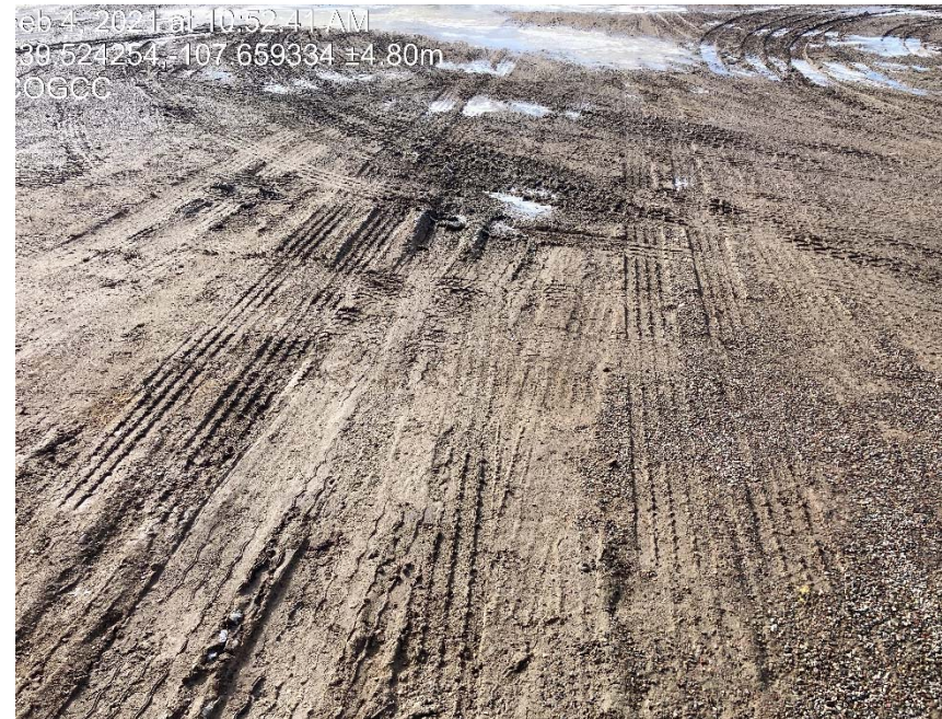
Follow up inspection photo shows that nothing has been done about the lack of stabilization on the pad