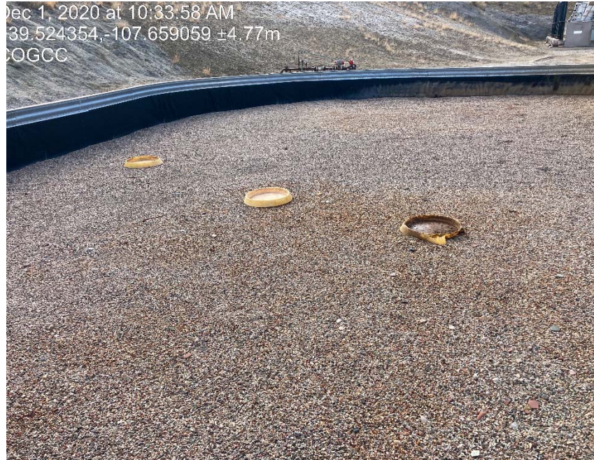
Debris from previous inspection