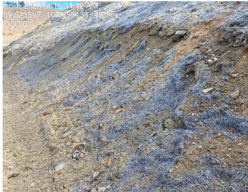
Previous inspection photo of lack of stabilization