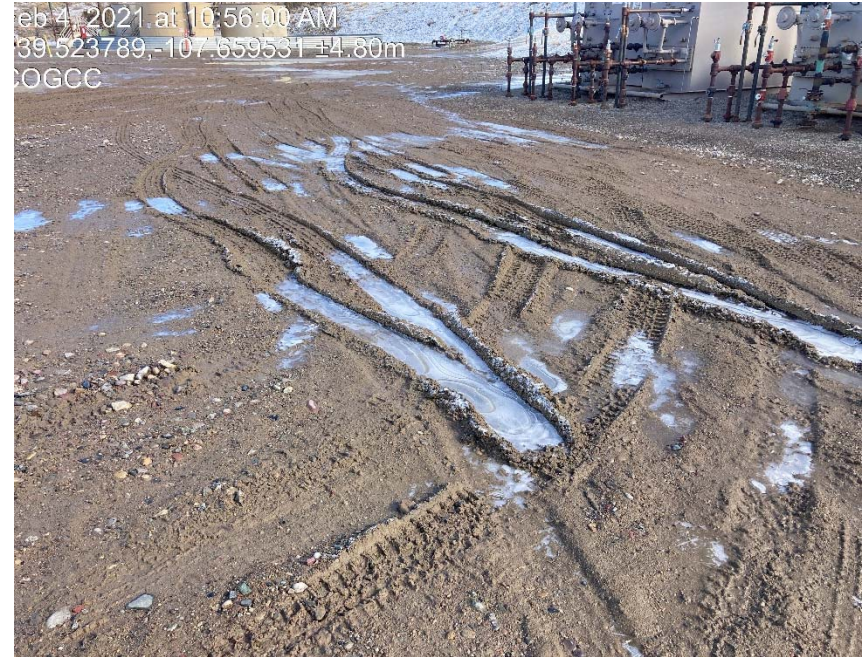
Lack of stabilization