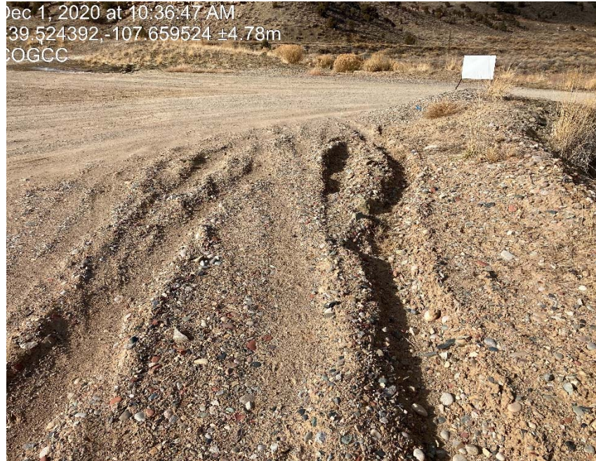
Previous inspection photo of lack of stabilization