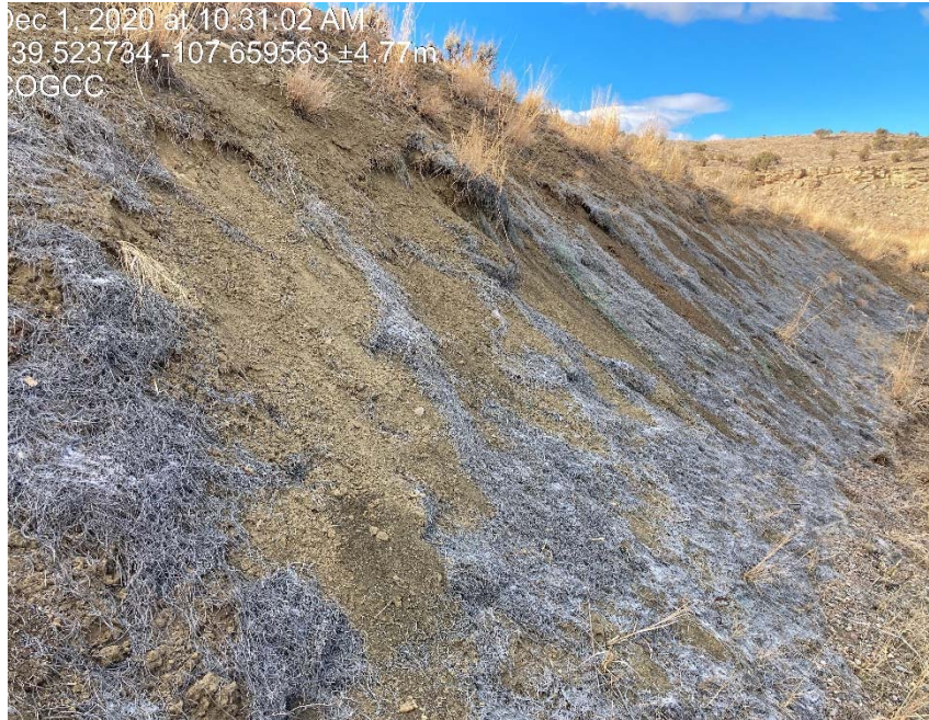
Previous inspection photo of lack of stabilization