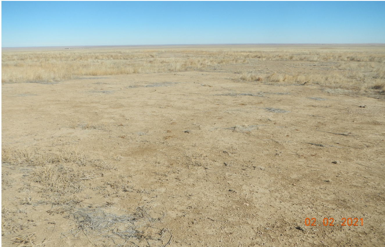
Photo 1. Facing east toward the location. The location has not been reclaimed and vegetation has not established. Previous corrective action was not performed.