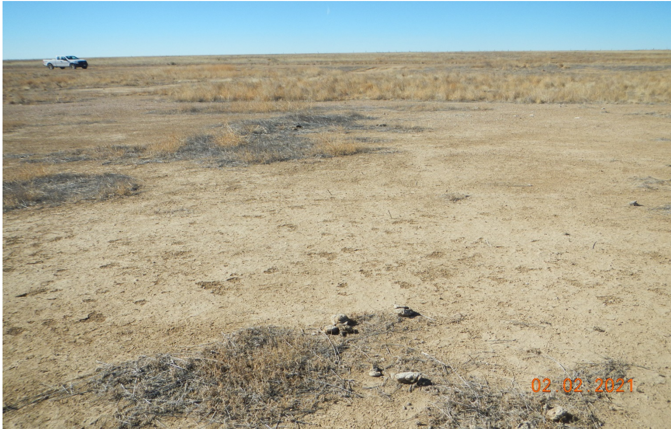
Photo 3. Facing west at the center of the location. This area is bare of vegetation cover.