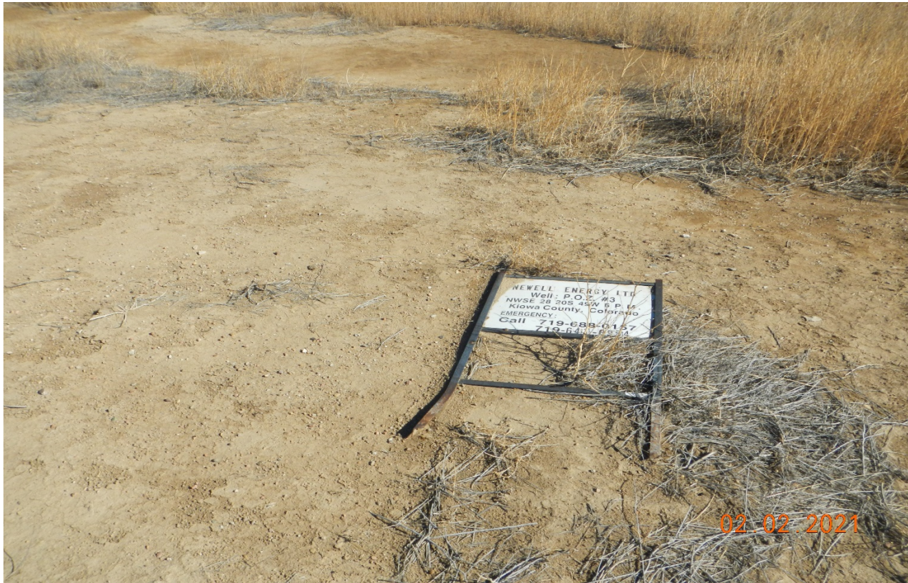
Photo 5. Location sign is laying on the ground.