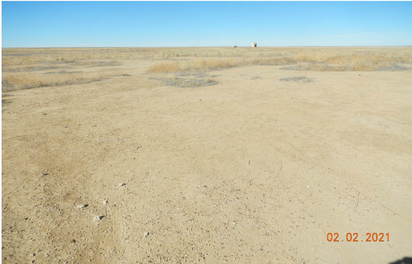
Photo 2. Facing north toward the location. There are large areas of the location that have no vegetation cover.