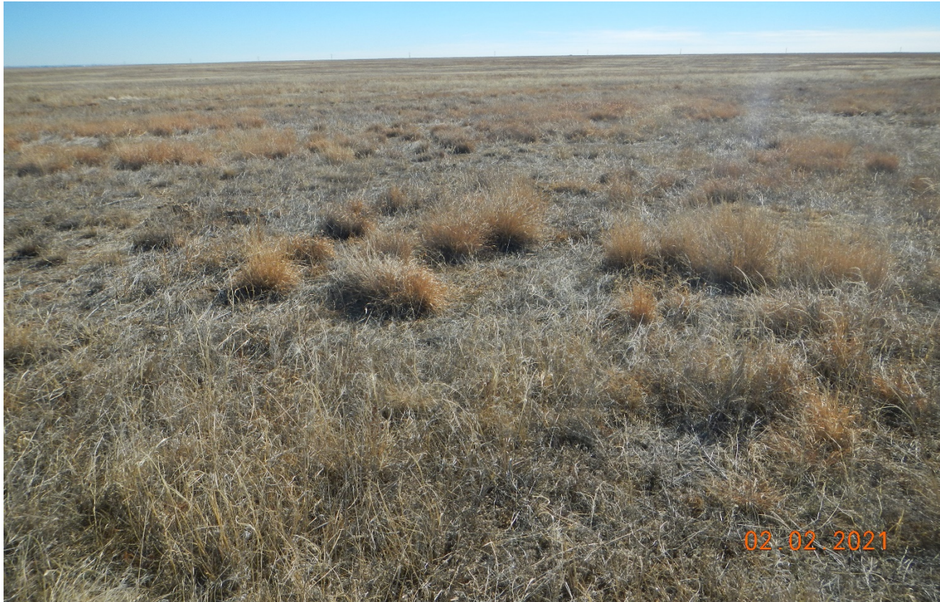
Photo 6. Facing south toward the surrounding undisturbed pasture which consists of uniform vegetation cover.