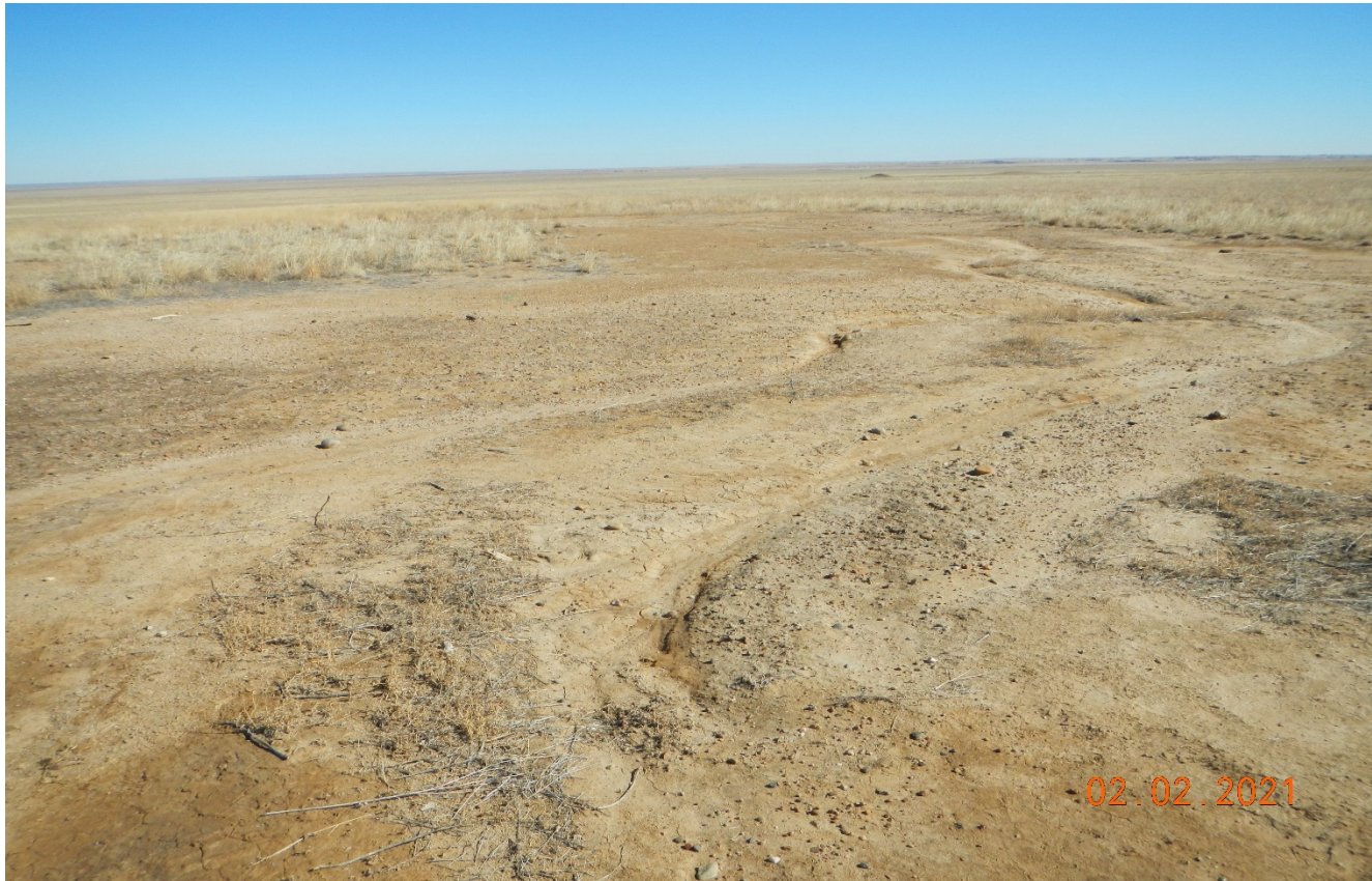
Photo 8. There is no vegetation growth downhill of the tanks indicating a possible spill occurred.