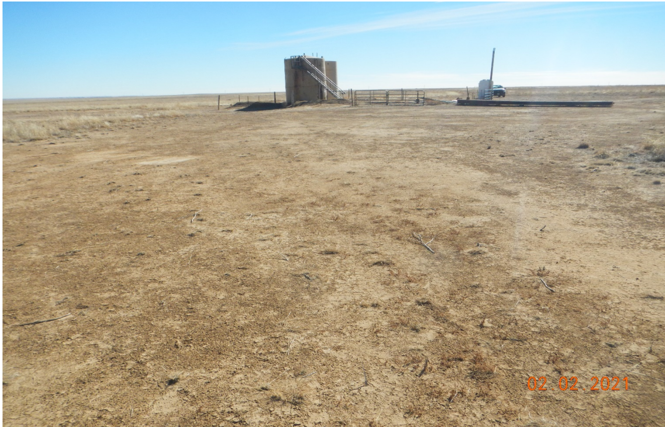
Photo 4. Facing south toward the location. Unused areas of the location are bare of vegetation cover. Interim reclamation has not been performed.