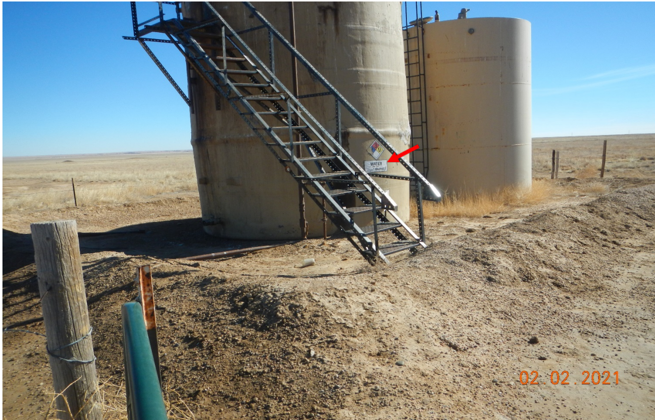
Photo 6. Facing toward the tanks. Tank shown at red arrow is labeled produced water. Other tank contents are not labeled.