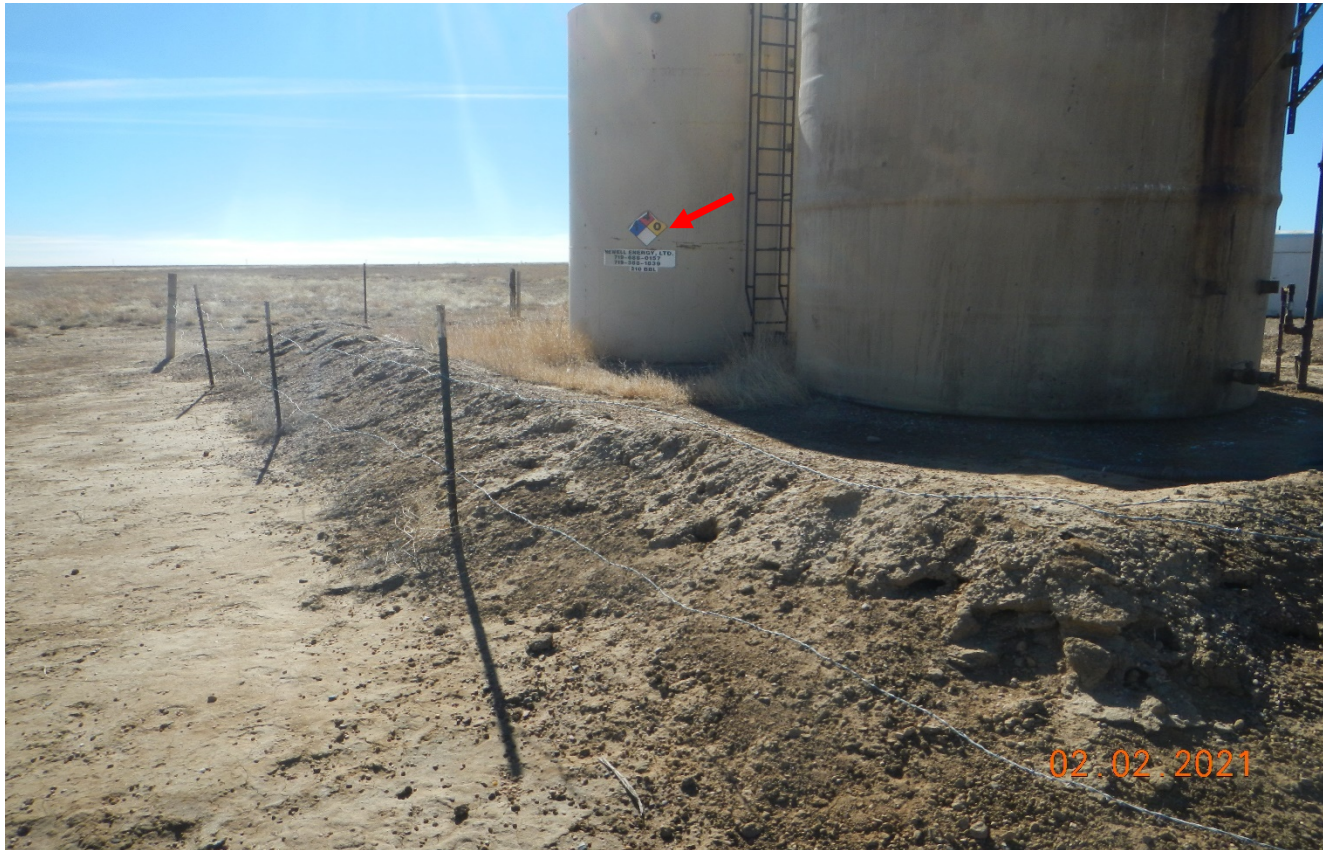
Photo 10. Facing toward the tanks. The berm around the tanks is degraded and has holes in the side. The labeling is shown on the back side of the tank and needs to be posted where it is visible front the front side. Tank does not have contents labeled.