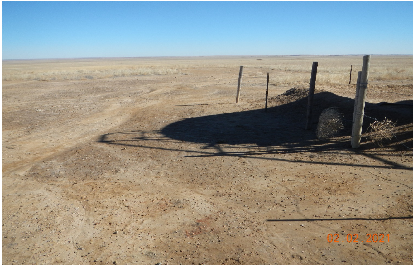
Photo 7. Facing east near the tank. There is no vegetation growth downhill of the tanks indicating a possible spill occurred.