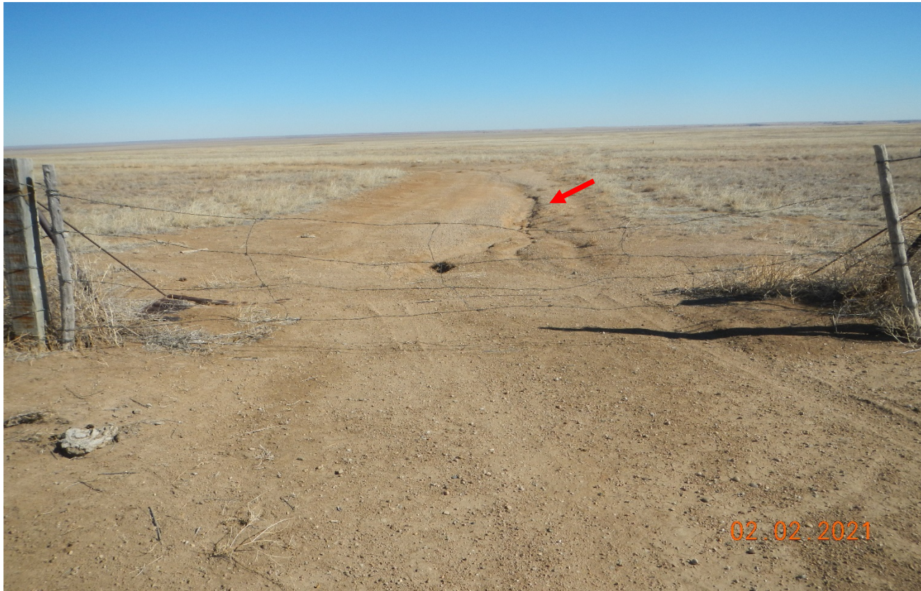
Photo 1. Facing east along the access road. The cattle guard is filled in with sediment and is not maintained. There is erosion occurring down the road shown at red arrow.