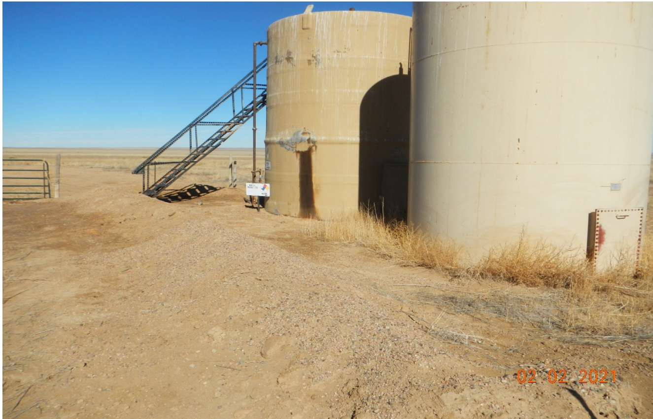
Photo 11. Facing toward the front side of the tanks.