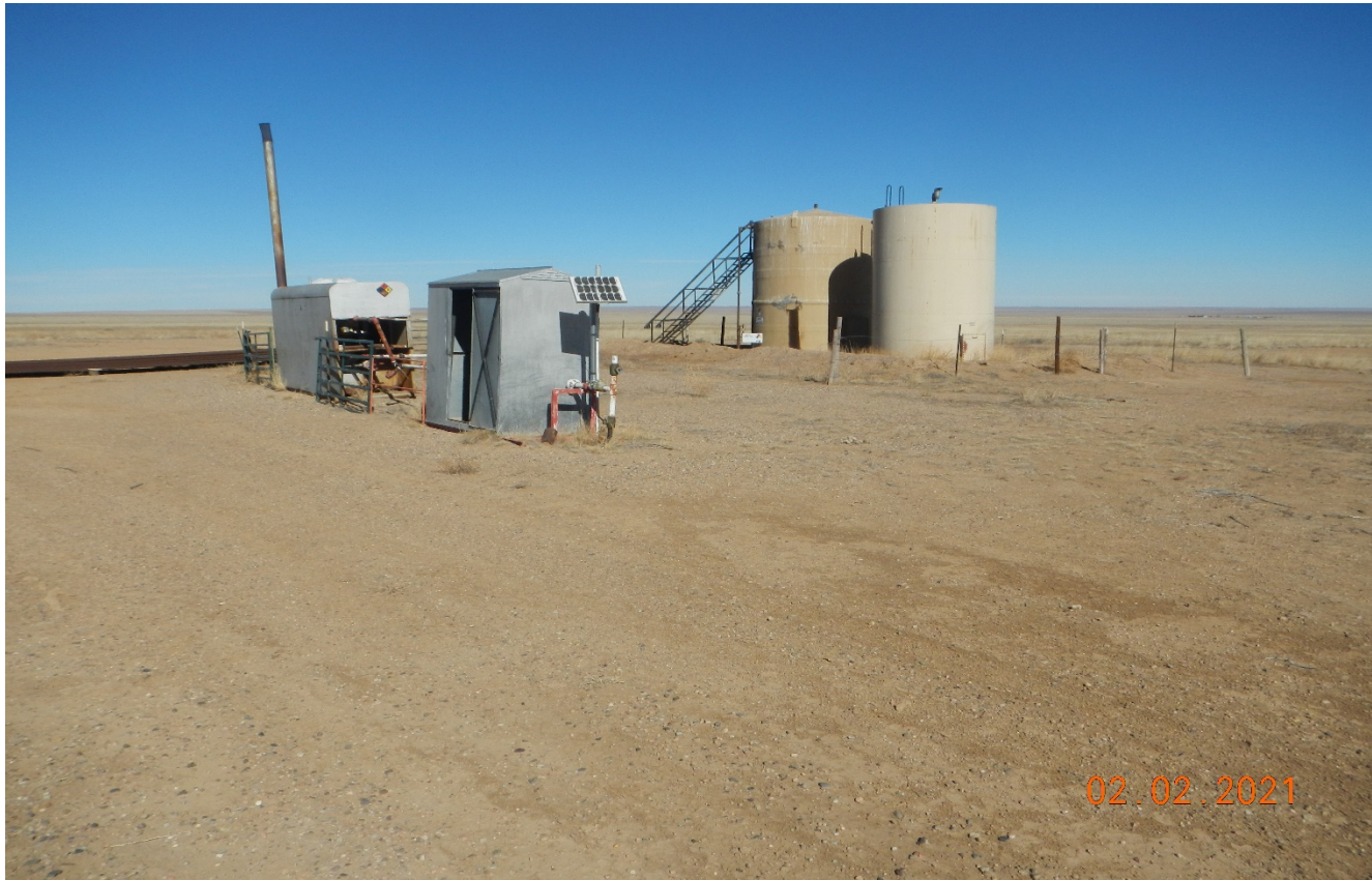
Photo 2. Facing northeast toward the location.