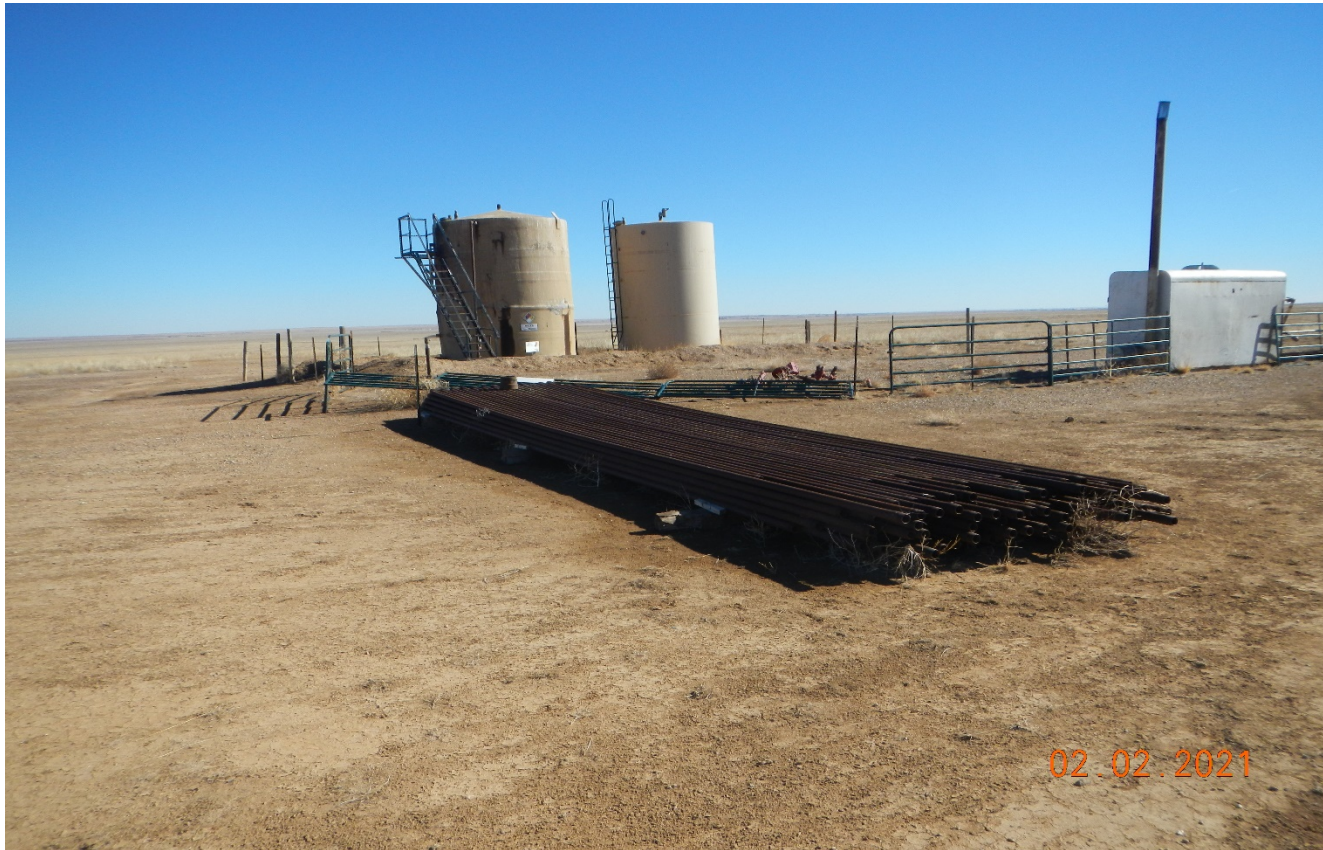
Photo 3. Unused pipe remains at the location. Previous corrective action was not performed.