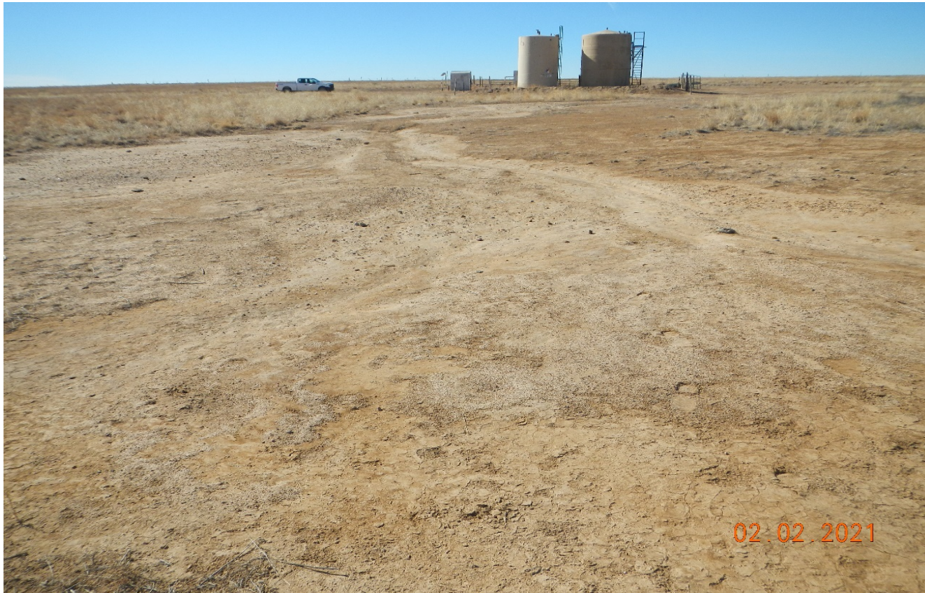
Photo 9. Facing west at the area which is bare of vegetation. It appears this area may have been impacted from a potential spill. This bare area extends 300 ft. downhill from the tank battery.