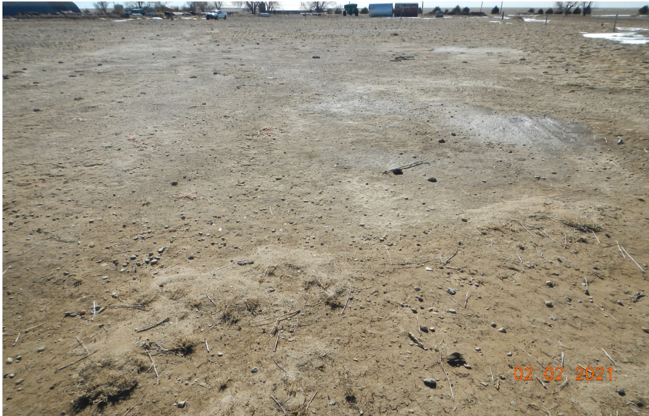
Photo 2. Facing north toward the location. The location has not been reclaimed.