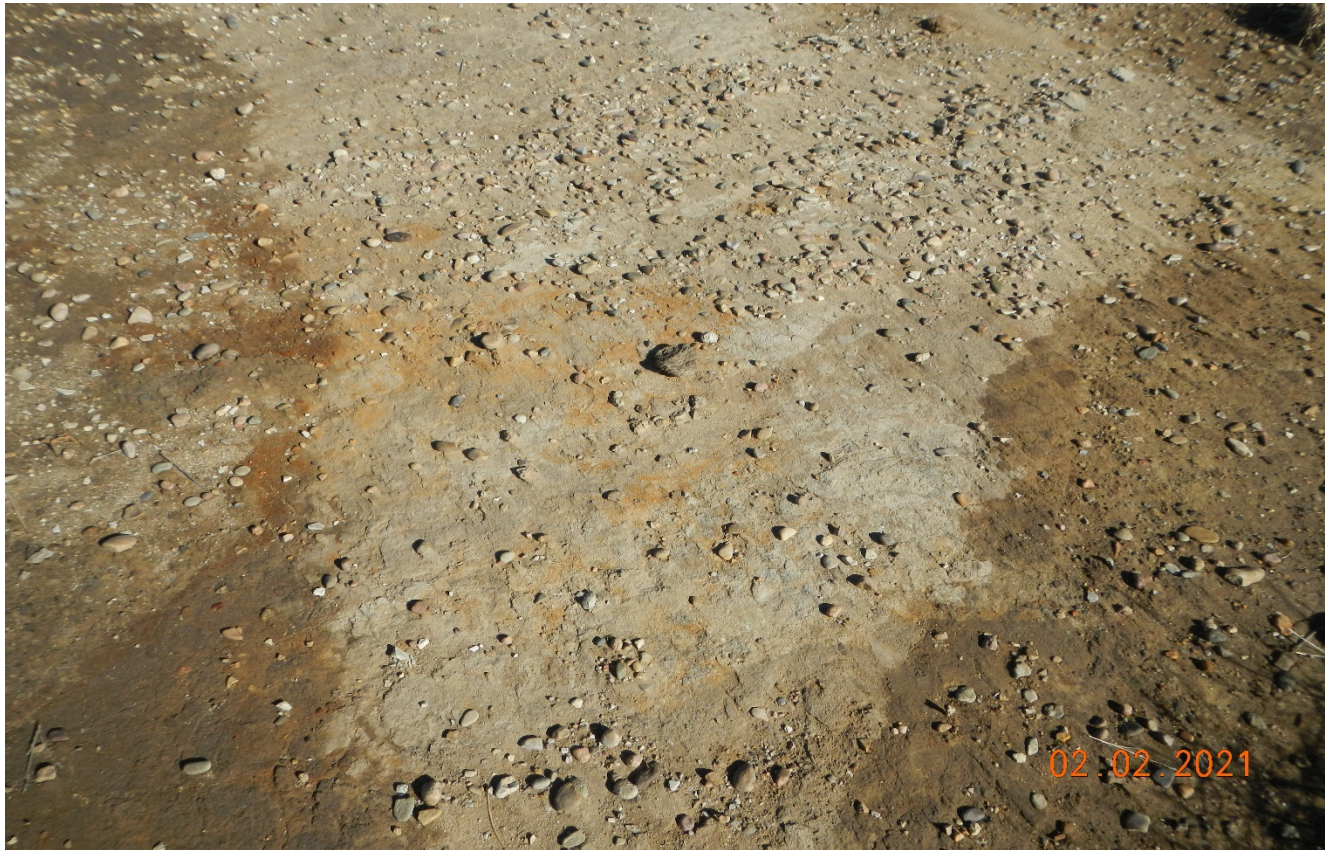
Photo 3. The soils appear to be compacted at the location.