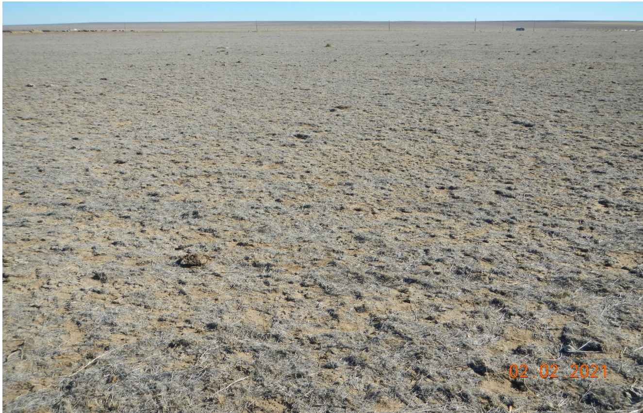
Photo 5. Facing west toward the surrounding undisturbed pasture.