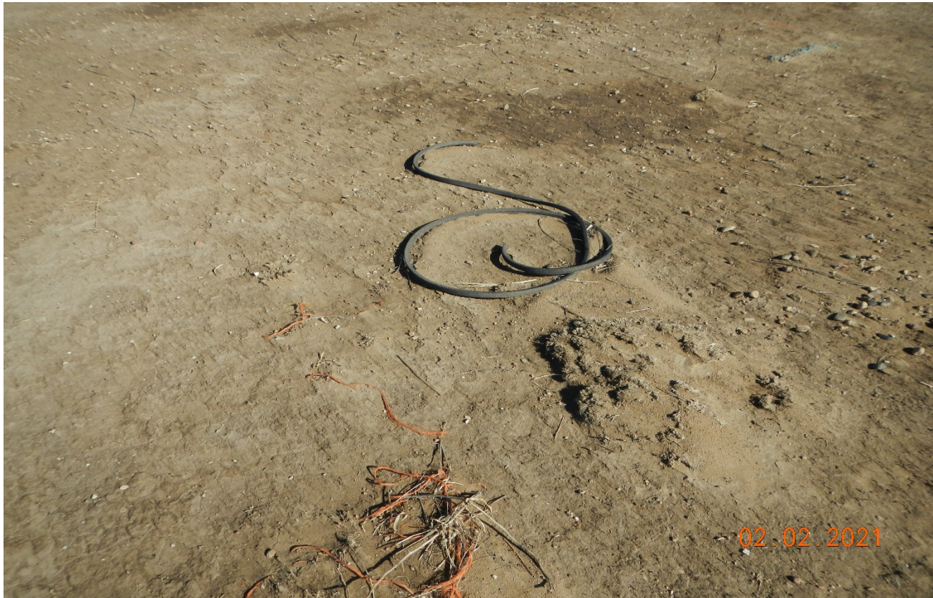
Photo 4. There is debris that remains at the location.